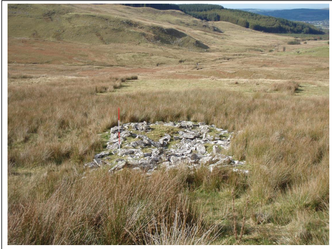
Figure 1. View from ESE (Cadw 2015)

Customer Reference Number (CRN): A0026759