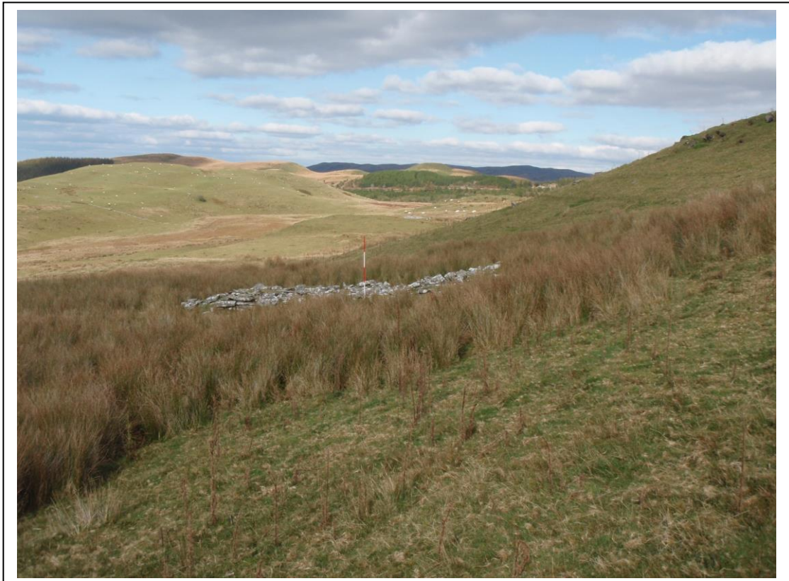
Figure 3. View from S, with cairn CDI38C visible behind (Cadw 2015)