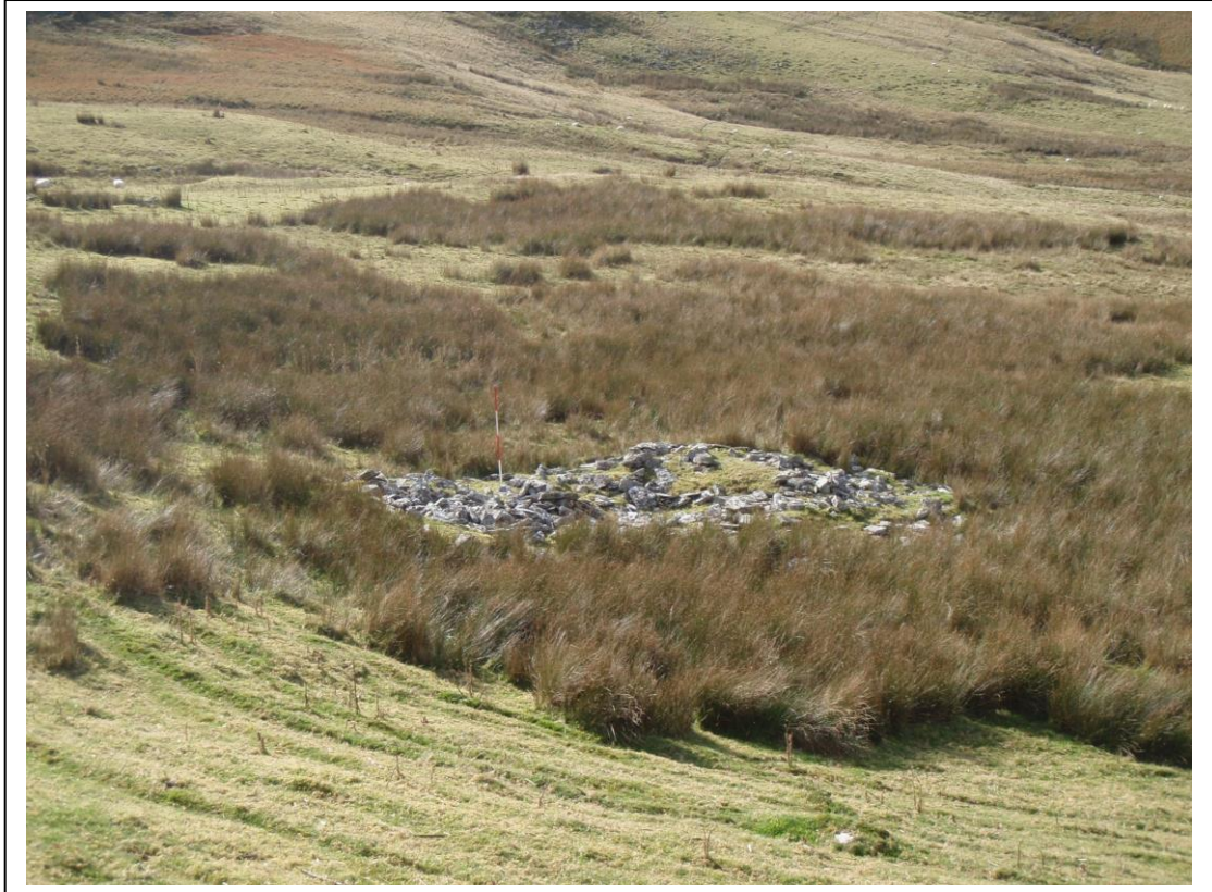
Figure 2. View from NE