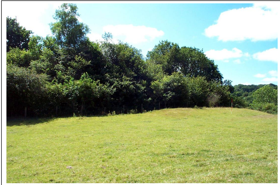
Figure 1. Counterscarp on NW seen from NE (Cadw 2006)

Customer Reference Number (CRN): A0028489