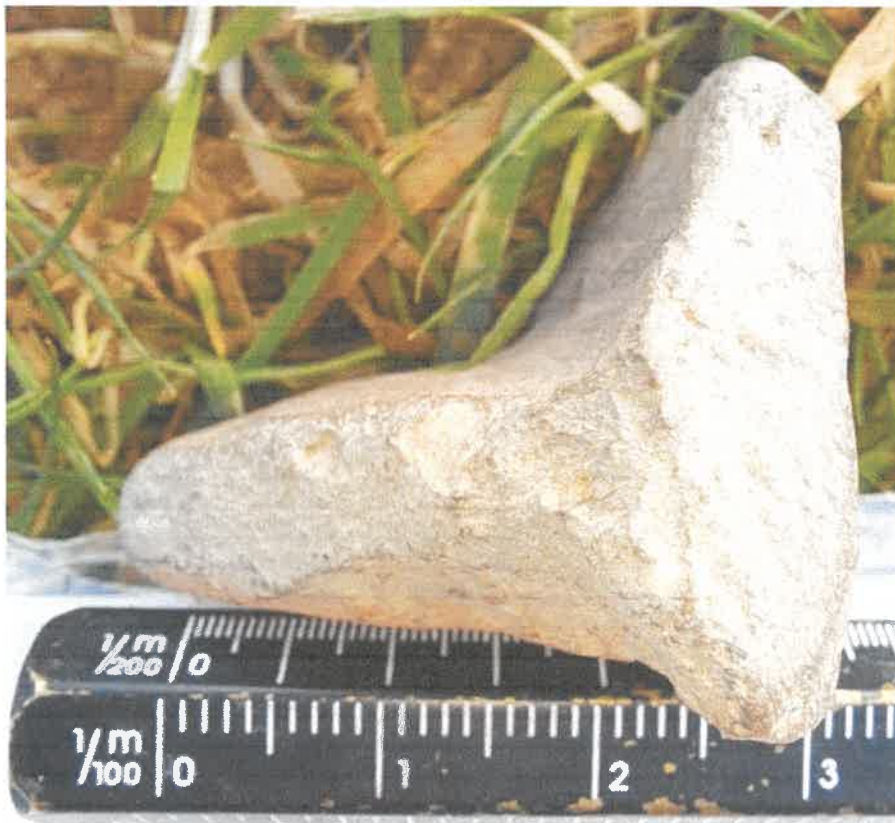
View of interior with finger mark baluster