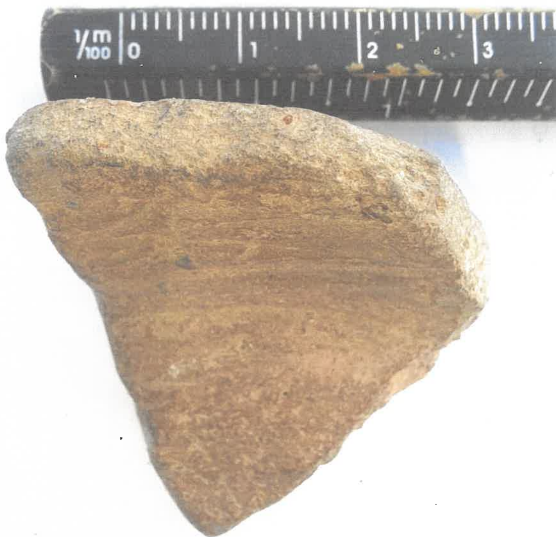
View of interior