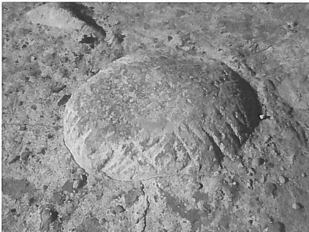
Photo 11: Rounded stone (PRN 106467) with cut marks on edges at Abermawr