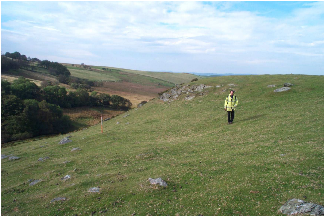
Platform (PRN 14715) terraced into the south-facing slope of Cwm yr Olchfa.