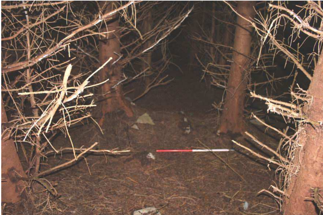
The remains of what was once a stone hut circle PRN 8576. Destroyed by forestry planting – photograph taken at dusk!