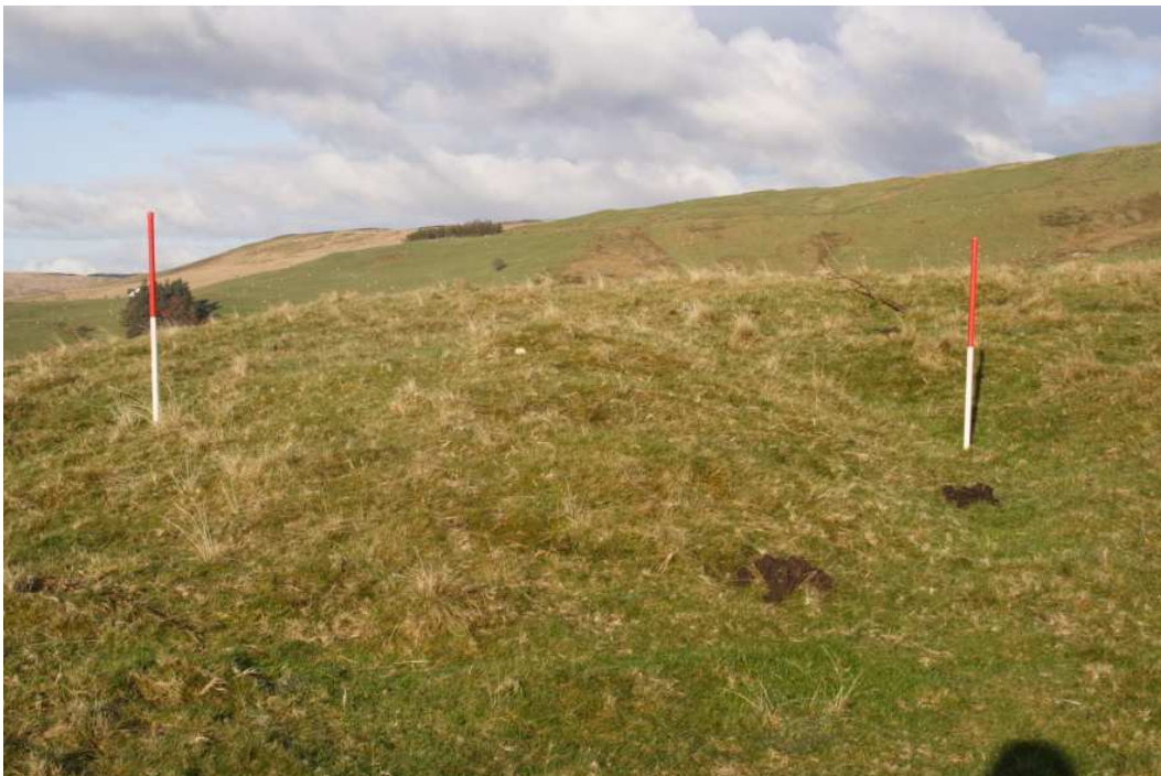
Banc Bryn-chwith cairnfield, Cwmrheidol – PRN 34938