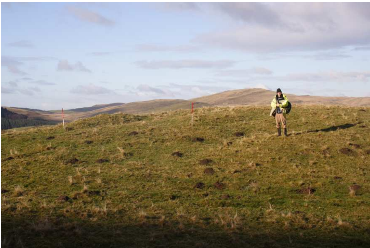
Banc Bryn-chwith cairnfield, Cwmrheidol – PRN 34938

Prepared by Dyfed Archaeological Trust For Cadw