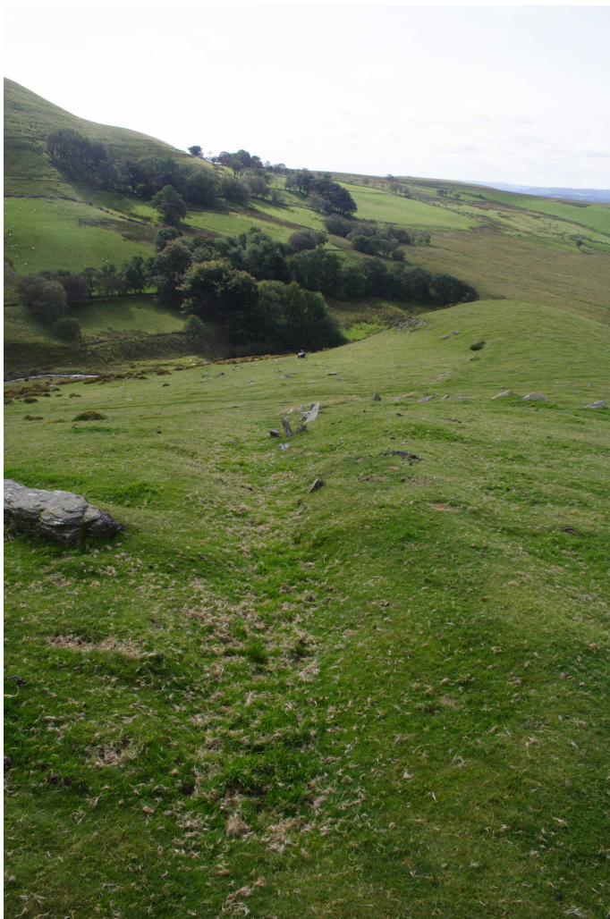
Looking southwest along the line of linear bank and ditch (PRN 14720) that appears to act as a northern boundary to a group of possible prehistoric platforms that lie to the south (PRNs 14714-14719).