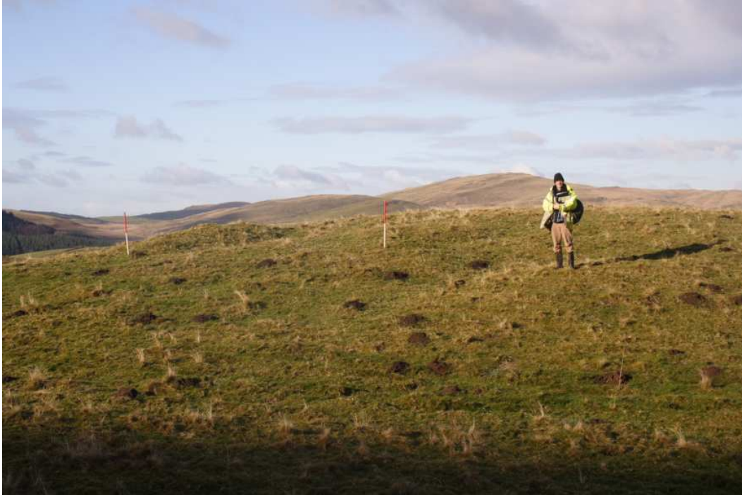
Banc Bryn-chwith cairnfield, Cwmrheidol – PRN 34938