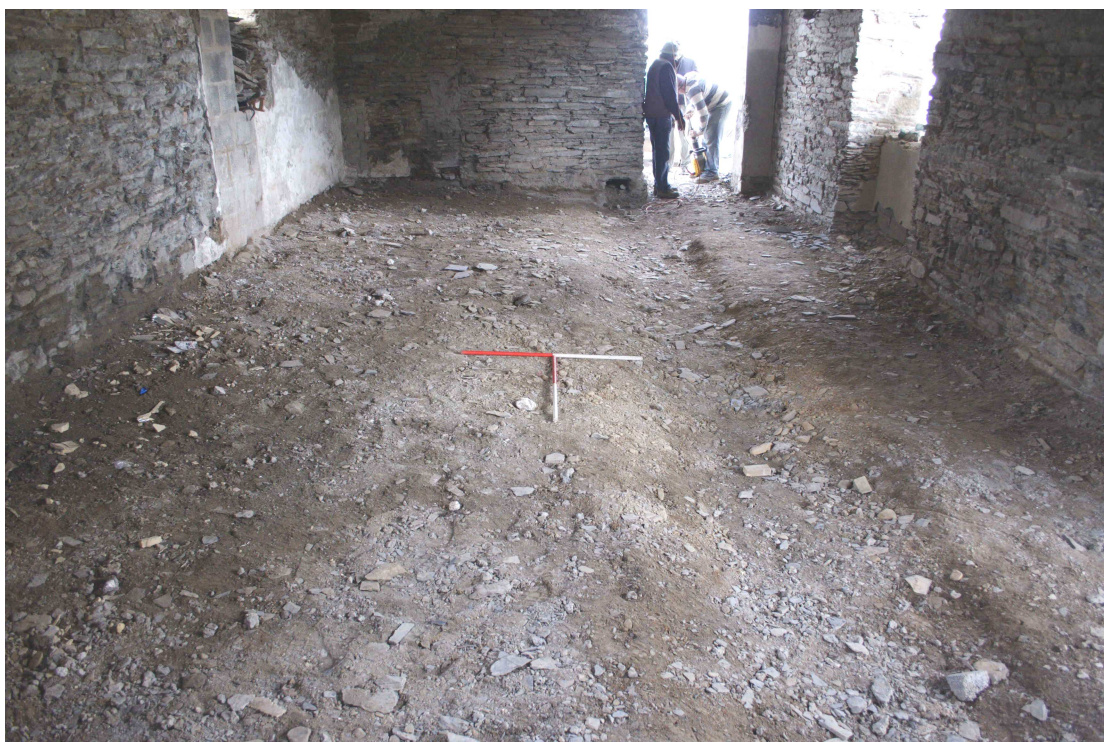
Photo 1: Northwest view of cattle byre with trough/drain to right.