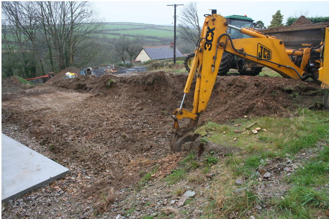
Plate 1: General view southwest across the watching brief area, looking southwest

Despite the potentially sensitive location of the site, the groundworks required for the construction of the new house revealed no features of archaeological interest and therefore had no impact on the archaeological resource at Wolf's Castle.