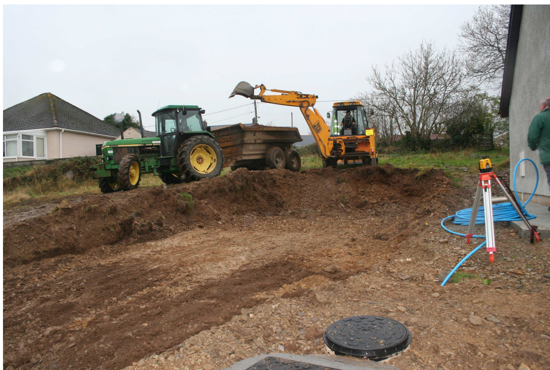
Plate 2: A view northwest across the site during groundworks.