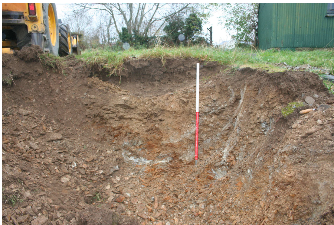
Plate 3: A detail of the natural deposits revealed by the groundworks, looking north.