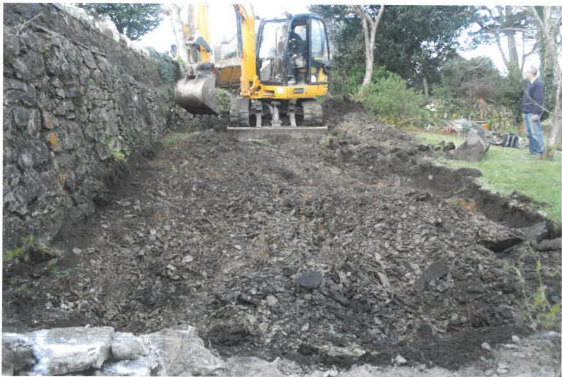
Photo. 1: Site after checking the top of bedrock for any features. View W