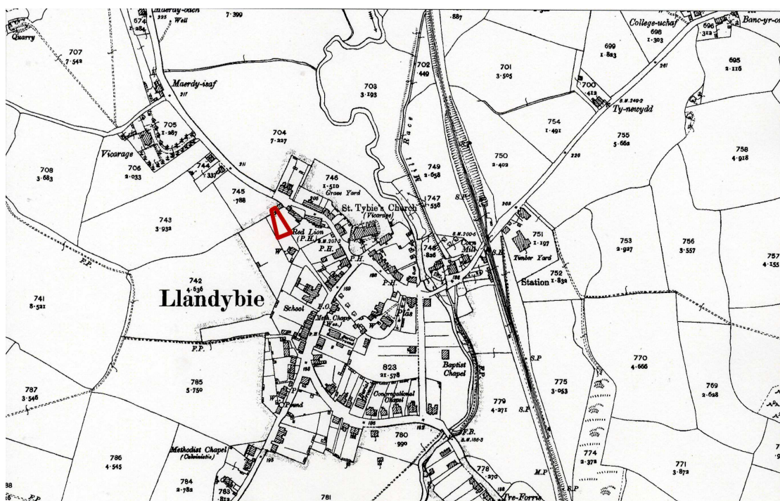
Figure 3: Extract of 2 nd edition 1:2500 OS map (1906) showing development area in red.