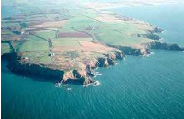
West Angle to Freshwater West Coastal Strip: part of the Milford Haven waterway registered landscape

The Register of Landscapes of Outstanding Historic Interest (Register of Landscapes of Outstanding Historic Interest in Wales. Cadw/ICOMOS UK. 1998) recognises that historic landscapes are one of Wales' most valuable cultural assets being a special, often fragile and irreplaceable part of our heritage. These are large areas which retain physical evidence of the past, from the agricultural and ritual landscapes of prehistory to 19 th century industrial landscapes. Four of these Registered Landscapes lie within Pembrokeshire.