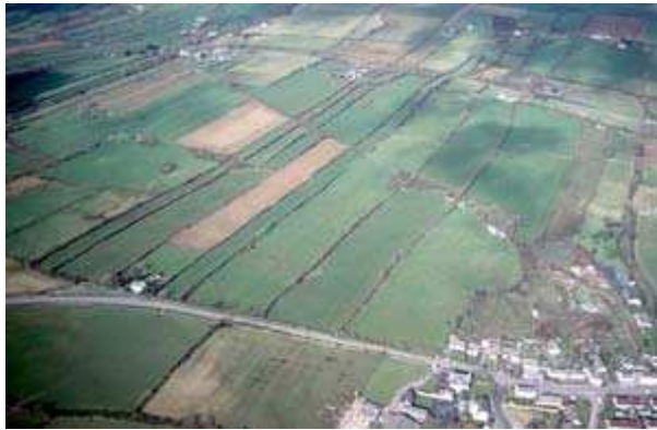
Manorbier strip fields