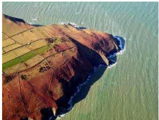
Part of the Poppit to Newport coastal strip within the Lower Teifi Valley registered landscape

A small part of this area lies within the county. The area as a whole contains evidence for continuity of land-use since the Bronze Age. Archaeological remains include Bronze Age ritual and funerary monuments; early medieval and medieval ecclesiastical and secular sites (St Dogmaels Abbey and Cilgerran Castle); gentry houses and early industrial sites.