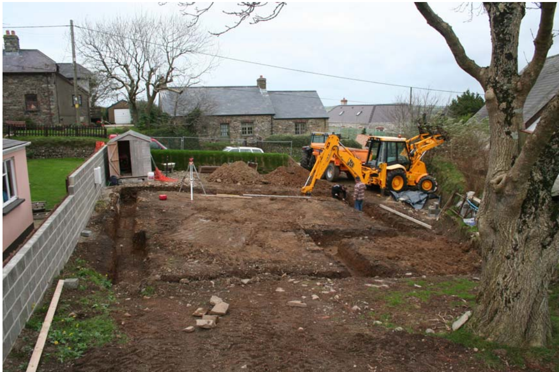
Plate 1: Foundation trenches near completion. View to north.

The LPA's archaeological advisor was informed that the foundation trenches had not produced any archaeological results and it was agreed there was no necessity to observe any further works on the site.