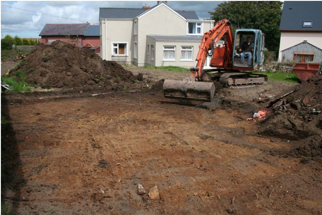
Plate 1: A general view northeast across the watching brief area.

The removal of the topsoil and turf revealed undisturbed silty clay subsoil. There were no archaeological features or deposits present.