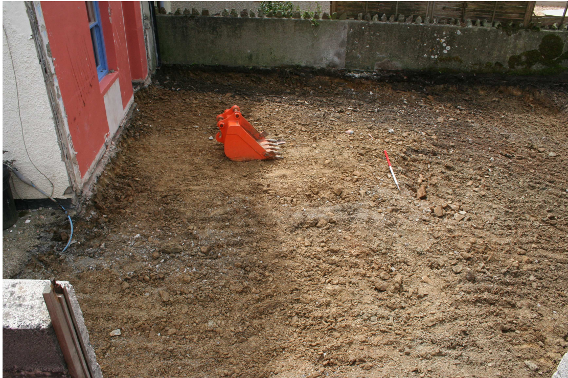
Plate 2: View south across the site.