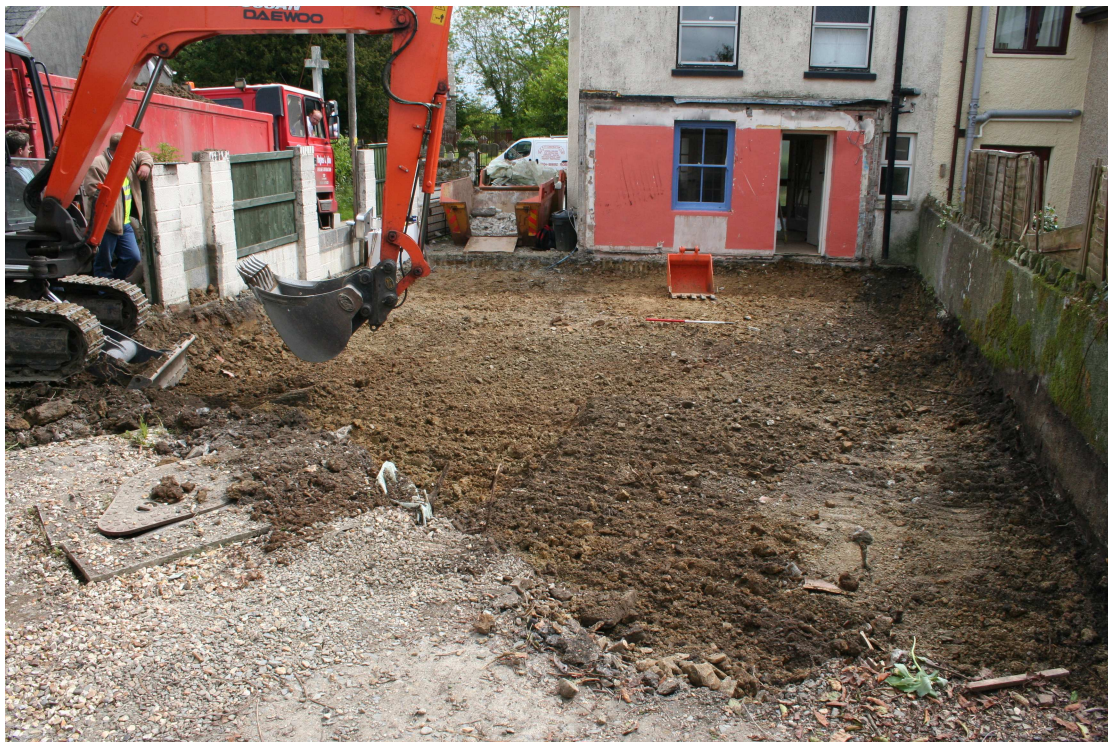
Plate 1: General view across the watching brief area, looking east

No features or deposits of archaeological interest were observed during the watching brief.