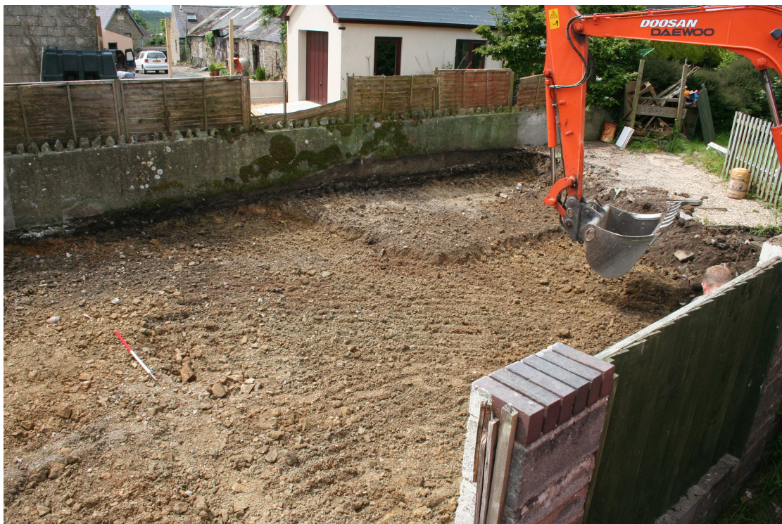
Plate 3: View southwest across the site during the groundworks.