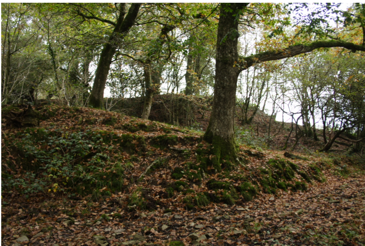
Blaen Maenog promontory fort defences.

Prepared by Dyfed Archaeological Trust For Cadw