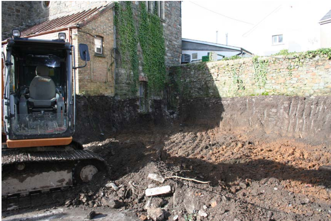
Plate 1: The watching brief area after excavation.

The material removed consisted of deliberately imported garden soil. No features of archaeological interest were noted.