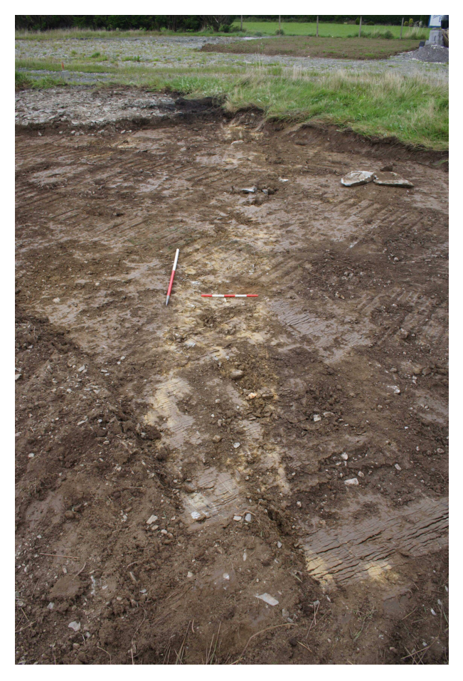
Photo 1: Looking north across the building plot at the revealed service trench.