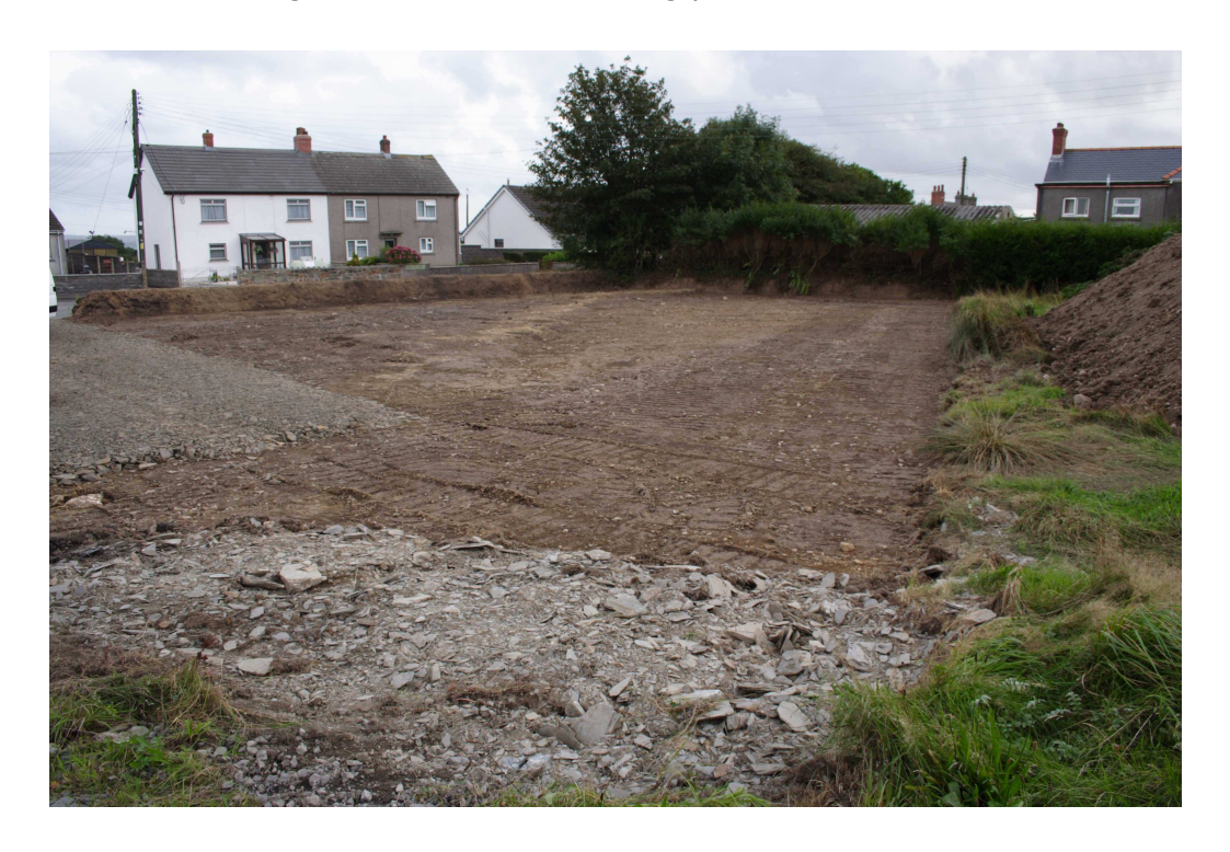
Photo 2: General view of Plot 4 after completion of the topsoil strip, looking south. Note the hard standing in the foreground.