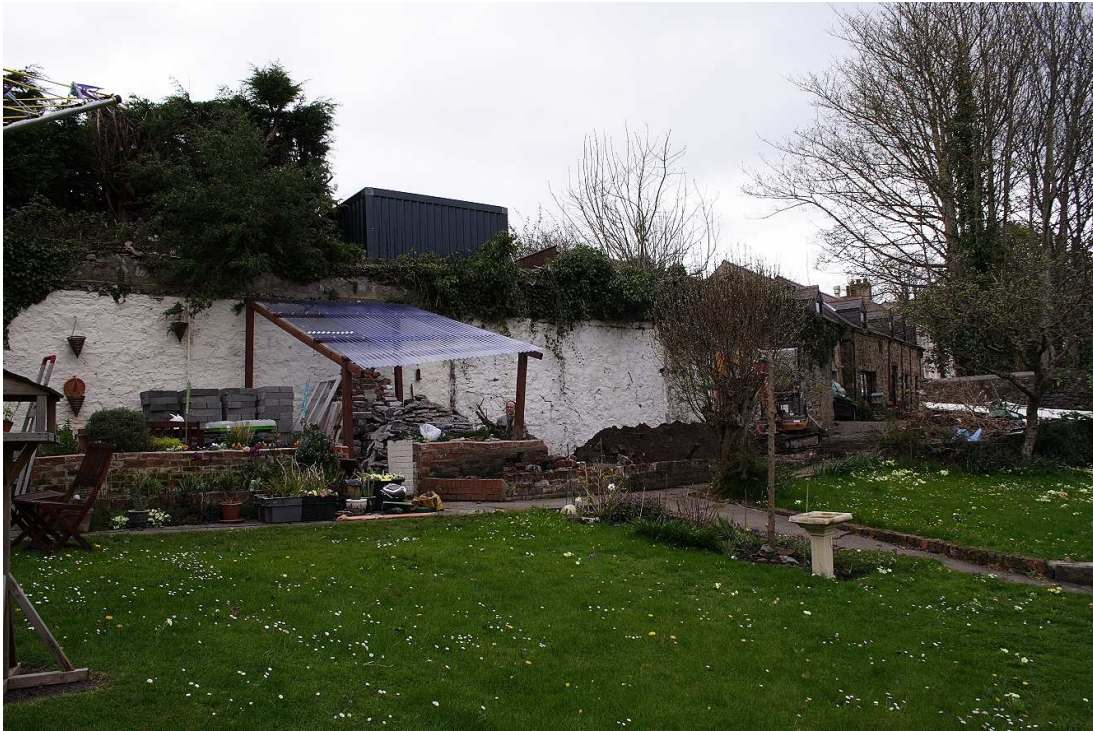
Photograph 3. General shot of building works.