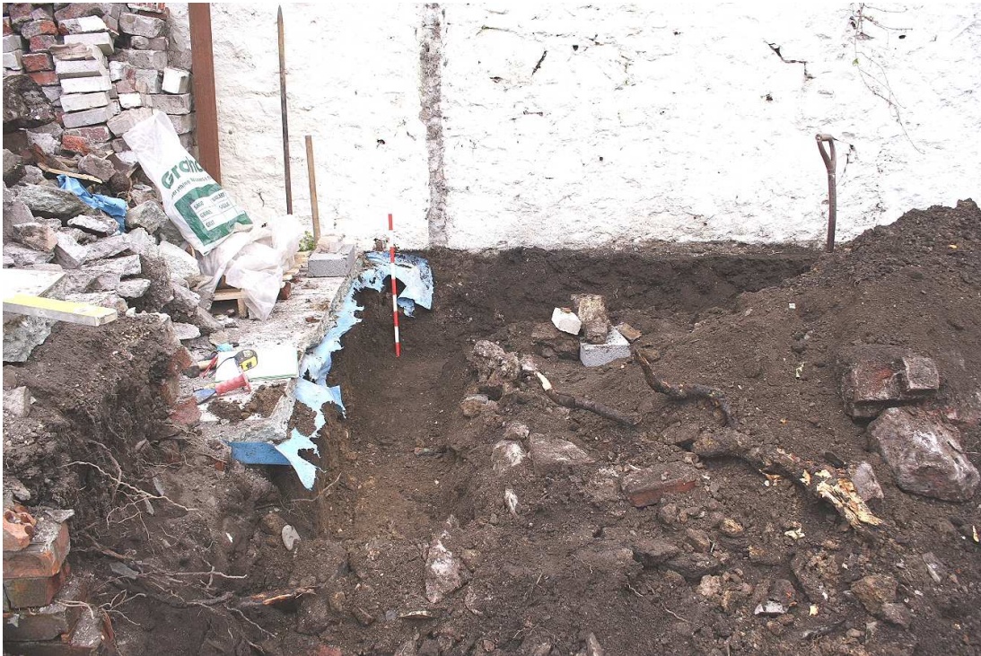
Photograph 1. General shot of building works.