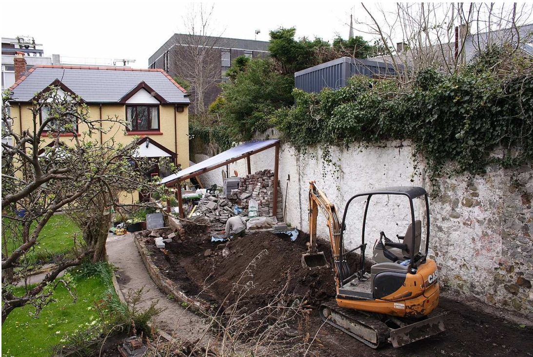
Photograph 4. General shot of building works.