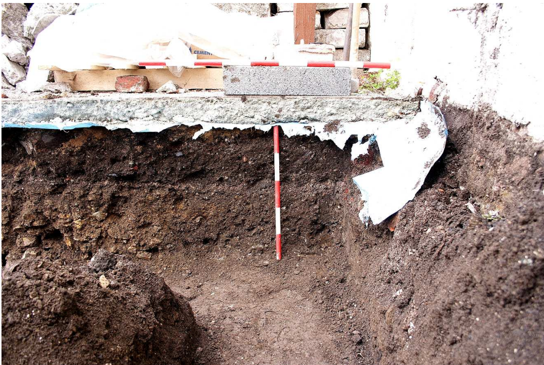
Photograph 2. Detail of possible ditch.