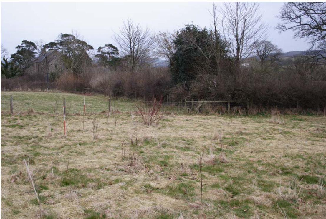
Photo 3: Red and white poles mark the possible northern edge of the Roman road. Glanrhyd Farm is visible in the background.