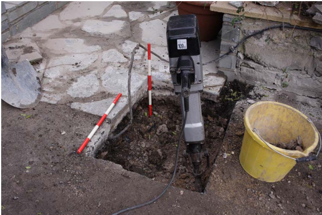
Plate 1: Pit 1 during excavation showing the made up ground below present tarmac surface.

No archaeological features or deposits were noted.