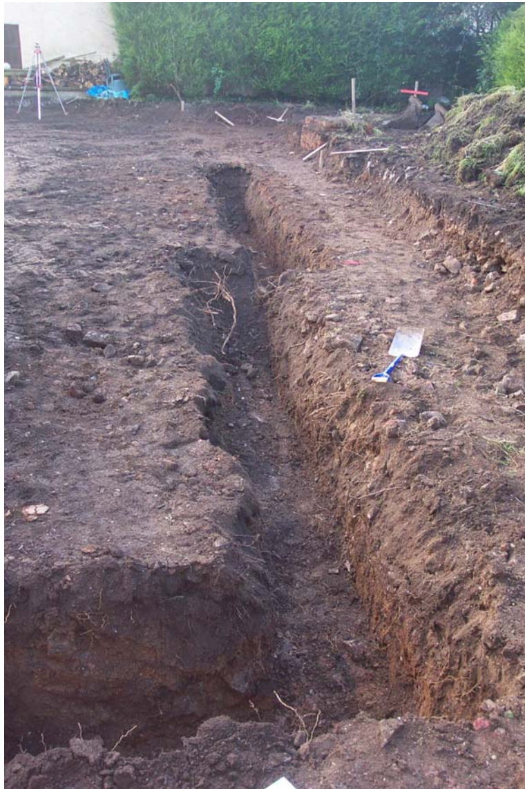
Plate 1: The rear foundation trenches.

Towards the front of the site the levelling exposed the light to mid brown subsoil and no archaeological features or deposits were exposed on any part of the site.