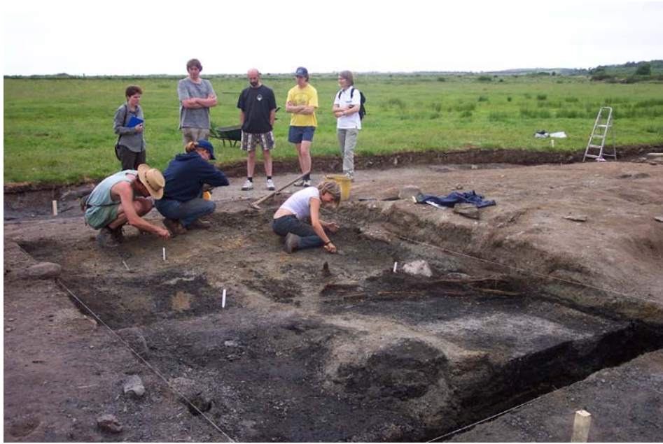
Plate 5: The pronounced gravel track overlying the industrial deposits in T4a. The group in the rear are standing on the clay shoulder that was added along the west side of the track.

The tops of several small posts and stakes were noted below the gravel of the trackway and cutting the industrial deposits. However, it was not clear if they were part of the trackway structure, like other posts and stakes along its course, or whether they were associated with the industrial activity.