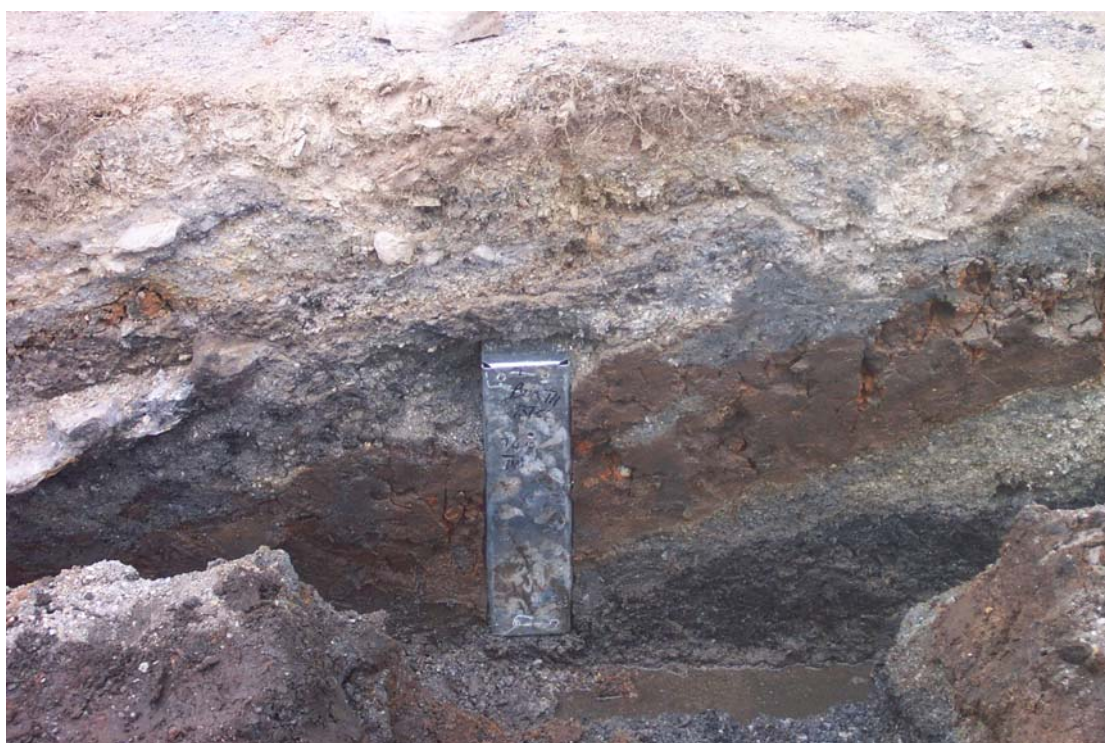
Plate 6: The peat development separating the two distinct phases of industrial activity in the south-facing section of T4b. The east – west slope of the deposits is clearly shown.

Above these deposits was a layer of brown peat (Plate 6). The peat appeared to have developed during a period of inundation and possibly corresponded with a decline of activity or possibly a period of abandonment. Initial assessment has identified rush seeds, root and stem material and charcoal within this material.