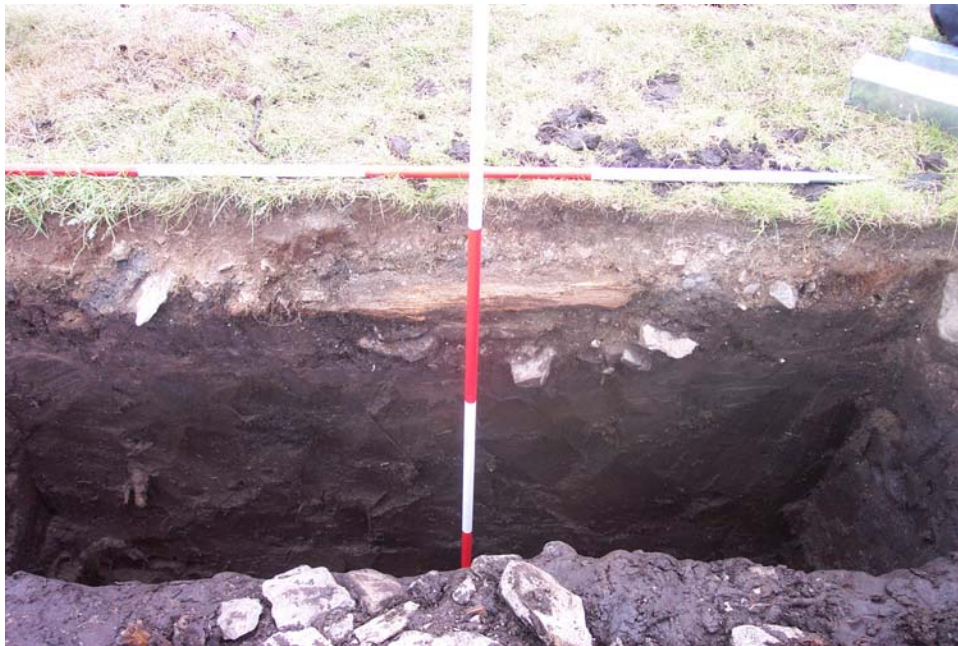
Plate 2: The construction sequence of the trackway revealed in section in T5a showing the stones below the timber and the overlying gravel surface.

The timbers were laid on patches of stones and gravel which had been laid, or dumped on the peat surface. Compression had pushed some of the stones into the top of the peat (Plate 2). However, for the most part they formed patches on the surface. It is not clear if they were the intermittent remains of what was formerly a continuous stone causeway across the bog or whether they were dumps of stones used to level wet hollows in the surface of the peat prior to the timber track being laid.