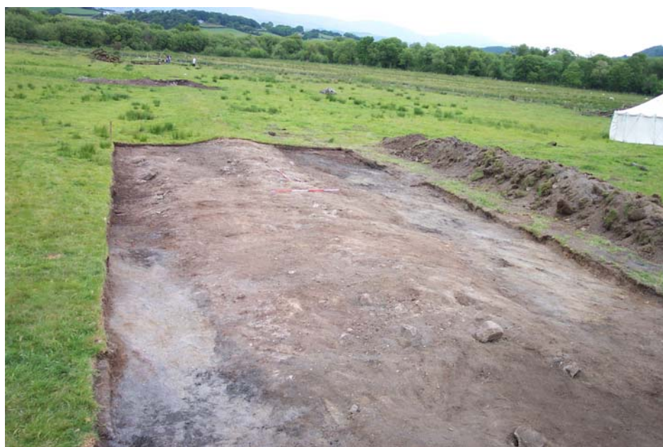
Plate 3: General view of T4 after initial cleaning showing the raised track 001 and the clay shoulder added along the west side. Some of the industrial deposits are visible along either side of the trackway.

The principal objective of Trench 4 was to define the nature of the track at the junction of the bog and the dry ground and to investigate the possibility of a terminal of some kind. Prior to excavation the visible earthwork narrowed towards its southern end and appeared to come to a rounded terminal. However, aerial photographs seem to show it continuing through the excavation area into the base of the ridge some 20m south of the site.