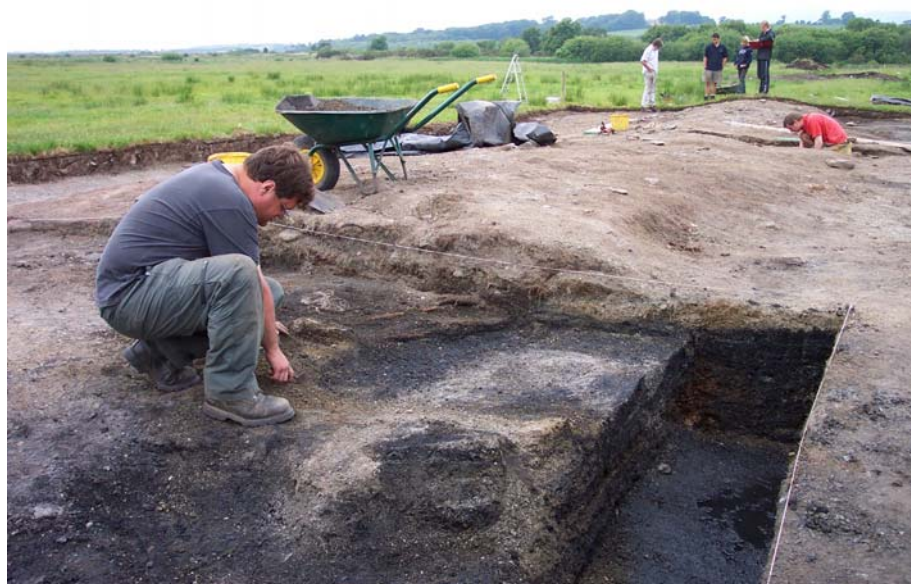
Plate 4: The grey-ash filled gullies cutting the surface of the industrial deposits. The far section shows that these features had been sealed by later industrial deposits, prior to the track being constructed.

A trial area (1m wide) was excavated through these deposits along the east edge of T4a to a depth of about 1m (Plate 3). This trial area revealed horizontal banding of charcoal rich deposits, which in most cases were difficult to distinguish from each other, and light grey ash deposits. All the deposits were gritty and most contained fragments of what appeared to be crucible or furnace lining. Cutting the upper levels of these layers were shallow and narrow linear and curvilinear features filled with a charcoal rich light grey ash (Plate 4). These gullies also contained small fragments of heat affected clay and stone, which may have been fragments of furnace lining.