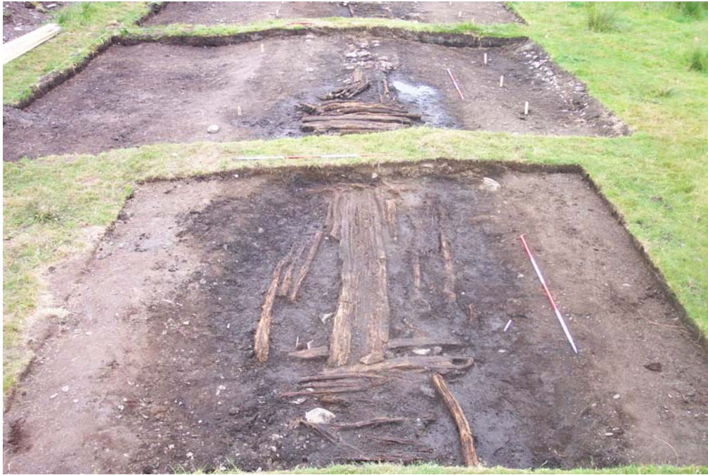
Plate 1: the substantial oak timber and other longitudinal timbers in section T5d.

The timbers were laid on patches of stones and gravel which had been laid, or dumped on the peat surface. Compression had pushed some of the stones into the top of the peat (Plate 2). However, for the most part they formed patches on the surface. It is not clear if they were the intermittent remains of what was formerly a continuous stone causeway across the bog or whether they were dumps of stones used to level wet hollows in the surface of the peat prior to the timber track being laid.