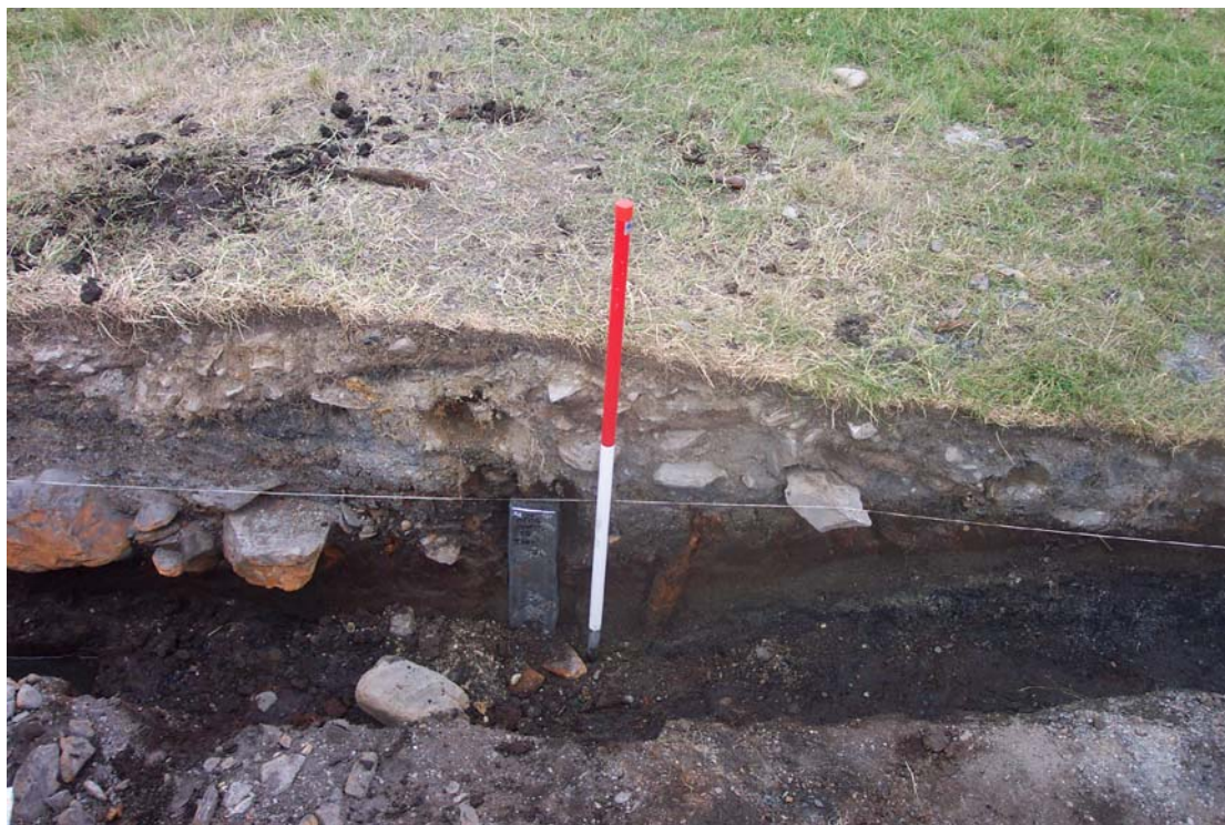
Plate 8: T4c, the pollen sample tin cuts the peat deposit that developed after the industrial activity had ceased, or declined, but before the track was constructed. A driven stake is visible to the right of the photographic scale.

pointed driven stakes were noted within the stone foundation layer. The stake rows were aligned north-south, along the track, and may have been driven into the peaty deposit, with their tops level with the top of the foundation layer. These may have been intended to stabilise the peat surface and to stop lateral movement as the foundation stones were laid.