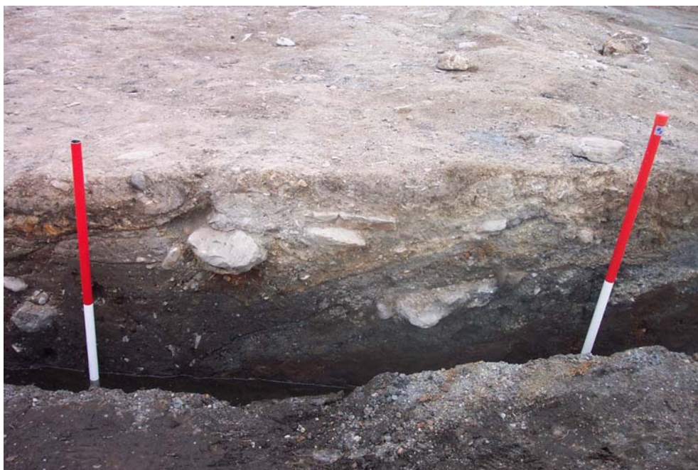
Plate 7: the gravel surface of the trackway, with the clay shoulder visible on the left hand side.

In other sections where the timber structure was recorded the flat laid timbers were laid across longitudinal side rails. There was no definitive evidence for side rails in this trench, although it is assumed they were originally present. The timbers were predominately oak and ash and these were sampled for fuller species identification and dating. One of the oak timbers was spot-dated by dendrochronology within the felling date range of between 1085 and 1121AD.