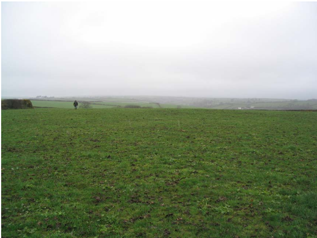
Looking northeast the round barrow is visible as a slight ground swelling.

Such sites are generally believed to be Bronze Age in date (2300 – 800 BC), covering a burial of either an inhumation or a cremation sometimes placed within a stone cist.