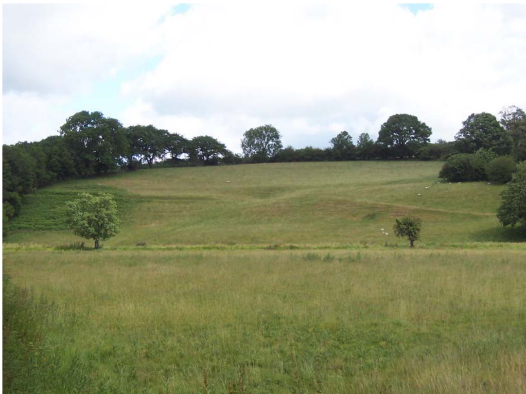
Photo 5: The Roman road RR62c survives as a cutting in the hill slope at SN76663547 (facing northeast).