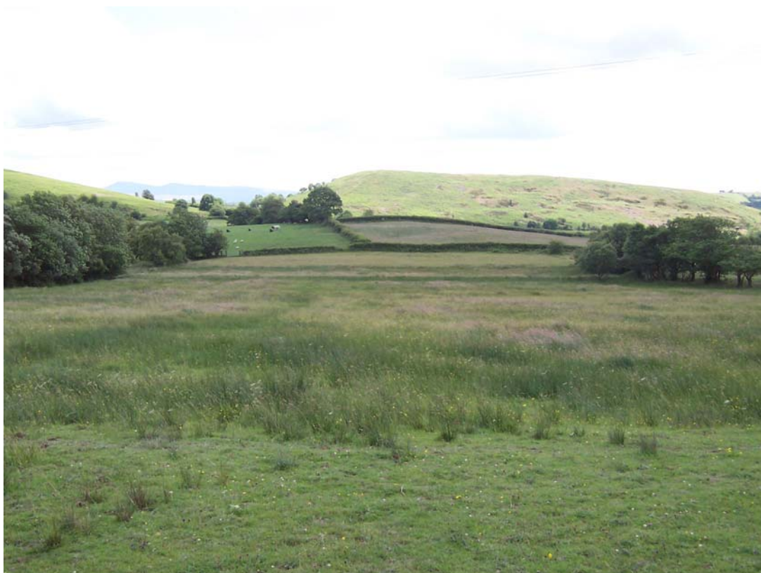
Photo 6: The Roman road RR62c at SN71673785, surviving as extant agger.