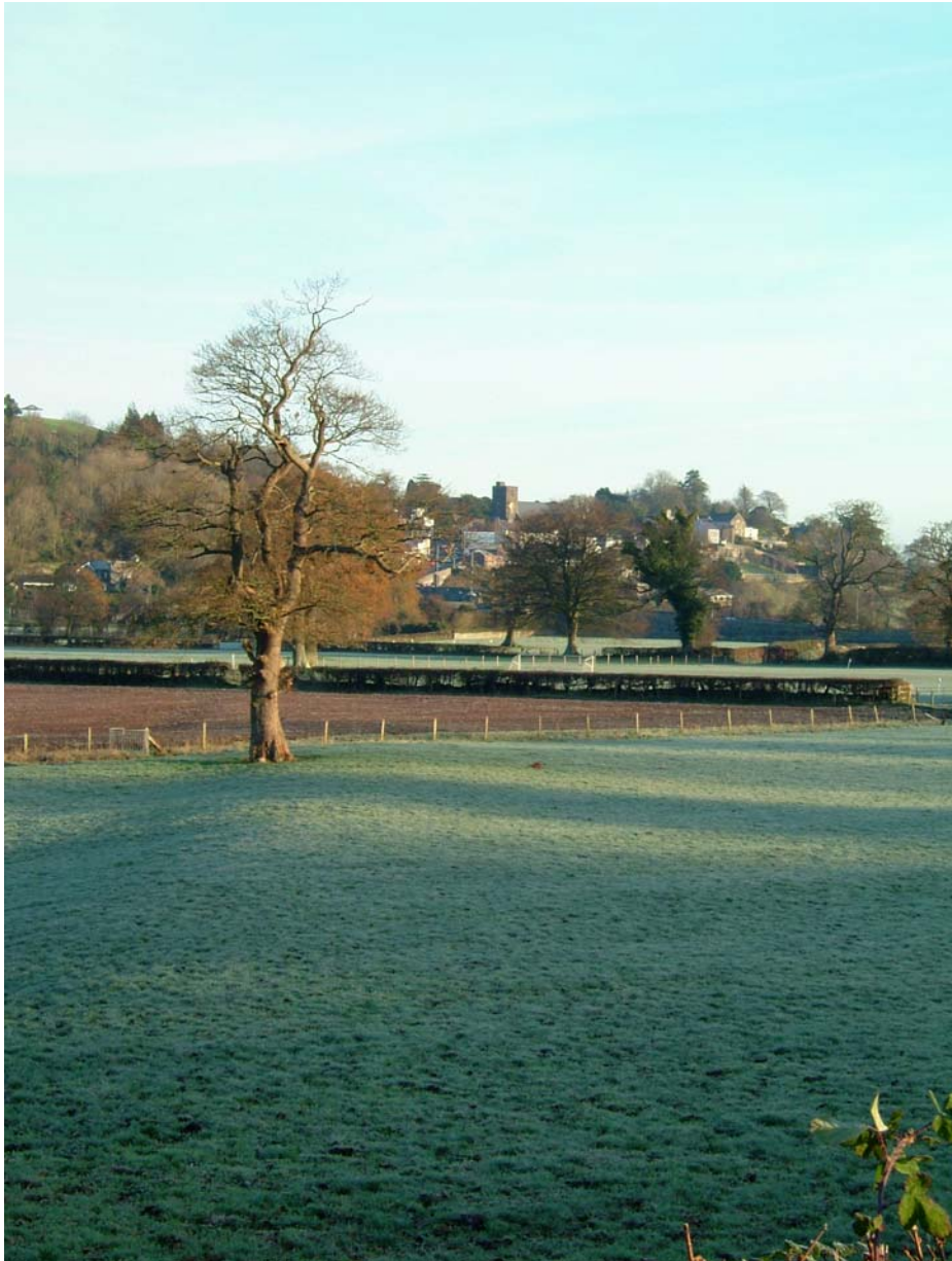
Photo 2: Possible line of Roman road running southwest of Llandeilo (the possible course is marked by the alignment of trees crossing the fields towards the bridge and Bridge St. and the low bank in the left, representing the west side of the agger).