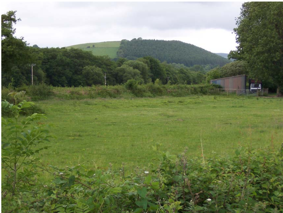
Photo 3: The line of the Roman road RR623 (PRN33982 at SN79463769). The south side of the agger can be seen running parallel in front of the hedge.

‘Certain’ road segments: PRN33981-33982; PRN34114-34115