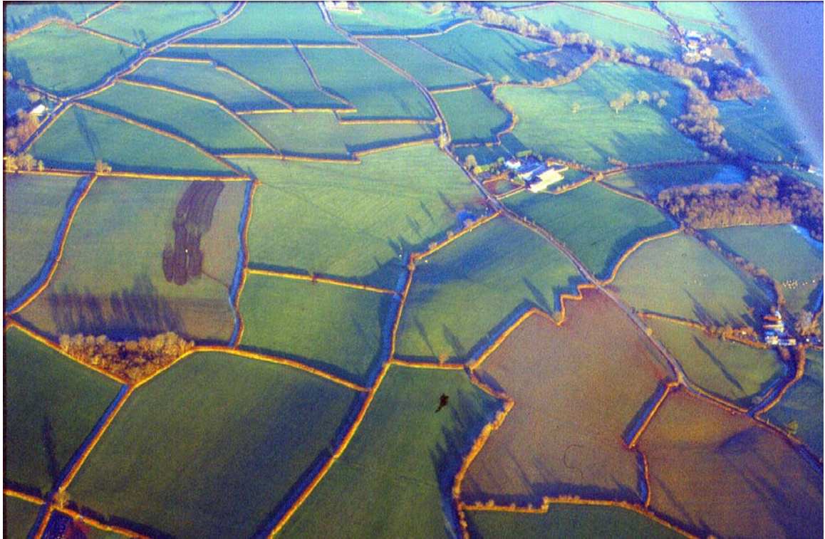
Photo 1: The Roman road south of Carmarthen (PRN7459) near Bwlch-y-gwynt (the line runs diagonally from upper left to lower right as a field boundary, cropmark and fossilised road-line).