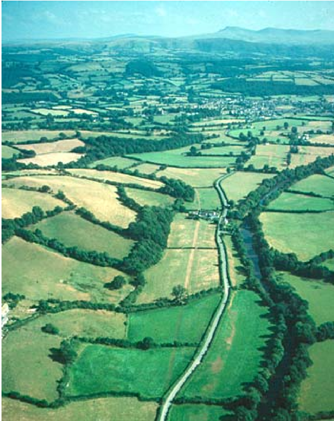
Photo 4: An aerial photograph of the road from Llandovery to Pumsaint, facing to the southeast. The segment in the center of the frame survives as an extant agger. Beyond the farm the road curves round to the left.