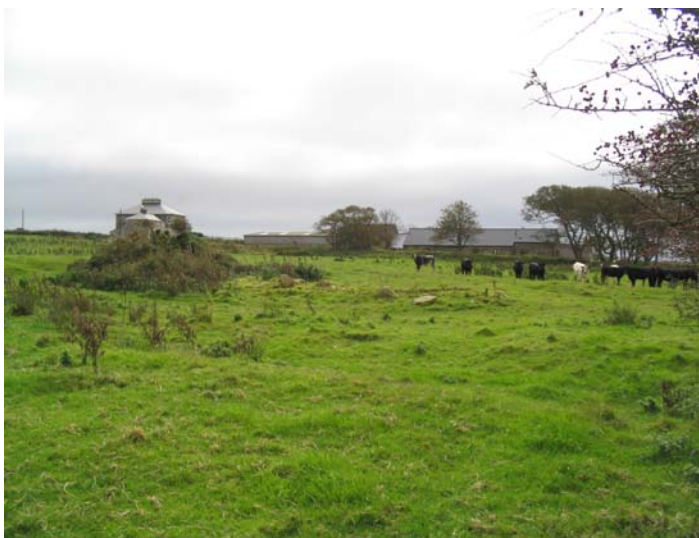
Hendre deserted rural settlement (PRN 39,840) with Hendre farm in the background