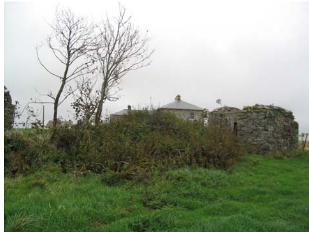
Small square stone building viewed from west

that the original roofing material was slate with a mortar coating. However, in this context there is a historical precedent for corrugated iron, and this would be the preferred option for cheaply ensuring that the buildings remain weatherproof. To the south-east of the main barn range, but clearly associated is a small square stone building with very thick walls. There is a door opening with wooden lintel on the north-west elevation. There is no remaining roof structure, but the tops of the walls give the impression that the building may have been higher previously. The building appears on the more detailed maps of the later nineteenth century, although its' function is unknown.