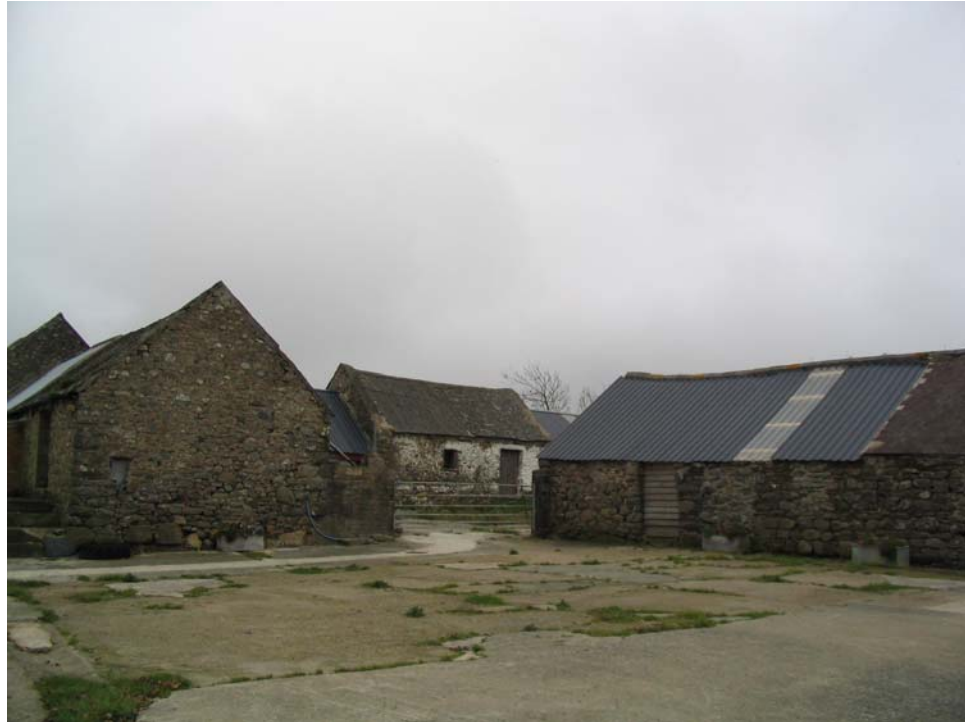
Part of the range of outbuildings at Hendre viewed from the north-west

the current range. It is likely however, that there are below ground remains of earlier buildings in the vicinity of the farmstead. The western end of the farmstead occupies an area which may represent an earlier settlement site. Not only does the name 'Hendre' point to this possibility, but there is a field name which suggests that Hendre itself and the deserted settlement to the north were once occupied contemporarily, forming a small nucleated settlement. The meaning of 'Llain rhwng y ddwy dre' (the name given in the tithe apportionment to field north of the outbuildings) is literally 'blade between the two settlements/ townships'. Historic map evidence demonstrates that the settlement to the north had been abandoned by the mid nineteenth century, while Hendre itself has seen continued occupation.