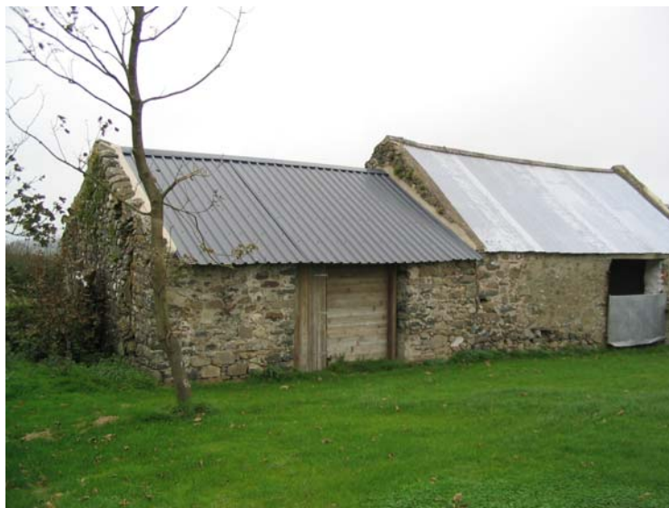
The rear of the row seen above, showing deterioration of the southern gable-end

The extreme southern gable-end is deteriorating rapidly: it is bulging outwards, with lime mortar crumbling from the joints. It appears that the western elevation of this building has suffered from collapse, as it has been replaced by concrete breeze-blocks.