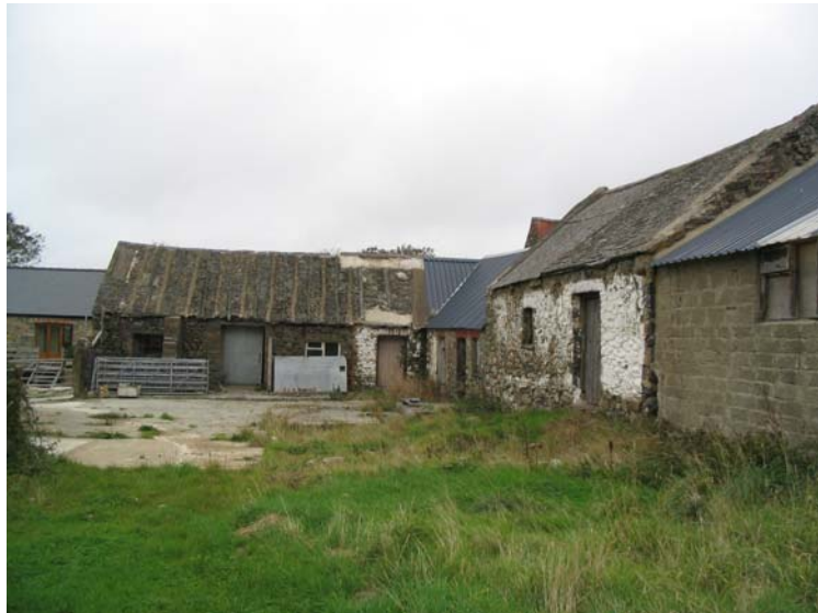
The three buildings forming the east side of the yard, showing lime wash on the central building, and east-west barn range in the background, with 'ribbed' pointing on the roof slates

of buildings, meeting at a right angle. The south elevation had become unsound in the past and is now supported by some make-shift buttresses. Attached to the east end of the row described above is the only two-storey outbuilding in the range. It is constructed of rubble stone, with access to the second storey gained via an external set of stone steps on the eastern gable-end. The front elevation faces north, and comprises a window opening (now bricked up) and door to the ground floor, and a window opening (with louvred panelling) and ventilation slit to the first storey. This probably represents a stable. Three buildings form the east side of the yard. These are all rubble built, with lime mortar between the joints and lime wash in evidence in some locations. There are variations in roof height: the central building in the row has a higher roof line, and consequently the roofs on the two buildings either side are butted up to this building. The two southerly buildings in the row have distinctive upstanding rubble-stone copings at the gable ends.