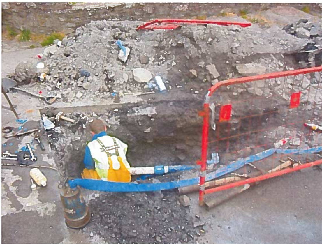
Photo 201. Trench on west side of ford. View N