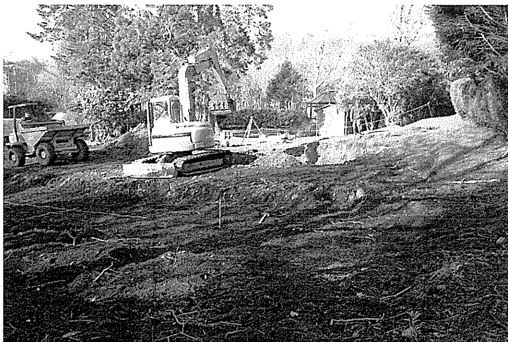
Plate 1: General view of the site showing the raised lawn area during groundworks.