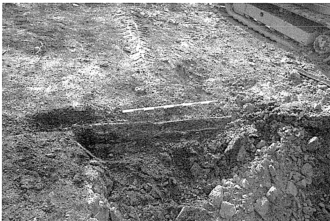
Plate 2: One of the two lengths of angle iron during excavation.