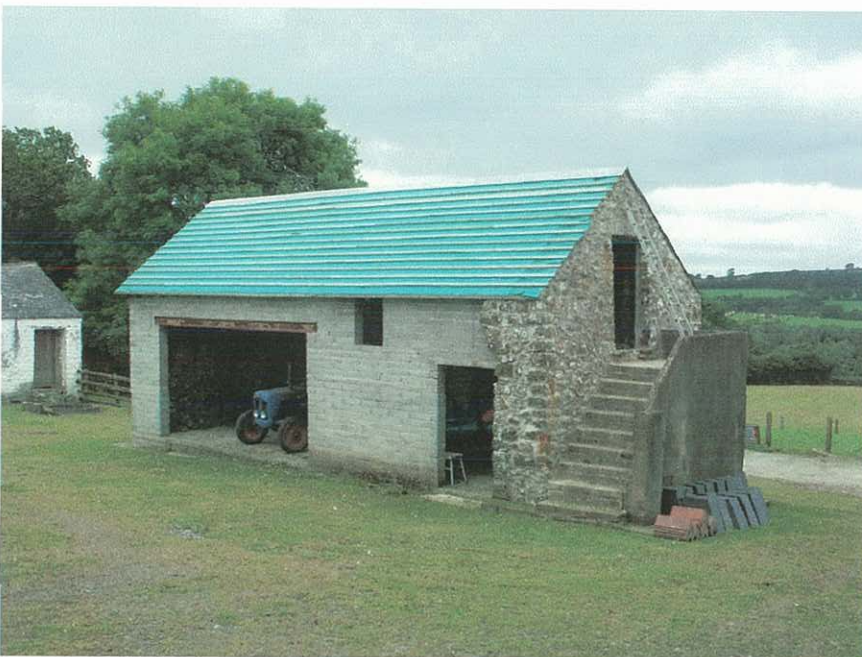
Fig.6: Lofted cowhouse viewed from south-east showing external stairs