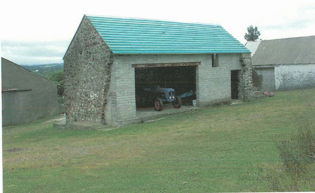
Fig.4: Front elevation of lofted cowhouse viewed from south-west

Unlike the other buildings in the farmstead complex at Cilrath Fach, this building is not shown on the 1": 1 mile OS map of 1831 and may well post-date the survey undertaken for that map (which was carried out a decade or so before 1831).