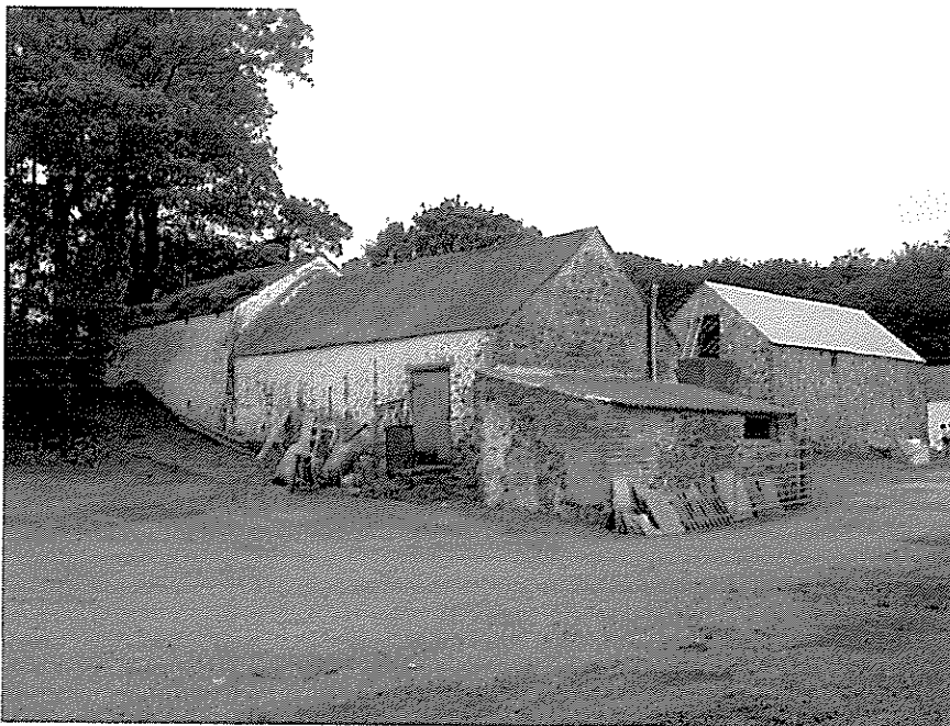
Fig.14: View of the rear elevation the barn and stable at Cilrath Fach. Note the calf house attached to gable end wall of the barn.