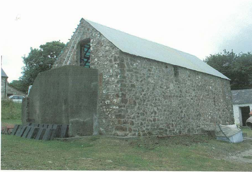
Fig.5: Lofted cowhouse viewed from north-east showing rear elevation