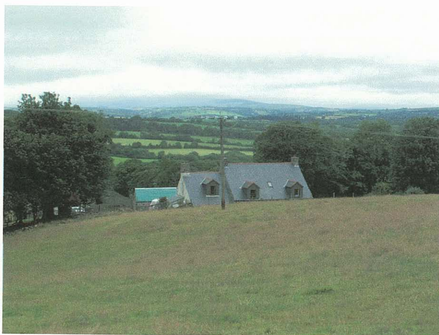
Fig. 1: Cilrath Fach farmhouse from rear with the Preseli Hills to the north.

A number of raths are recorded locally however, such as Faenor Gaer 1.5km to the west, and there are also a group of Bronze Age tumuli 500m south of the farmstead. Both indicate human activity in the immediate area during prehistoric times. Trefangor and Henllan, Llanddewi Velfry, 2km to the west suggest early Christian activity also. There can be no doubt that the landscape here has been farmed and managed continuously for at least the past 5,000 years.