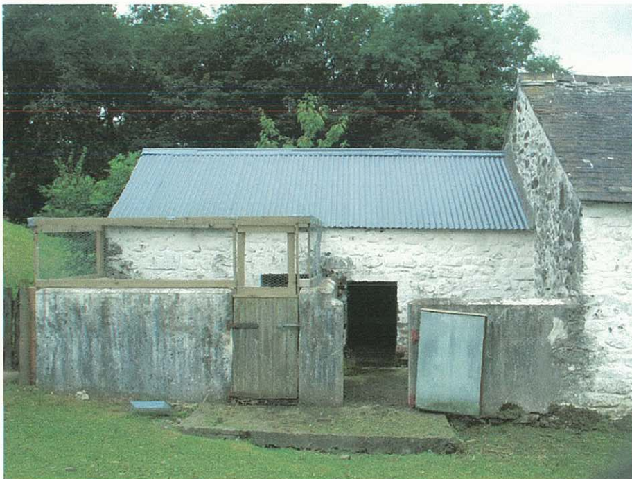
Fig.8: Pigsty viewed from east showing rear elevation