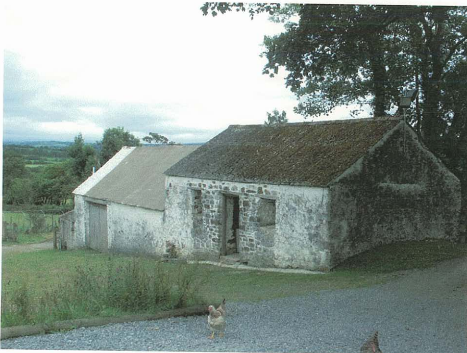
Fig.7: Stable and barn viewed from north-east showing front elevation. The stable is the upper portion of this building range.