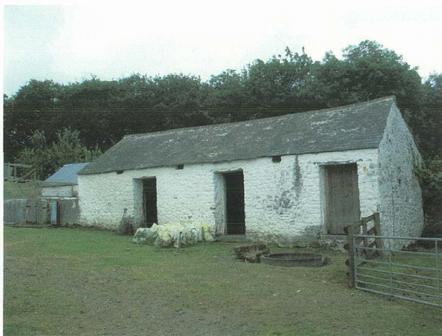
Fig.3: Front elevation of cowhouse viewed from the north-east.

The 2002 Tir Gofal visit ascertained that some restoration and repair work has occurred to the pigsty (PRN45434) and that the cartshed remains in a ruined condition. With regard to the condition of the cowhouse itself, it is externally in very good condition and well maintained. It seems that the feed passage referred to as being within the building has apparently been lost, possibly due to the removal of stalls and feeding troughs - although as these are not mentioned in the listing schedule it is impossible to determine if this is the case (see also PRN45446).