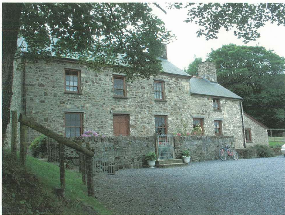
Fig.2: Cilrath Fach Farmhouse front elevation