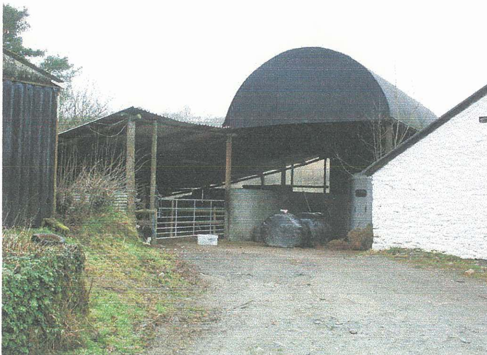
Plate 6 – the dutch barn (PRN 43948) to the south of the farmyard