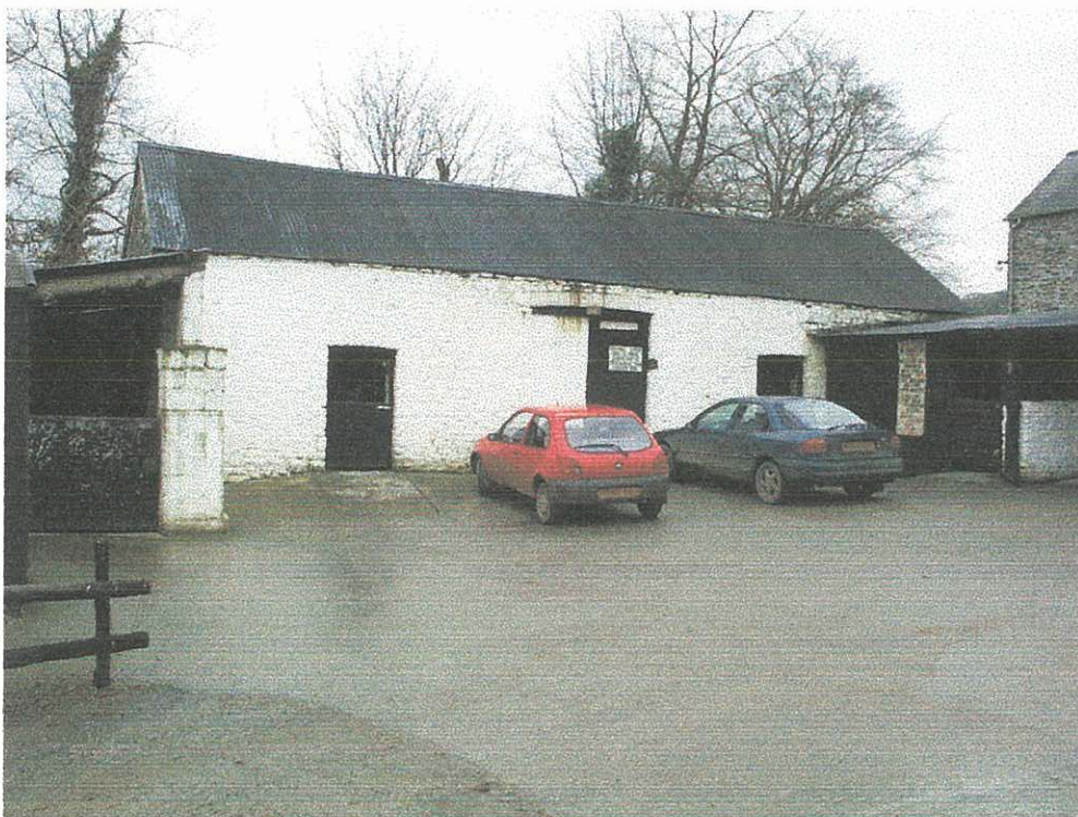
Plate 4 – the south west facing elevation of the cow shed (PRN 43946)