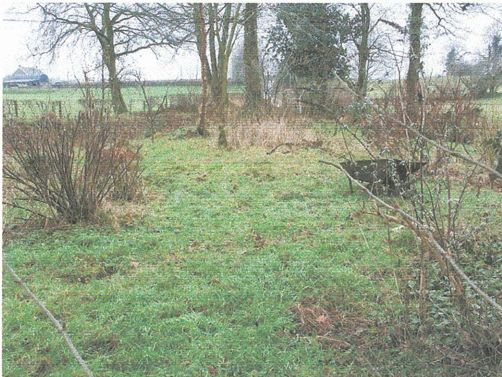
Plate 2 – the line of the Roman road Sarn Helen (PRN 3420) looking towards Ffarmers