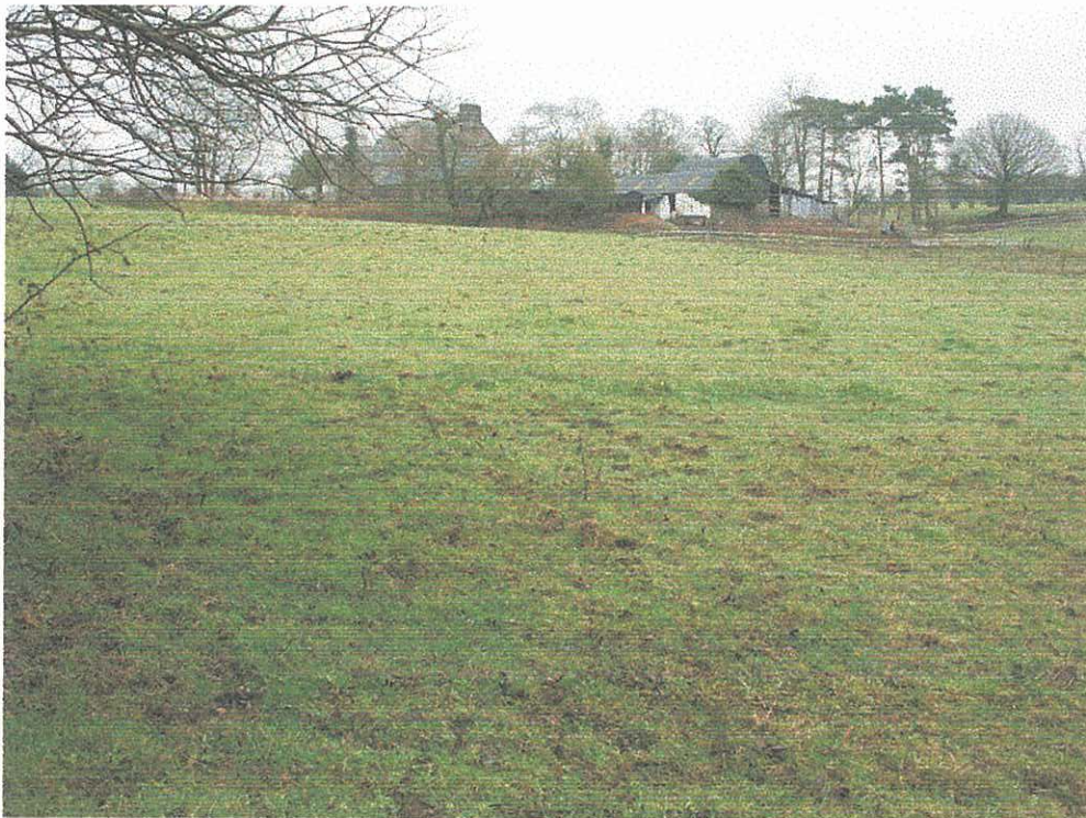
Plate 3 – the route of the Roman road Sarn Helen (PRN 3420) crosses this field and through the farmstead of Cae Iago