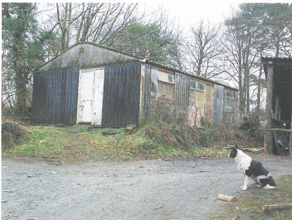
Plate 7 – the Arcon asbestos prefabricated building (PRN 43949)