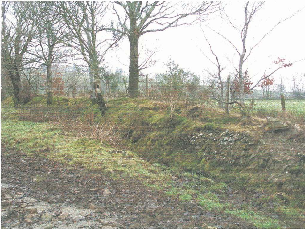
Plate 1 – a stone constructed bank with grown out hedge, to the east of the holding.