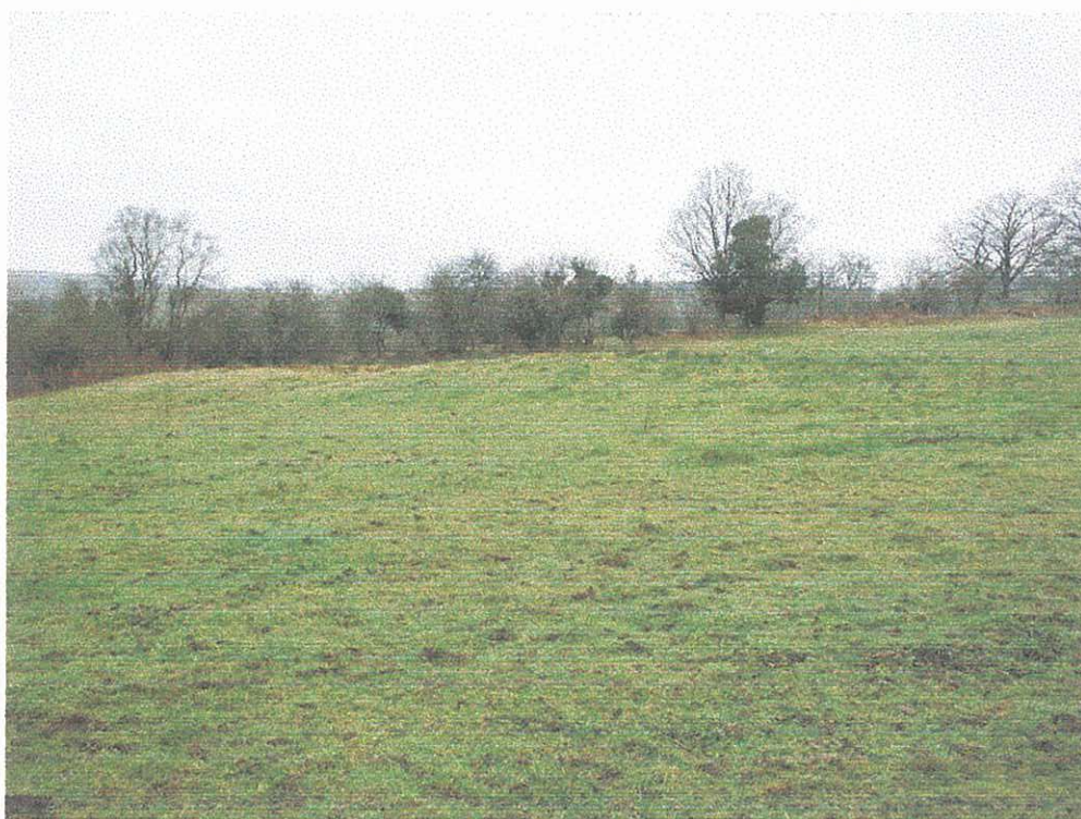
Plate 8 – the earthwork feature (PRN 43951) to the east of the farm holding