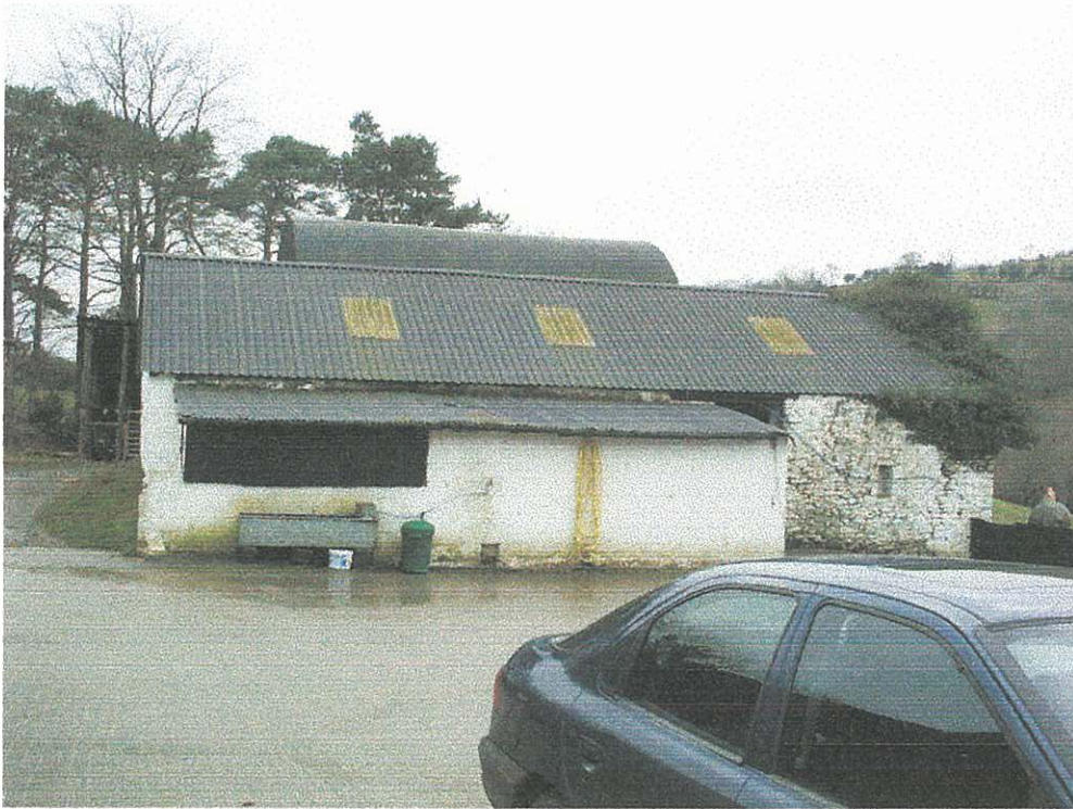
Plate 5 – the north east facing elevation of the cow shed (PRN 43947)