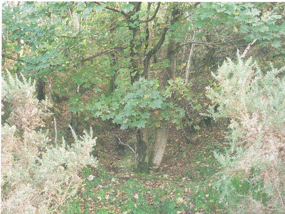
Plate 3 – the remains of mine workings to the south east of the farm (PRN 43651)