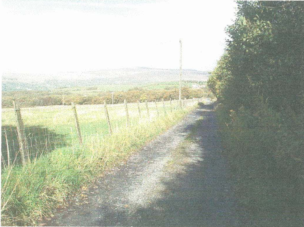
Plate 1 – the old Cawdor Colliery tramway (PRN 30742)