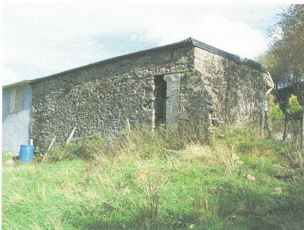
Plate 4 – the farm building to the west of the farmhouse (PRN 43652)