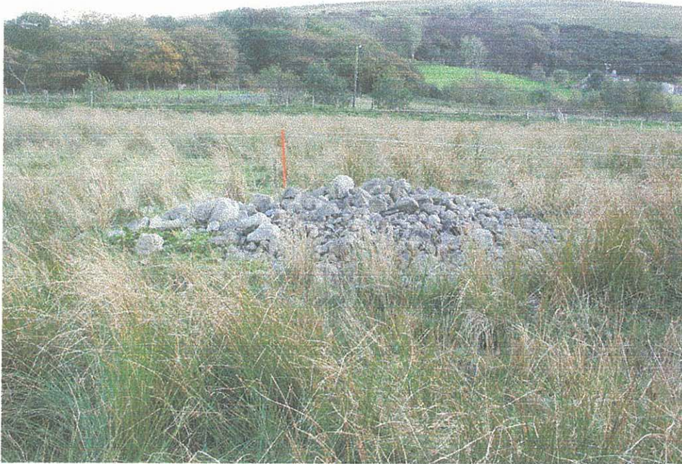
Plate 2 – the site of a possible well or clearance cairn (PRN 43650)