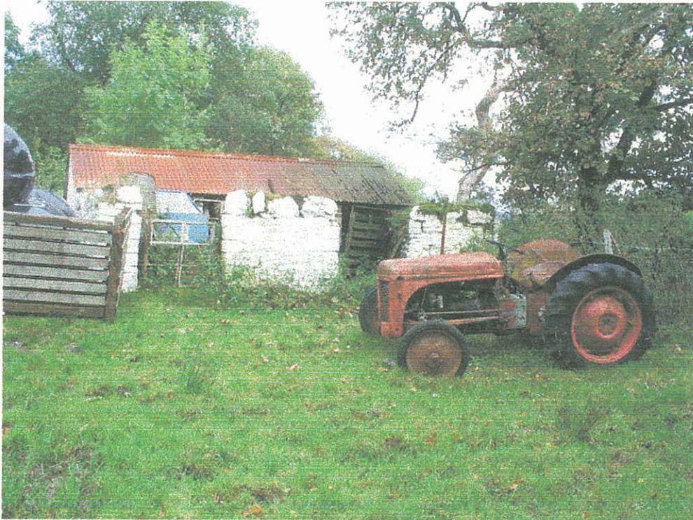
Plate 3 – pig sty to south east of farm yard (PRN 43640)