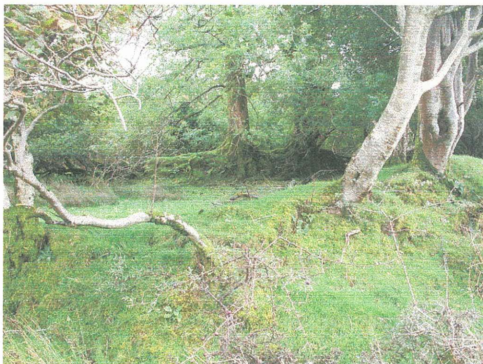
Plate 6 – enclosure at Trawsgoed (PRN 43644)