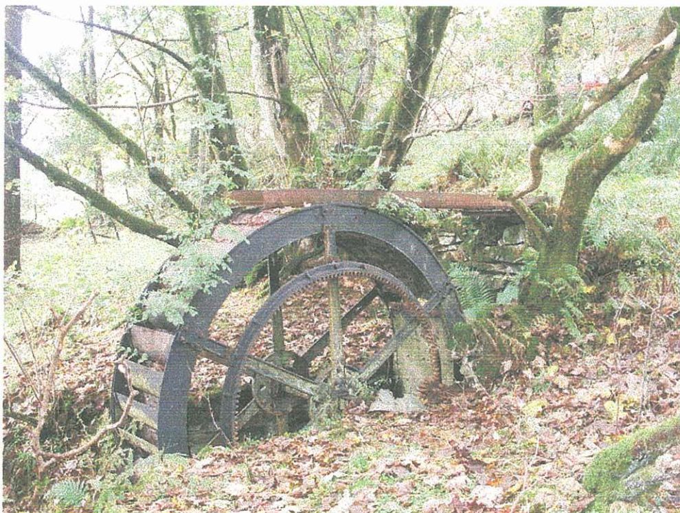
Plate 5 – water wheel and stone lined wheel pit, facing west (PRN 43643)