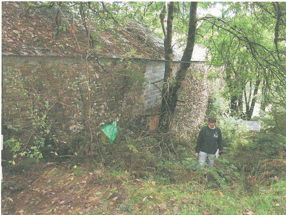
Plate 2 – south west elevation of barn with adjoining wheel pit (PRN 43639)