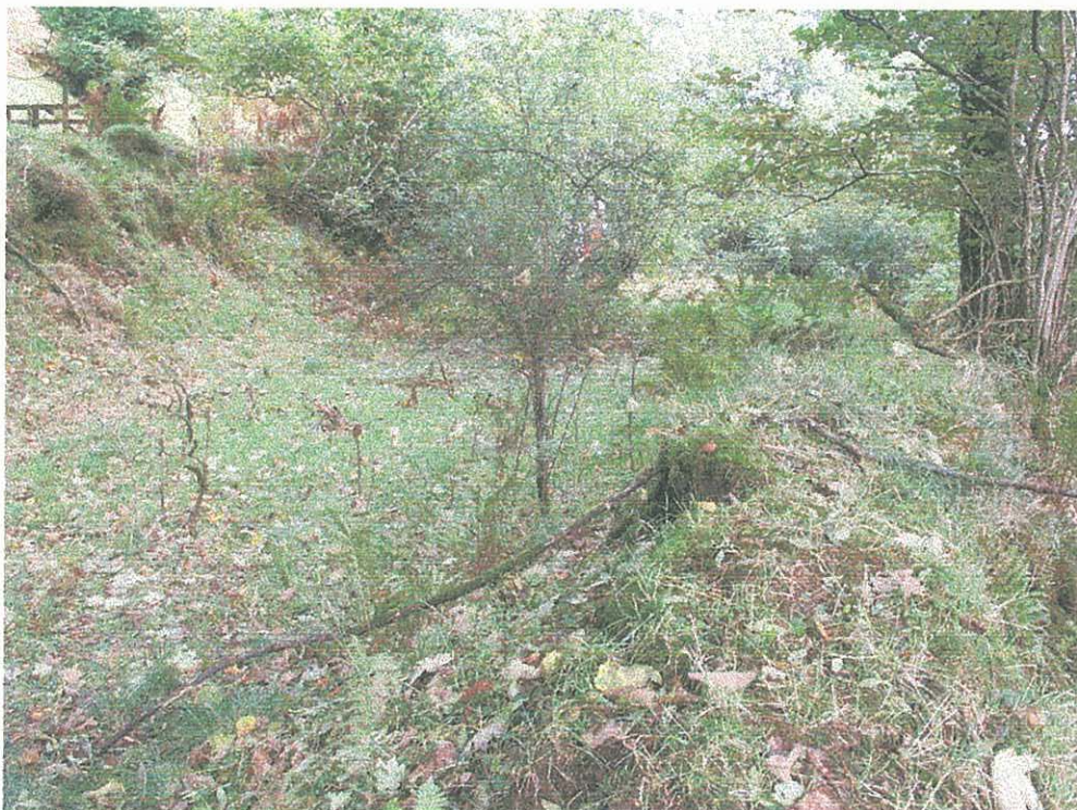
Plate 4 – north east end of mill pond (PRN 43642)