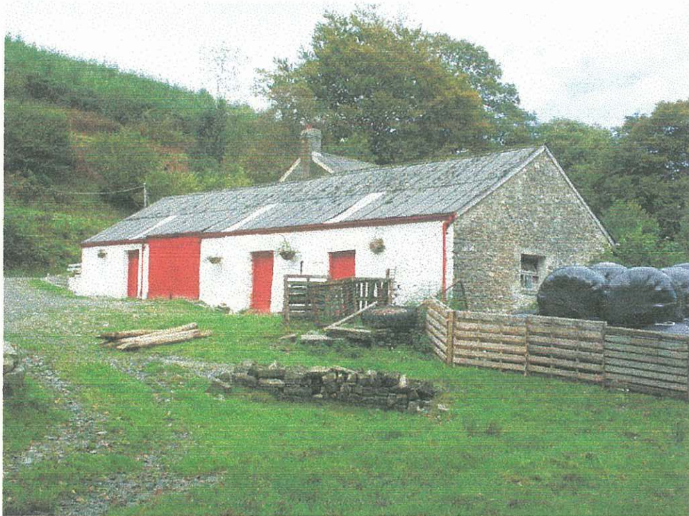
Plate 1 – cow house and cart shed to the north east of the farmyard (PRN 43638)