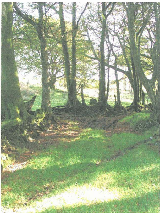
Plate 3 - the driveway to Victoria Park Farm (PRN41407).