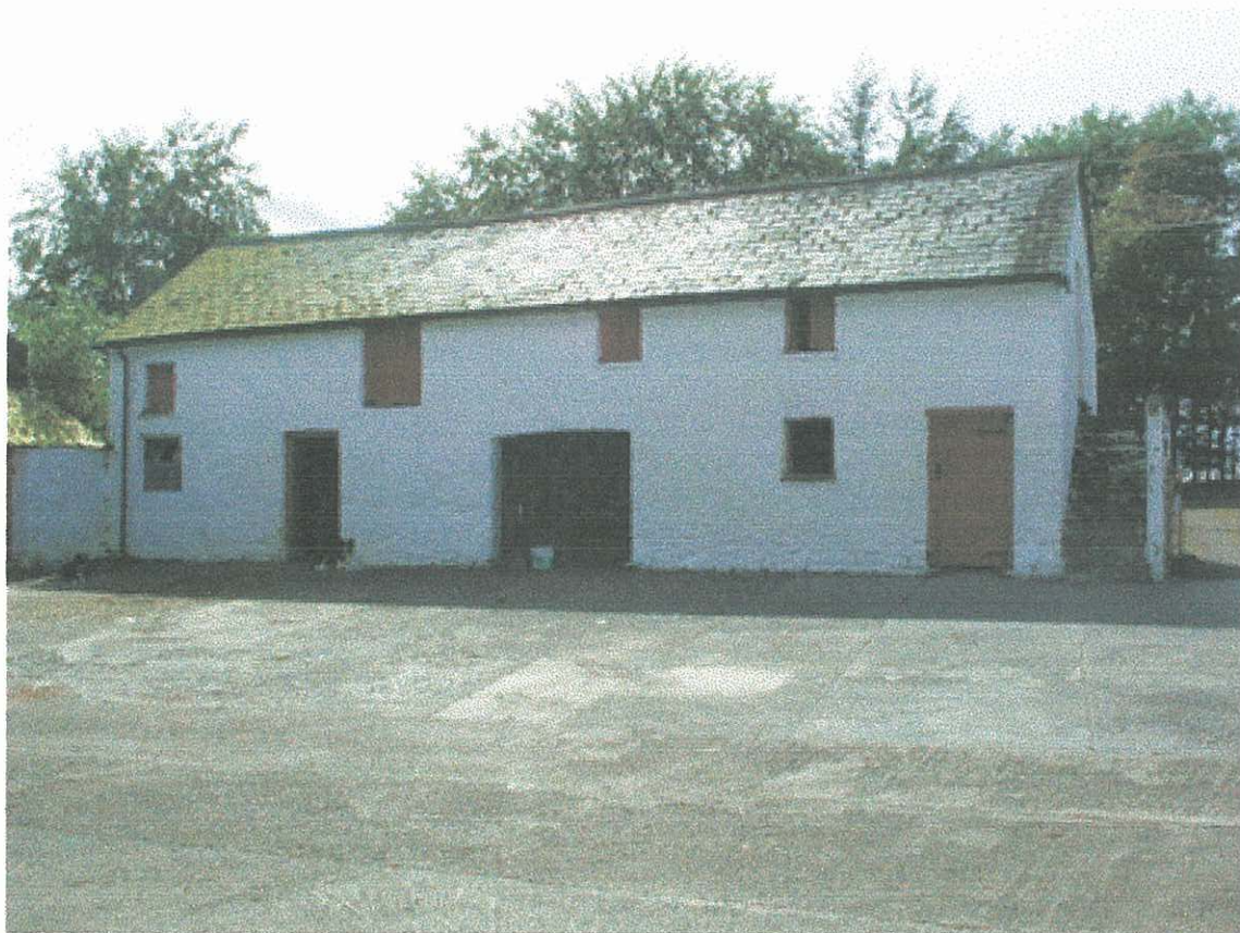
Plate 5 - late nineteenth century farm building at Pantyfen Farm (PRN 42071).