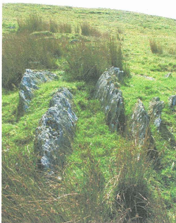
Plate 4 - possible chambered tomb (PRN 41417).