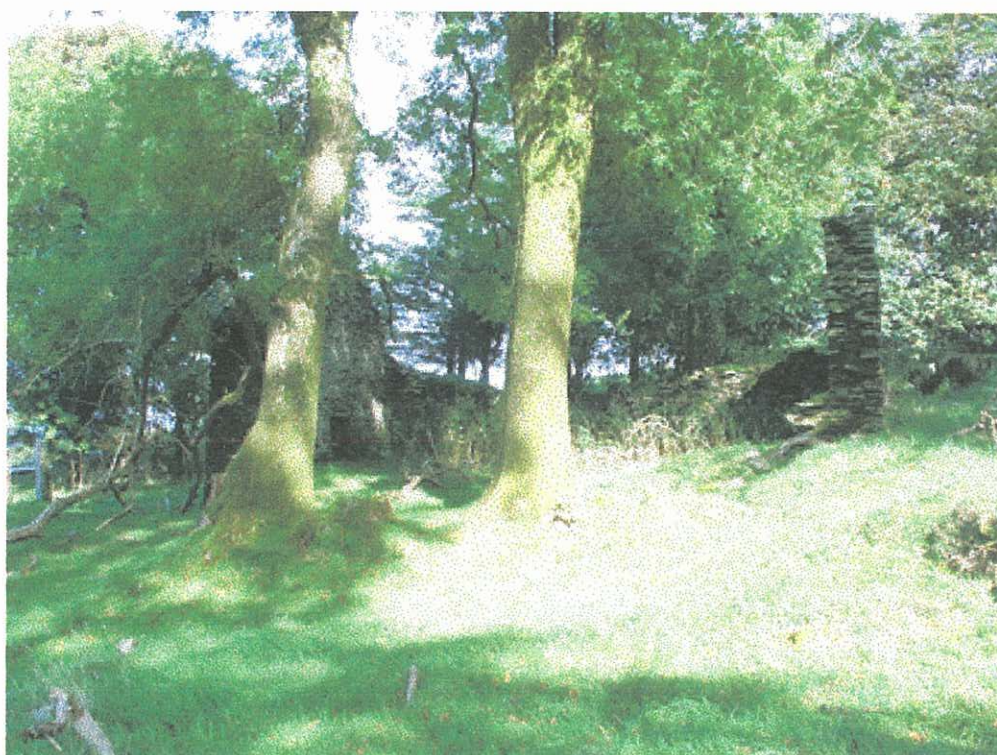
Plate 2 - the ruined cottage of Blaenbydernyn Lodge (PRN 7008).