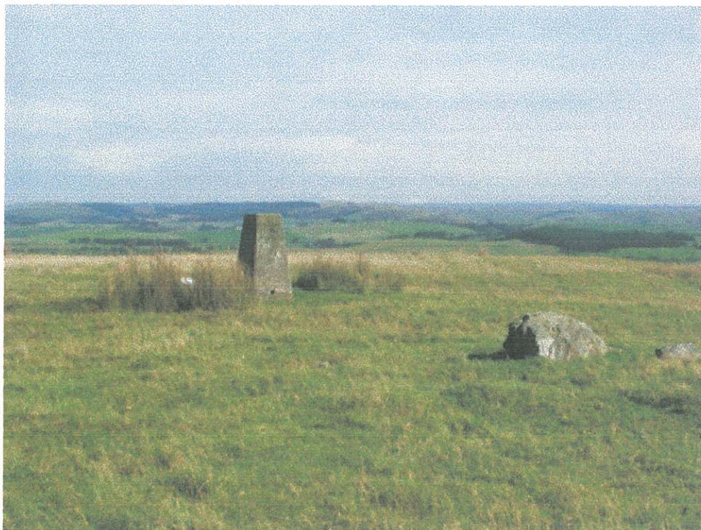
Plate 1 - Bronze Age barrow on Mynydd Pencarreg (PRN 1192).