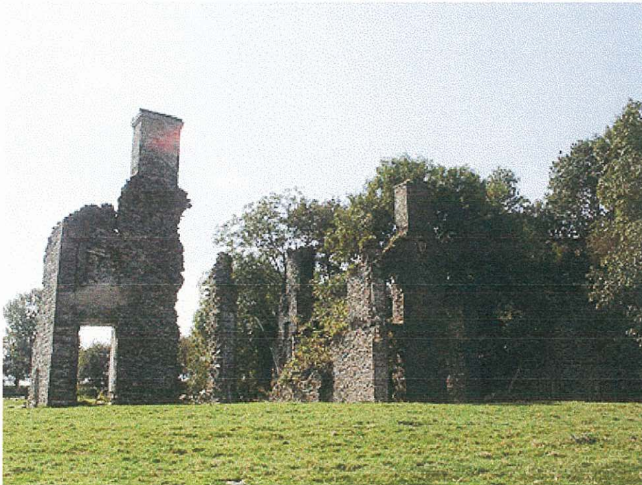
Plate 1 - Llwynywormwood mansion house from the north (PRN 19391).