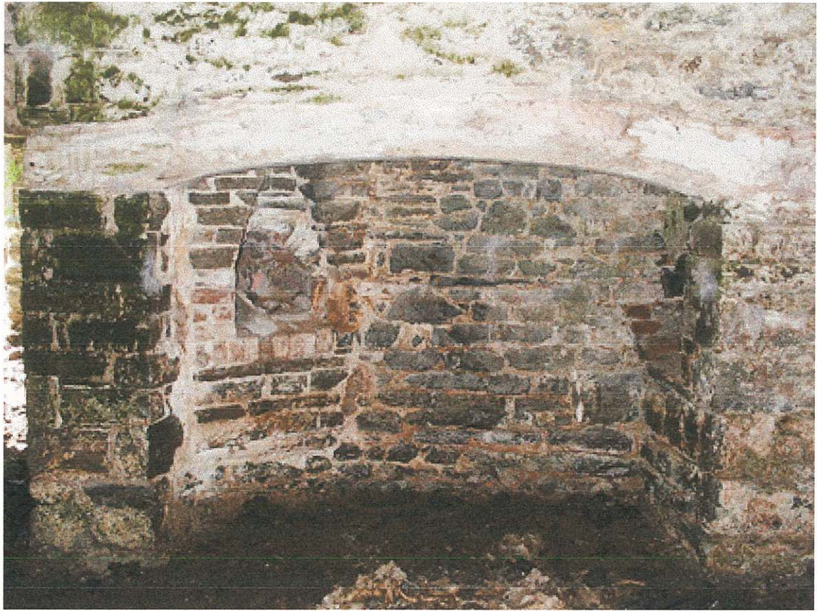
Plate 3 - the original detached kitchen for the mansion house (PRN 19391).