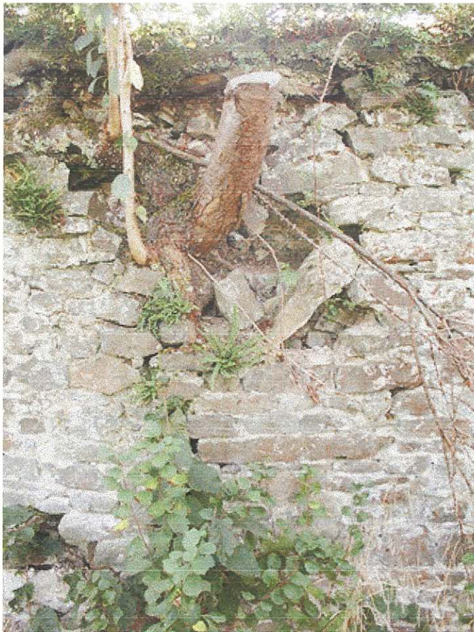
Plate 5 - damage to the walled garden (PRN 41378).