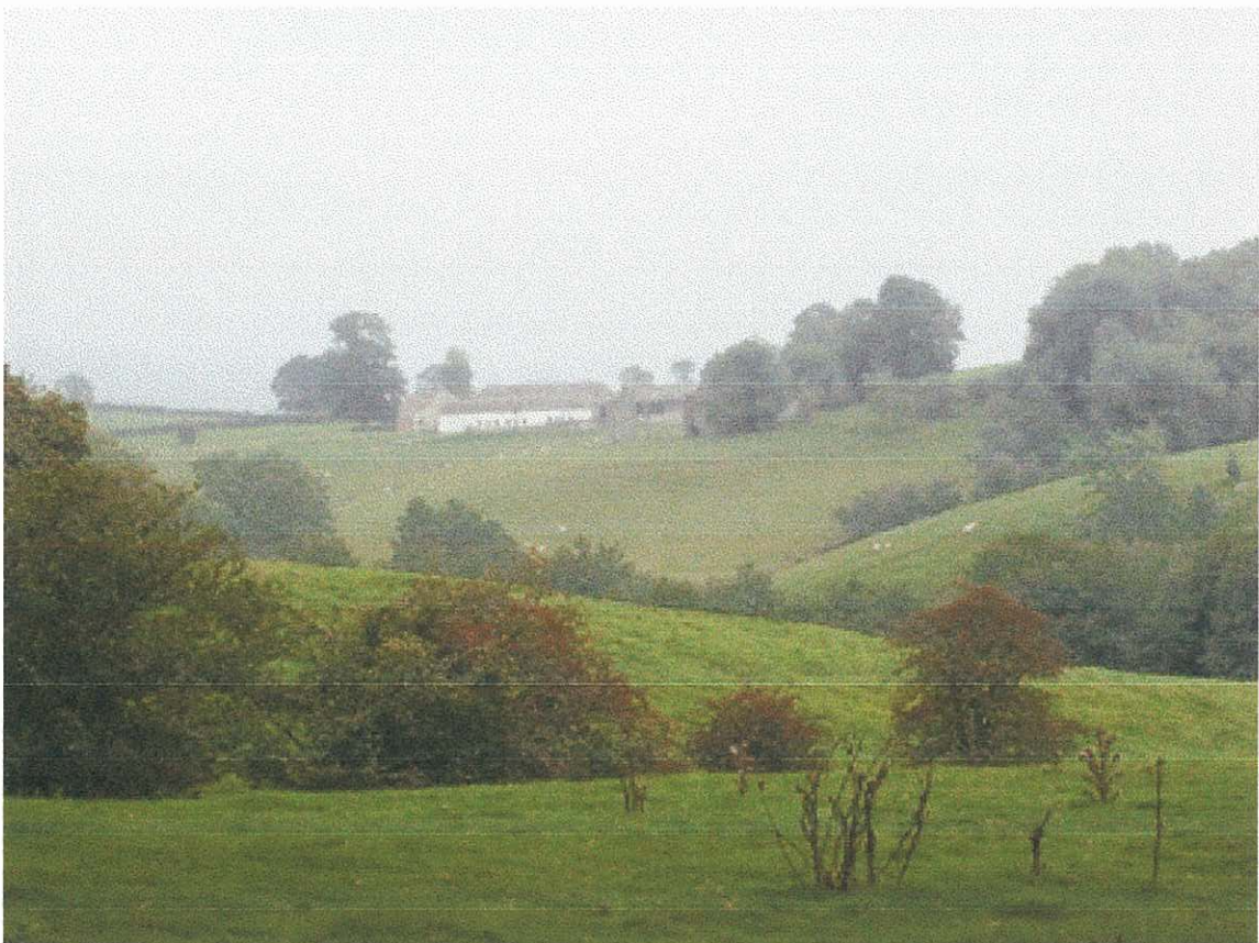
Plate 8 - The farm from the viewing platform (PRN 41388).