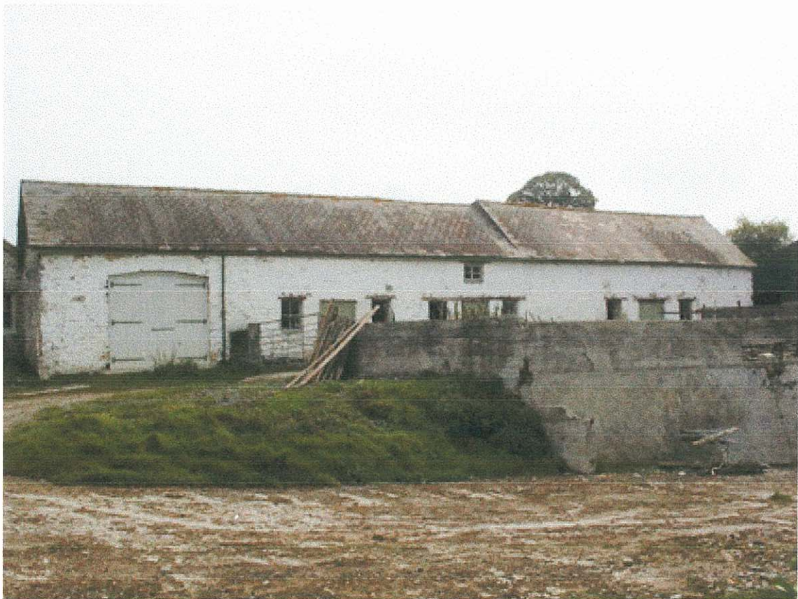
Plate 7 - original farm building (PRN 41387).