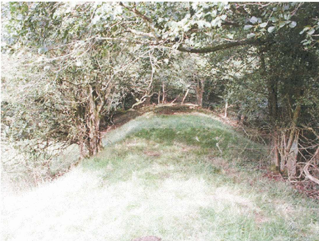
Plate 6 - raised approach to the alpine bridge (PRN 41380).