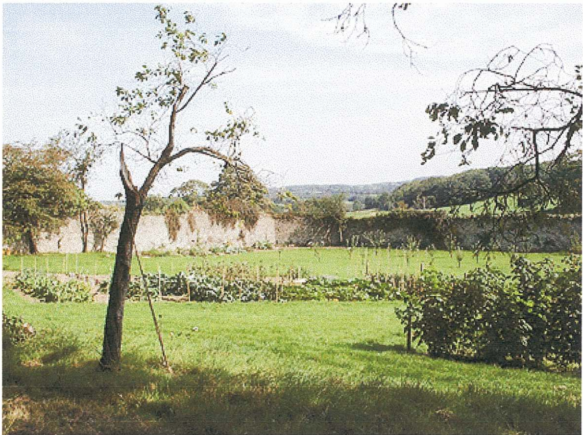
Plate 4 - the walled garden (PRN 41378).