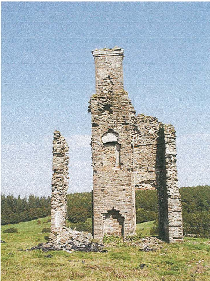
Plate 2 - Llwynywormwood mansion house, gable end (PRN 19391).