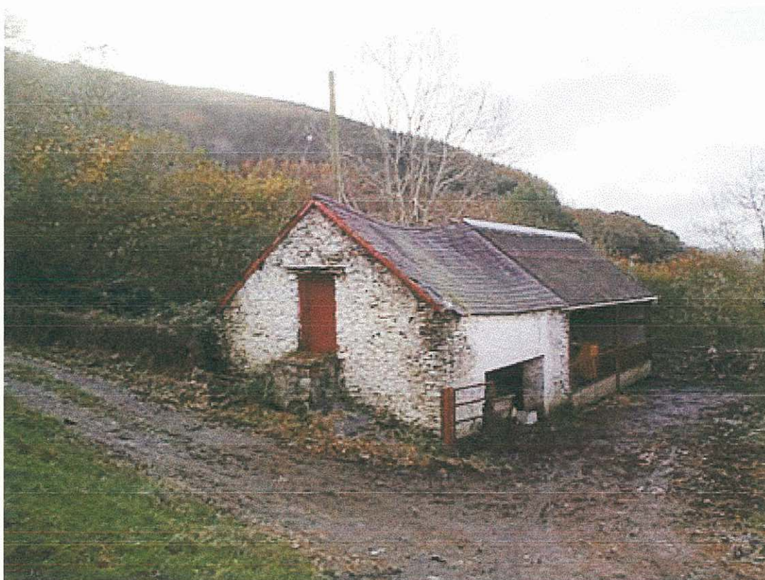
Plate 3 – late nineteenth cart shed building (PRN 42075).