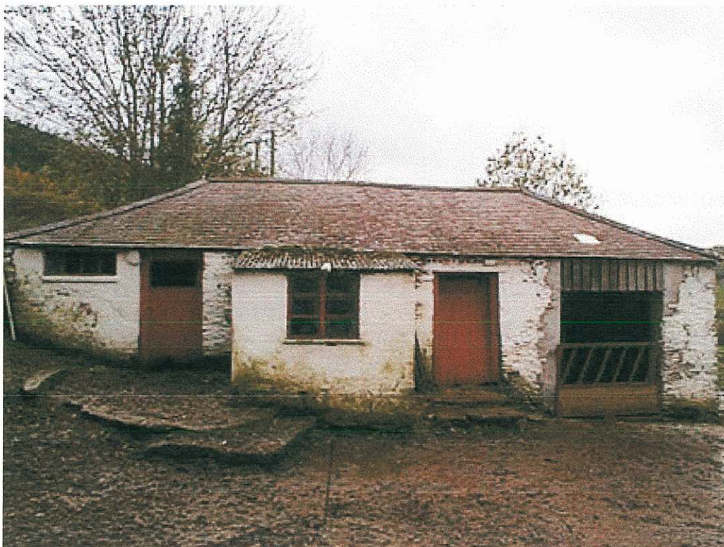
Plate 2 - late nineteenth century farm building (PRN 42074).