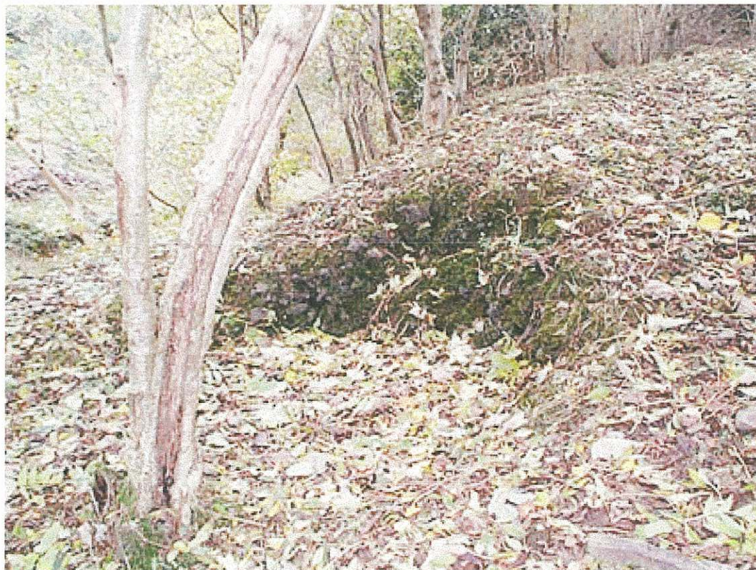
Plate 7 - magazine at Aberffrwd mine (PRN 42080).