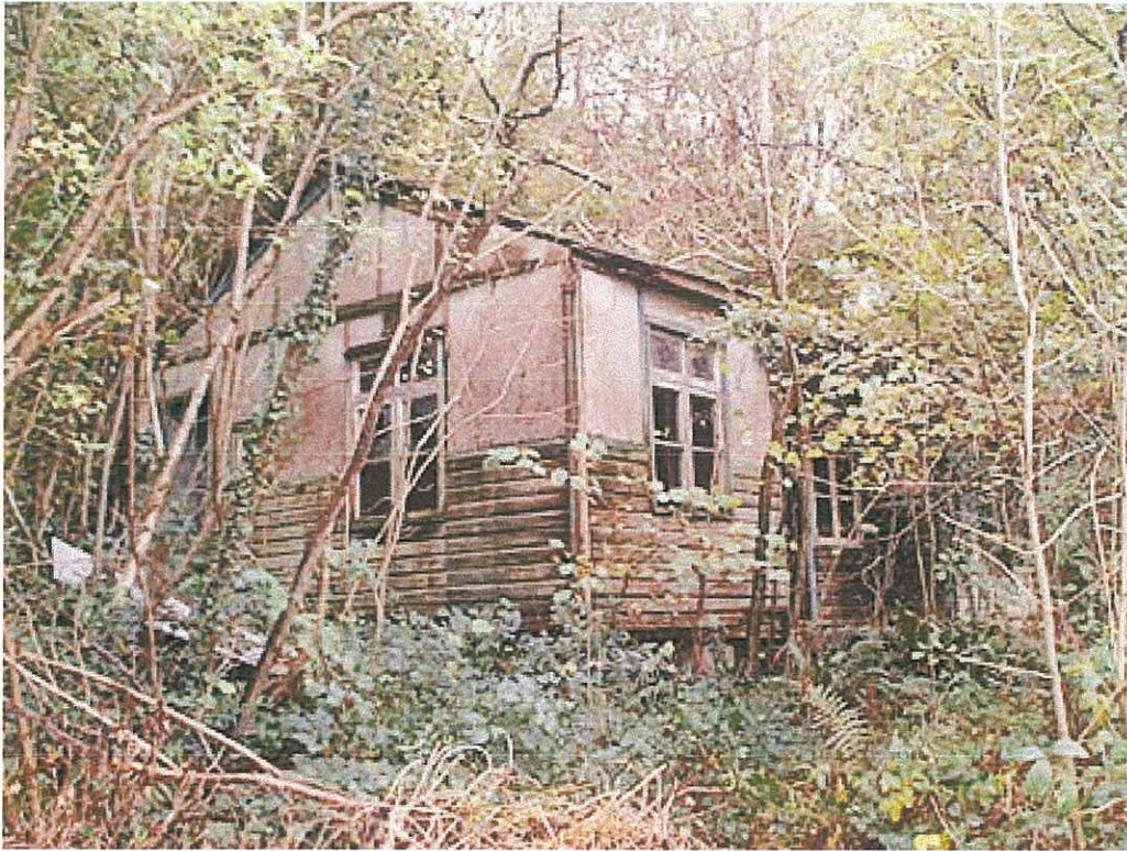
Plate 1 - the old station house at Aberffrwd (PRN 19155).