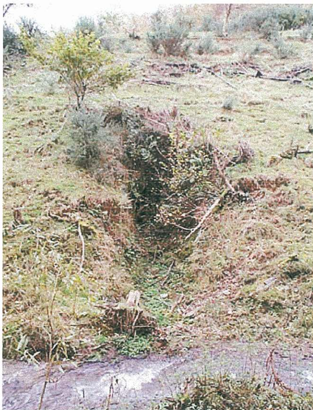
Plate 5 - level for Aberffrwd mine workings (PRN 42077).