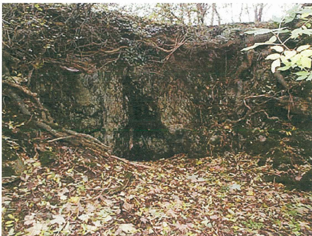
Plate 6 - mine shaft at Aberffrwd mine (PRN 42078).