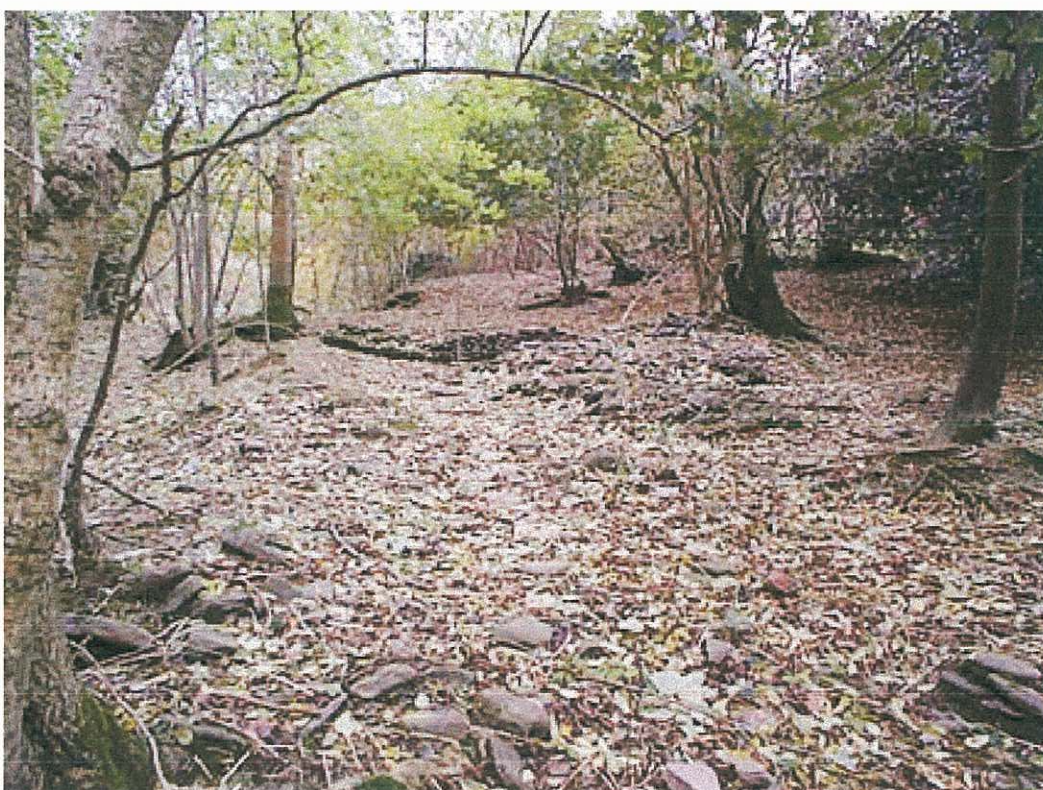
Plate 4 - mine building at Aberffrw mine (PRN 42076).