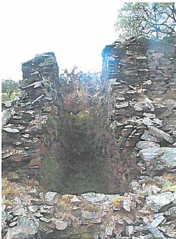
Plate 2 - PRN 41899, Ty Newedd Mine, Wheelpit.