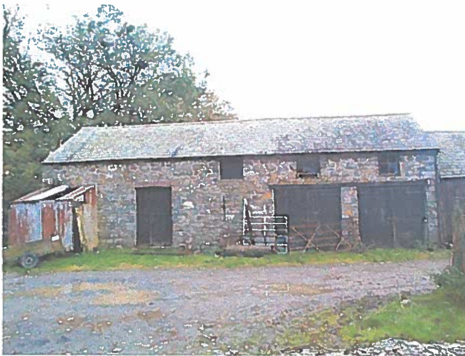
Plate 7 - PRN 41912, Moelgolomen Farm, Barn.