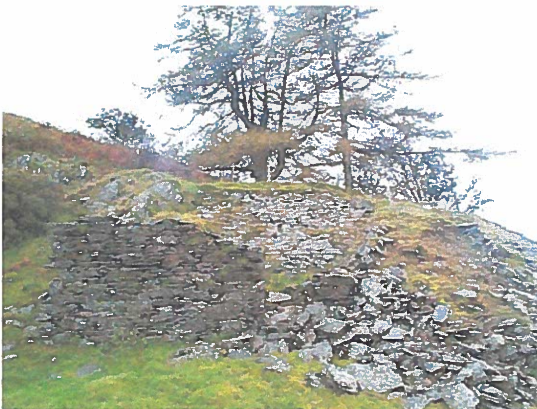
Plate 4 - PRN 41901, Ty Newedd Mine, Ore slide.