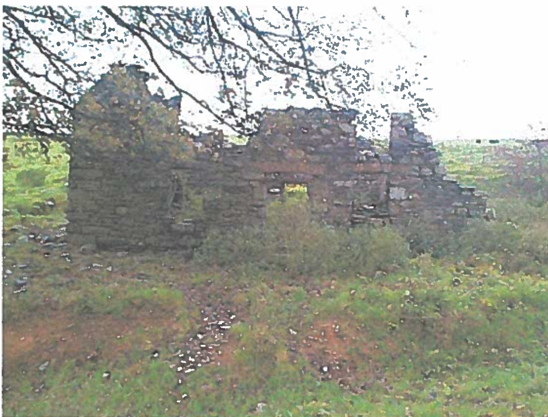
Plate 6 - PRN 41908, Newydd Pant Glas Farm.