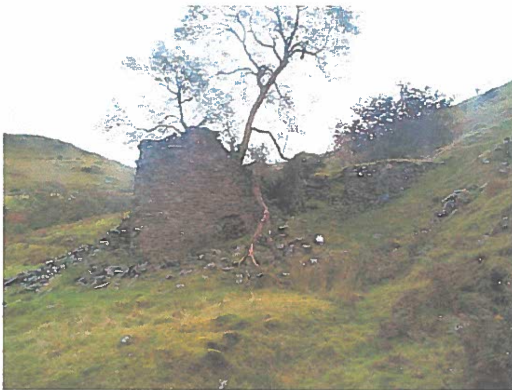
Plate 3 - PRN 41900, Ty Newedd Mine, Crusher House.