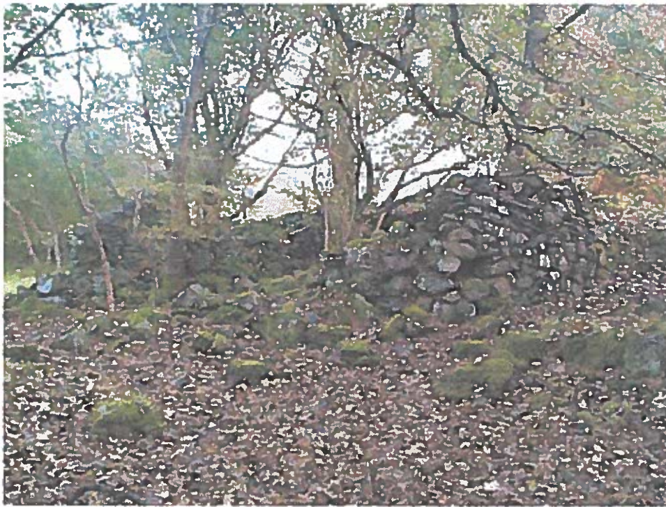
Plate 1 - PRN 41898, Llwyn Bedw Farm.