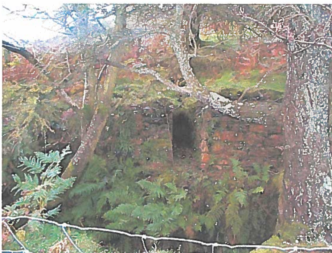
Plate 5 - PRN 41902, Ty Newedd Mine, Mine shaft.