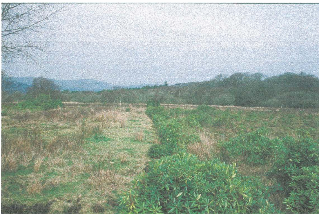
Plate 1: PRN 39394 - area of old peat cutting.