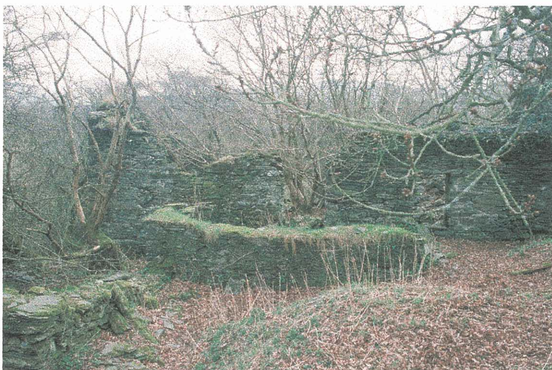
Plate 2: PRN 39390 - the overgrown remains of Ynys Fach farmhouse.