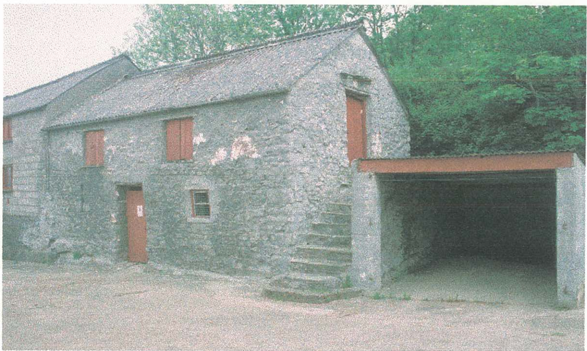
Plate 2: PRN 40646 - Surviving cowhouse with loft.