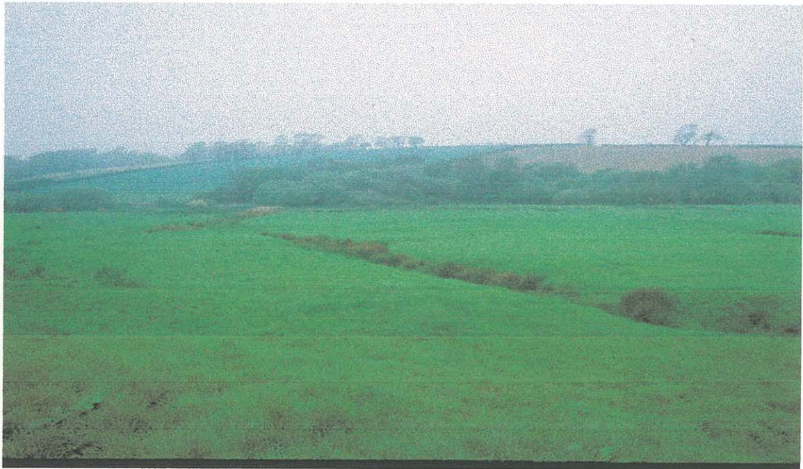
Plate 1: PRN 10389 - view north across the medieval moated enclosure