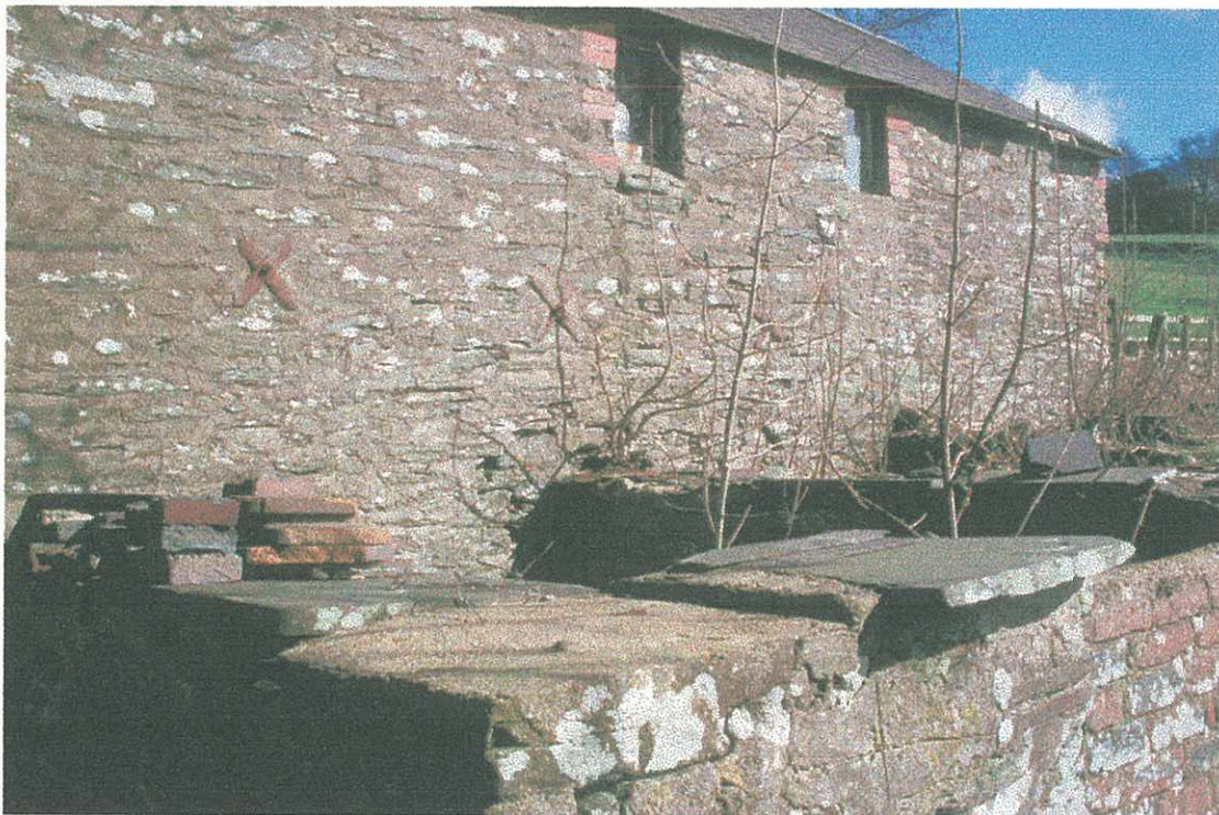
Plate 2: PRN 39376 - pigsty with hen house above