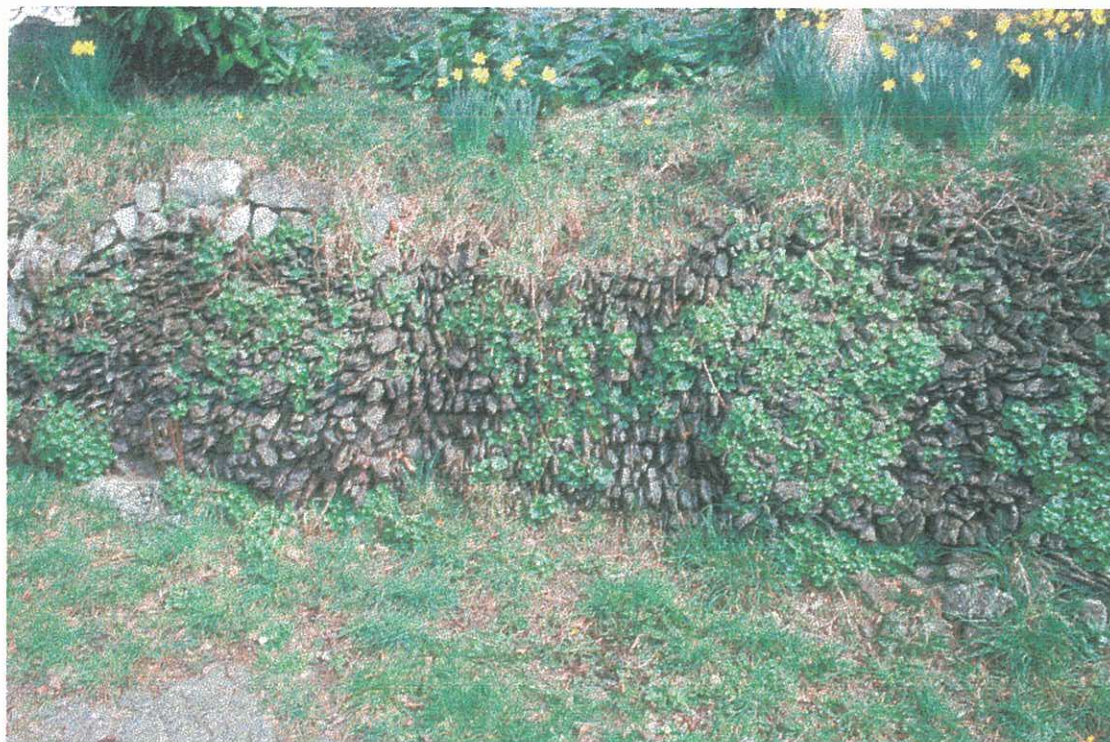
Plate 4: PRN 39373 - unusual decorative drystone wall