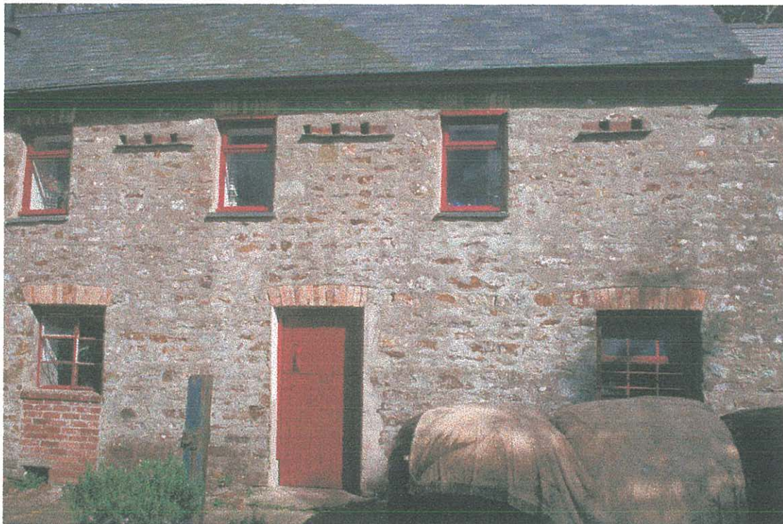
Plate 3: PRN 39374 - cowhouse, 18th century with later windows added