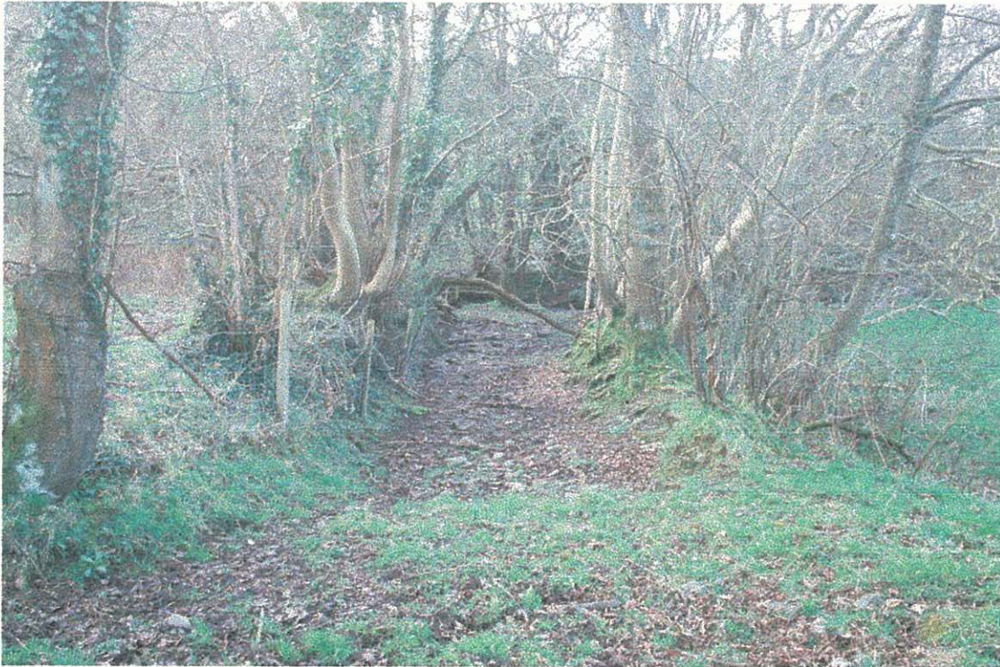
Plate 1: PRN 39371 - part of the lane leading to the site of the former farmstead Cribin Clottas