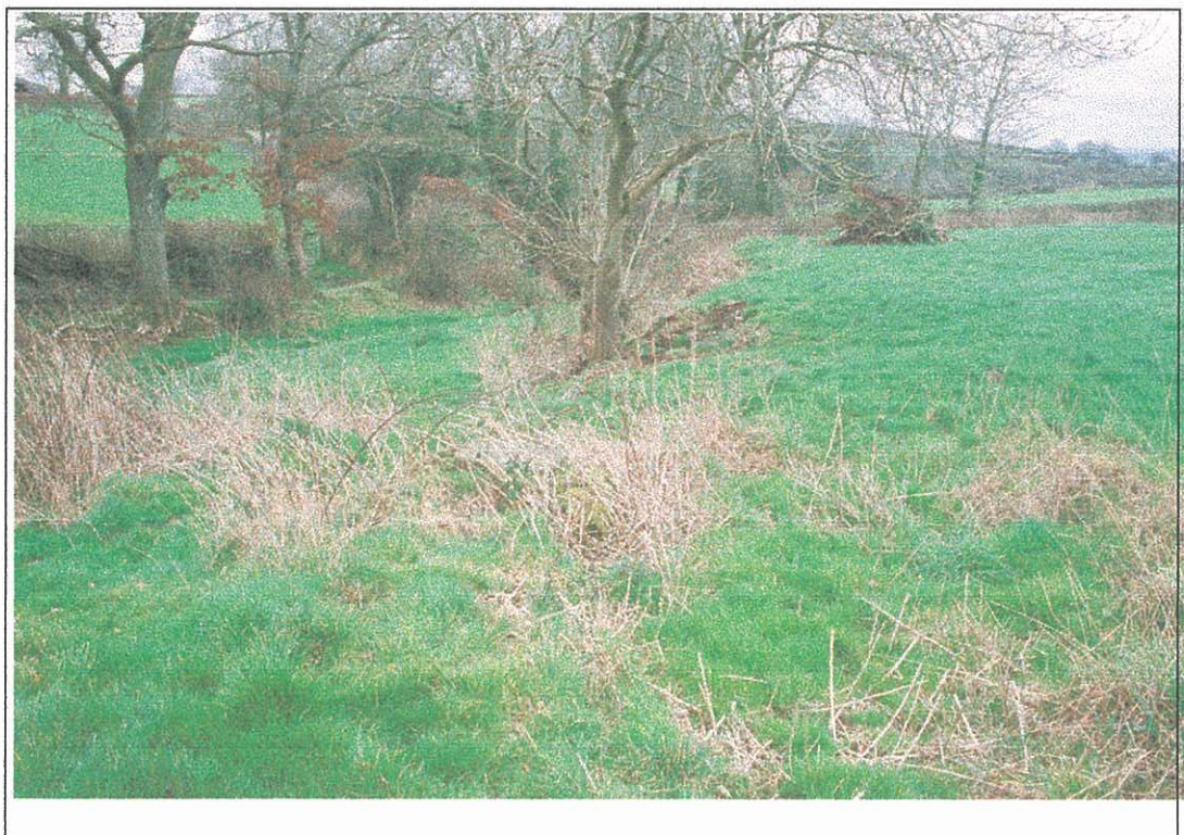
Plate 2: PRN 39383 - old wheel pit, infilled and grass covered