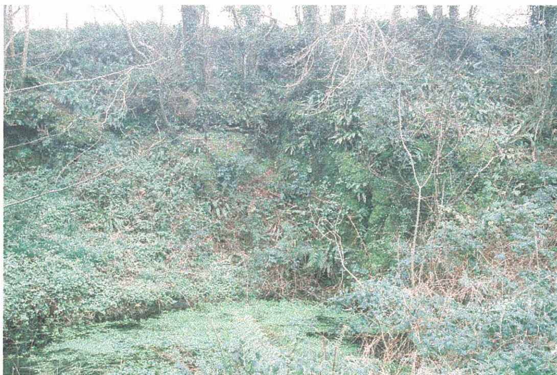
Plate 1: PRN 39382 - small quarry, now a pond