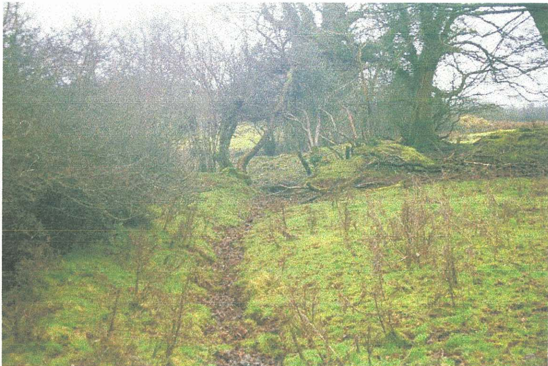
Plate 1: PRN 39334 - view east along the leat where it passes through a field boundary