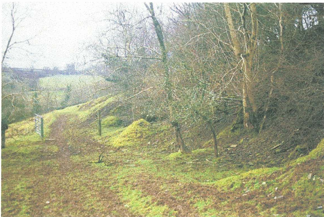
Plate 2: PRNs 39340 & 39341 - the two small quarries alongside the track, looking east