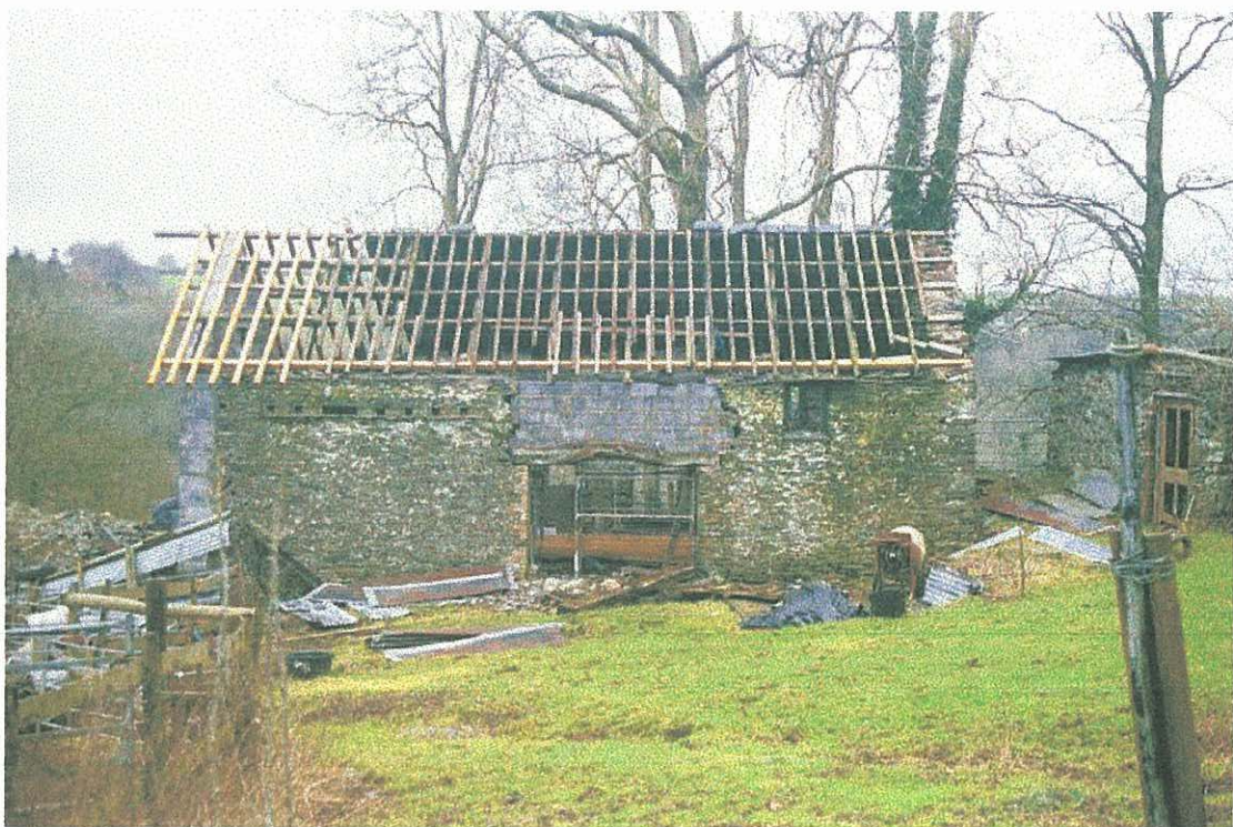
Plate 4: barn/cartshed undergoing extensive rebuilding