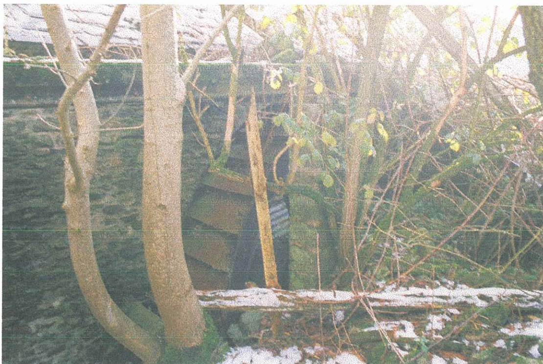
Plate 3: PRN 39327 - the waterwheel on the northwest wall of barn. The wheel and its internal machinery survive in good condition.