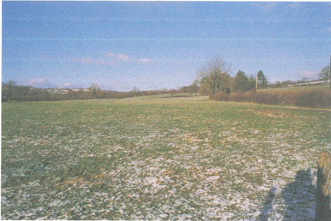
Plate 1: PRN 3382 - looking north along the line of the Sarn Helen Roman road.