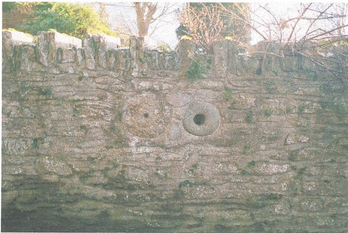
Plate 2: PRN 9577 - Two Roman quern stones built in to a garden wall