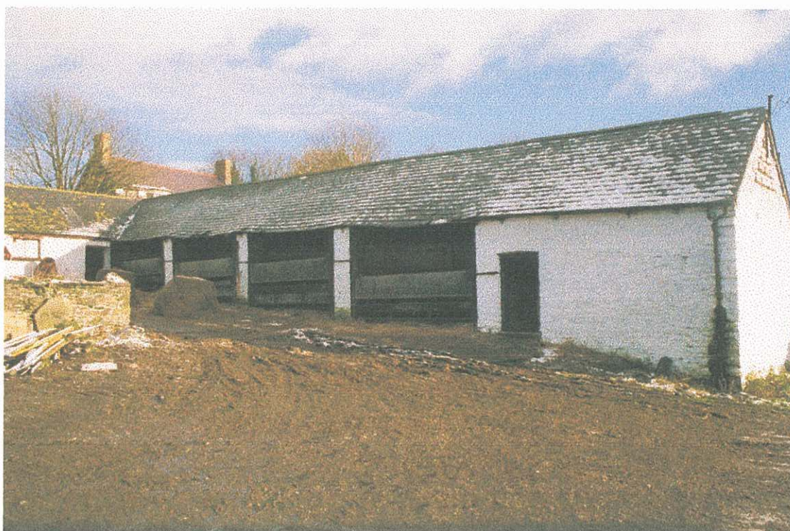
Plate 4: PRN 39330 - farm building forming the southeast side of a mid-19th century planned yard.