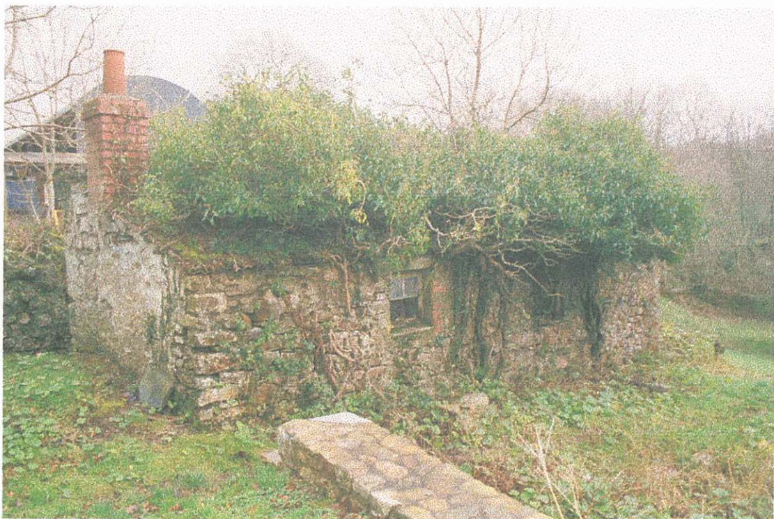
Plate 2: PRN 39322 - worker's cottage in corner of terraced orchard.