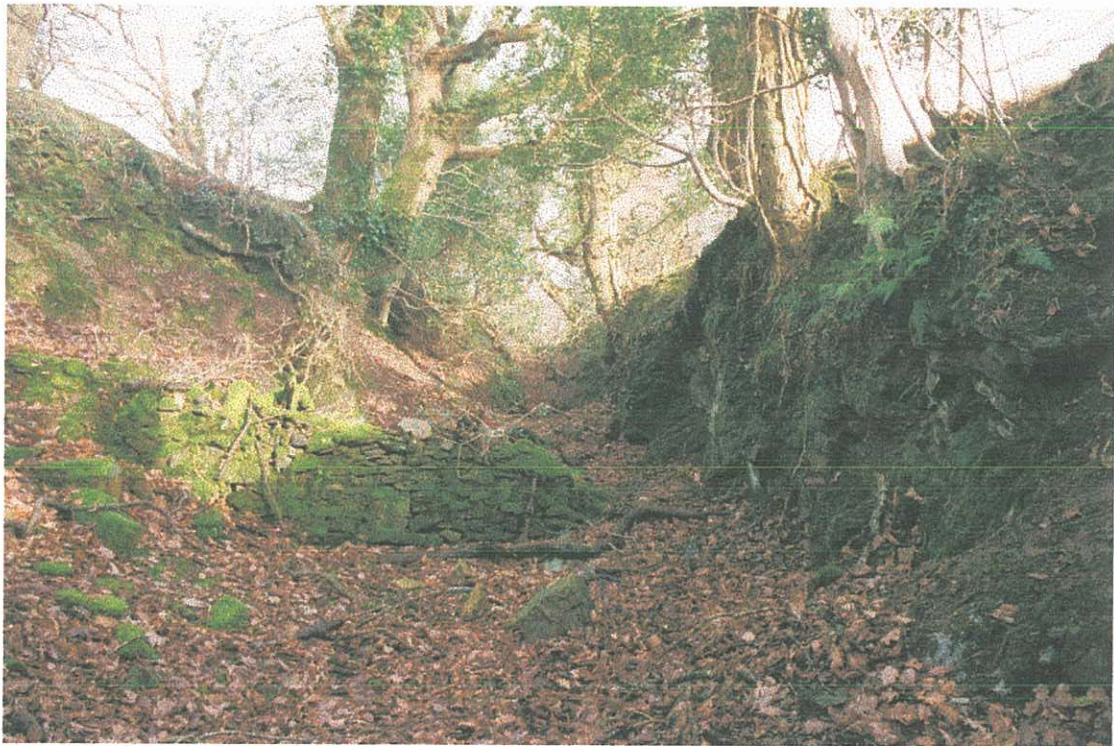
Plate 1: PRN 25109 - a low stone wall constructed across the bottom of possible ore workings