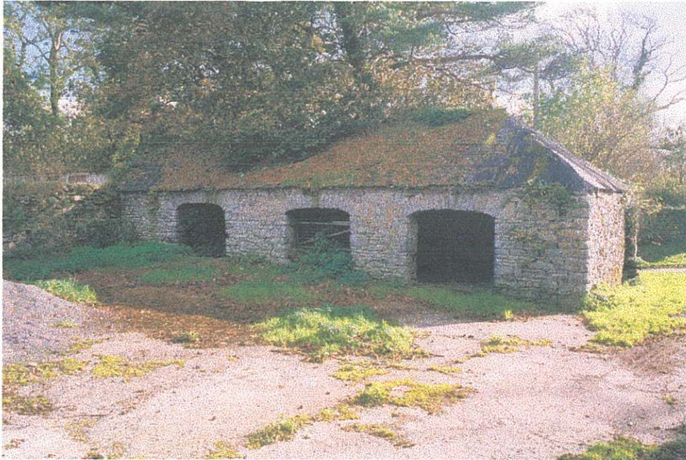
Plate 3: Cartshed (PRN 39606) showing the three arched openings in the north elevation.