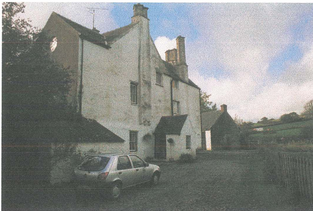
Plate 1: East elevation of east range of the house (PRN 7283). Some of this range dates from the 14 th century.