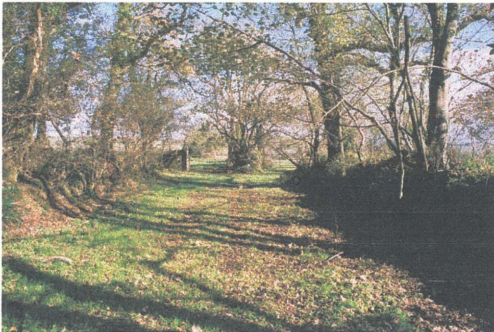
Plate 4: The gravelled trackway (PRN 37646) leading towards Lydstep. The wood (PRN 37640) is on the left of the picture.