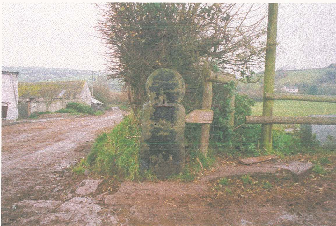
Plate 1: PRN 39307 - Inscribed stone gate post.