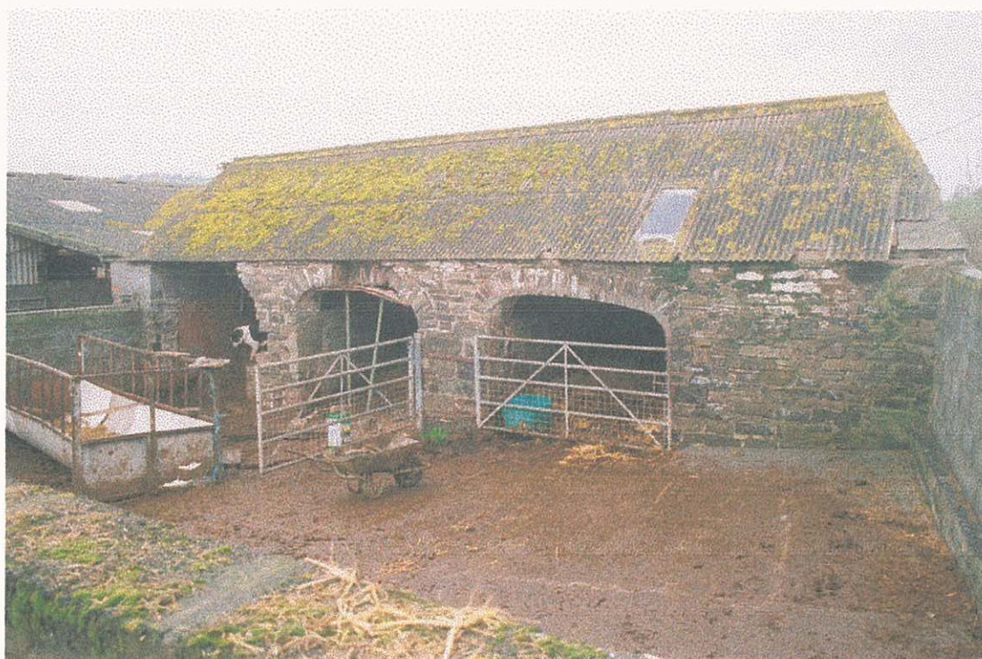
Plate 2: PRN 39308 - cart shed, this is one of the last historic buildings within the yard complex.