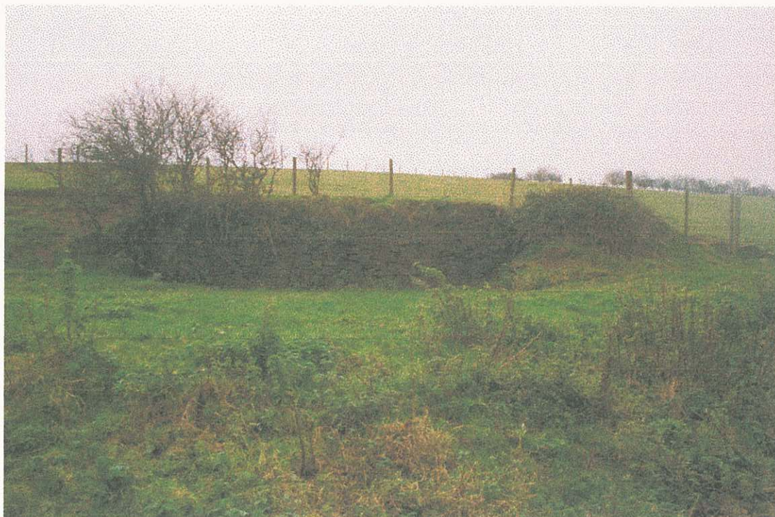
Plate 4: PRN 23580 - the rear wall and house platform of Ffynnon fach cottage.