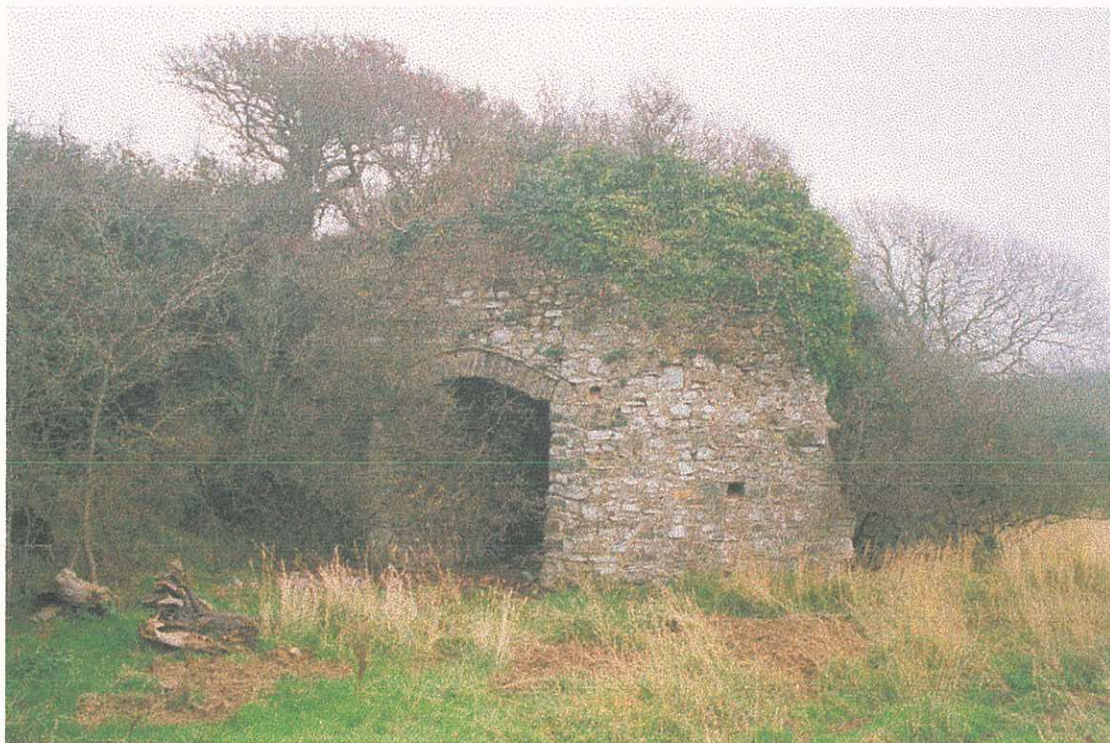
Plate 3: PRN 15736 - the drawing arch of the limekiln at Black Scar.