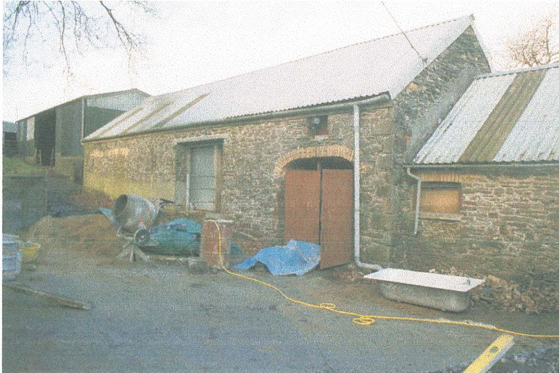
Plate 3: PRN 39107 and part of PRN 39106 at the right of the photograph.