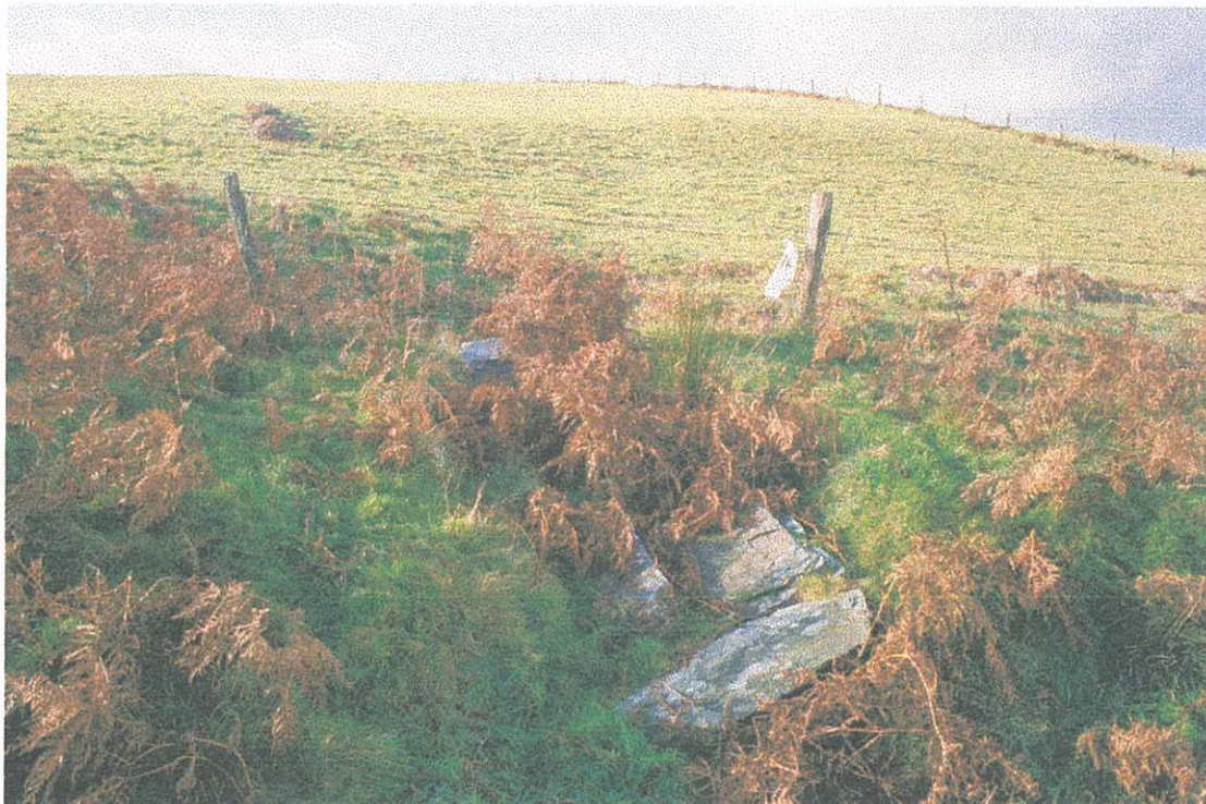
Plate 2: PRN 39104, the capped-stone feature. Note the stones in the foreground slumping into the void.