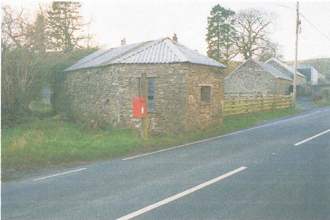
Plate 4: PRN 24750 the tollgate house .