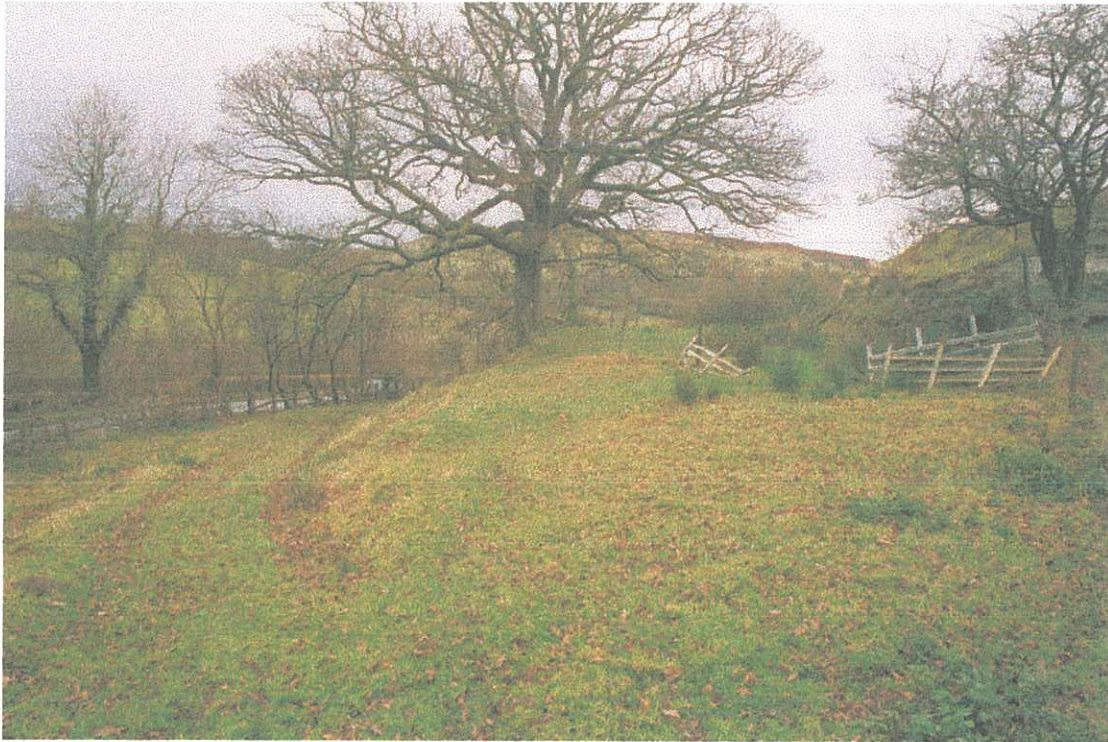
Plate 1: PRN 39103, terraces of the former 18 th century pre-turnpike and the possible line of the Roman road from Llandovery to Pumpsaint.