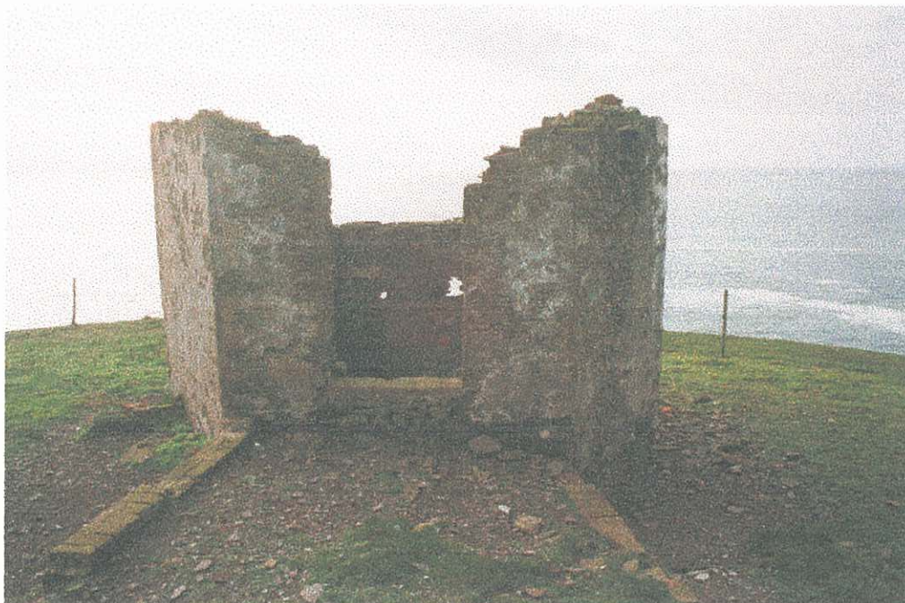
Plate 4: 18 th century lookout post (PRN33437).