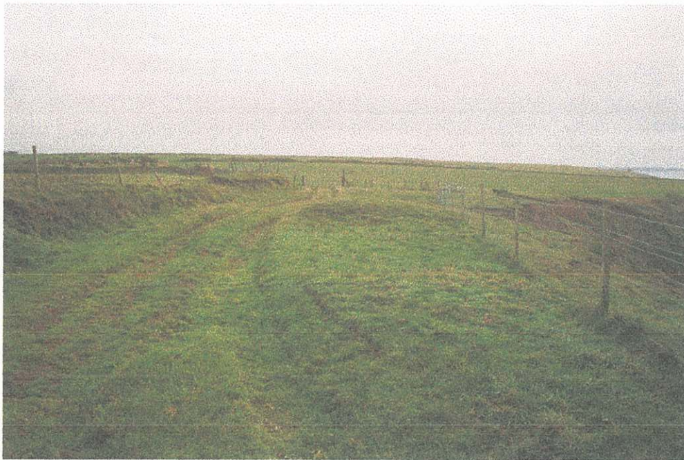
Plate 1: Low earth mound (PRN 39077) alongside the coastal path.