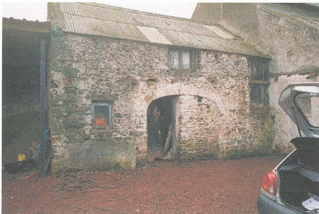
Plate 2: Coach house (Prn 39081). Note the partially blocked archway and the 1st floor entry.