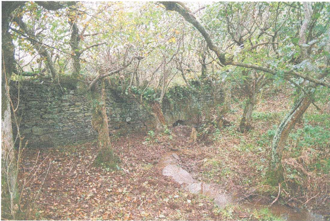
Plate 3: Stone bridge PRN 39083.