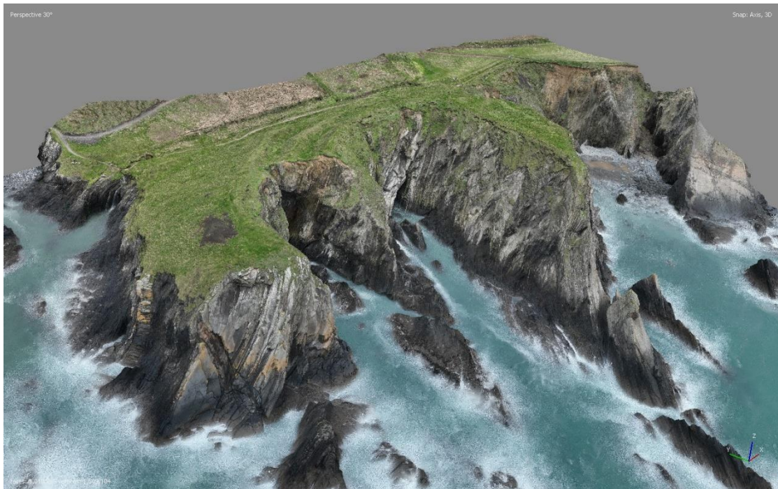
Porth y Rhaw 3D model, March 2024.