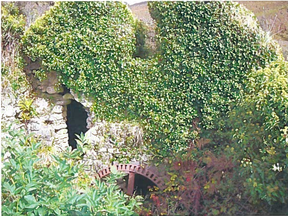
Caerbwdy Mill, remains of walls and machinery. View N. 19/09/2011