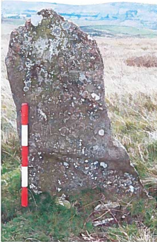
Bedd Arthur Graffiti on stone 15/09/2011