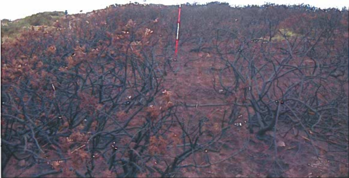
Deer Park. Part of burnt area. View NNW. Scale 2m. 05/10/2011

stone. Some modern rubbish was revealed by the fire and this was pointed out to the National Trust Archaeologist when visiting a week later, who was going to arrange to have this cleared.