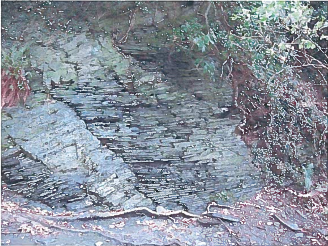
Nevern Pilgrims Cross: small areas of damage to shale face 03/11/2011

The Time Team evaluation on Watery Bay Rath and Gateholm took place in August 2011 with the programme broadcast in January 2012. It appears to have been one of their more successful endeavours and has generally been well received, although some of their conclusions have been commented on. Watery Bay Rath was visited in October with Claudine Gerrard, National Trust Archaeologist for South Wales. All of the backfilled trenches, except for the one on the footpath through the northwest bank (see photo below) were looking good. Here it may be necessary to import some turf and topsoil to improve the sides.