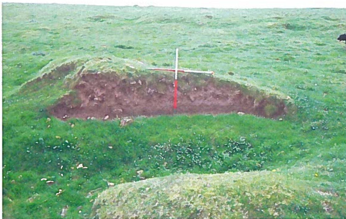
Penally WWI trenches, sheep scrape 14/04/2011