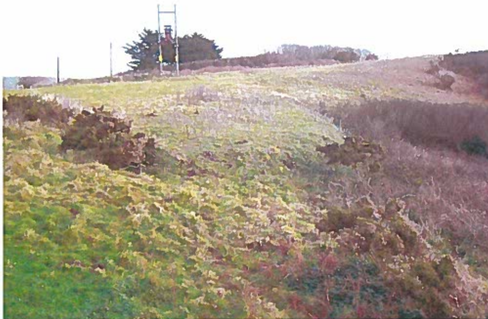
Dale Fort: Interior from bank, south of entrance, "compound clearance spoil tip in foreground" vegetation much reduced by cutting and grazing. View NE 20/01/2012

The higher part of the interior within the newly fenced area has mostly been cleared of blackthorn and the horses now grazing the site appeared to be keeping the bracken down (see photos below).