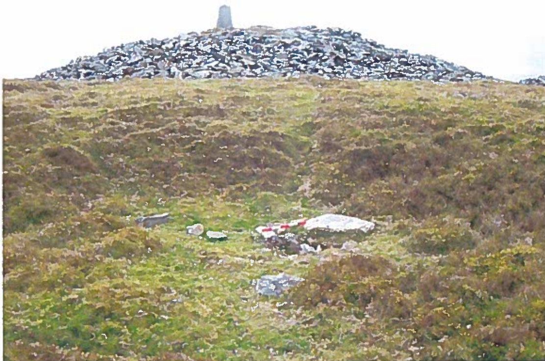
Foel Drigarn damage to hut platform 15/09/2012. View S