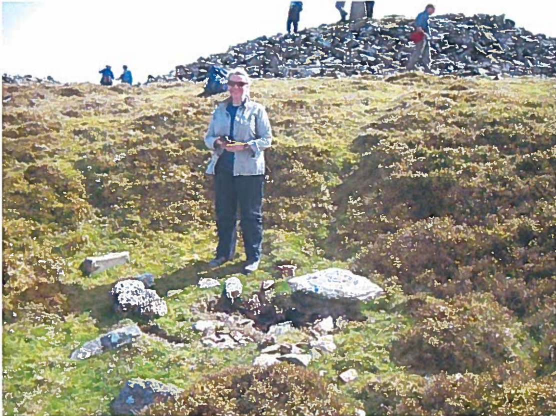
Foel Drigarn hut platform disturbance 10/04/2012, View S