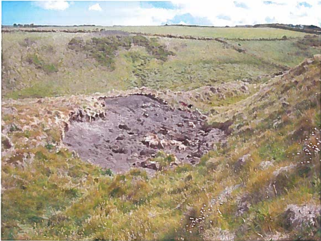
Porth y Rhaw: maximum burn area before turf replaced 10/06/2011