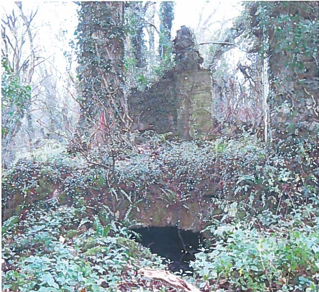
Sisters House, house ruins with large tree on vault. View E. 02/12/12

Due to continuing issues with the trees on the site and the apparent perception that little could be done, a site meeting was arranged on 20/01/2012. The conclusion was that the site should be cleared of some trees and scrub; the ruins are the most important aspect; vaults will not survive if clearance not done; this would be best for bats; owners consent necessary before any action; subject to consent, management plan to be prepared.