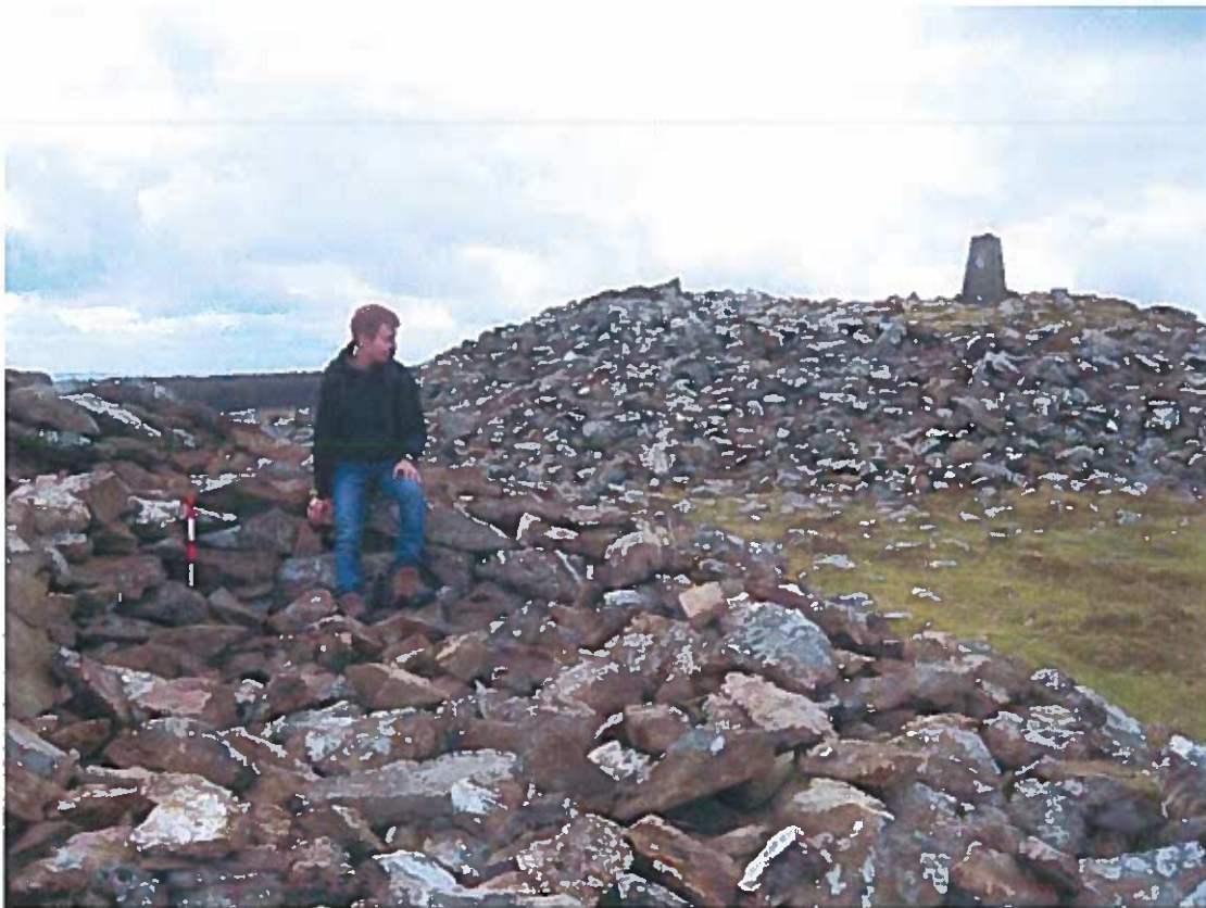
Foel Drigarn slight new disturbance in east cairn, NW side 15/09/2012