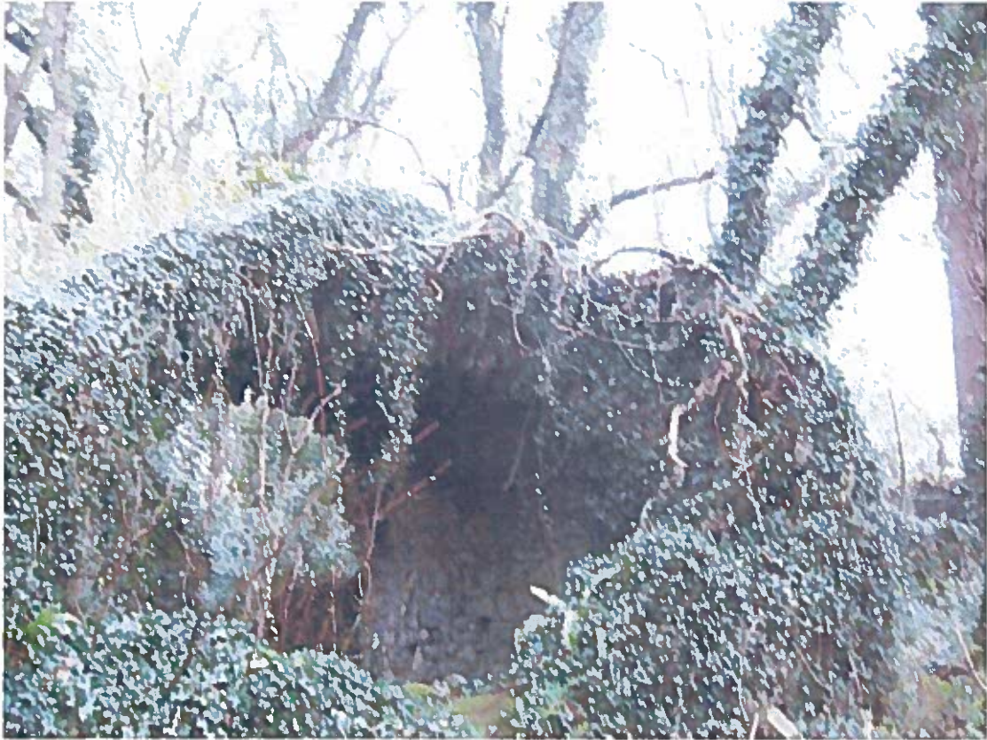
Sisters House, "Chapel" trees causing damage to vault. View NE. 02/12/2011