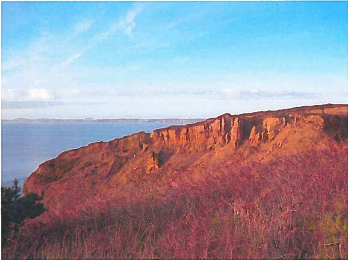
Blackpoint Rath. View N. 16/01/2012