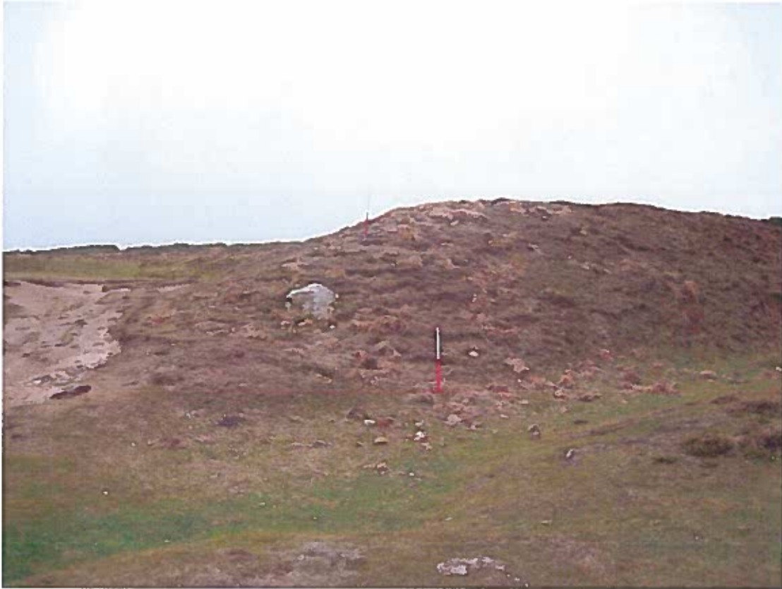
Deer Park: unsuccessful re-turfing of southern end of rampart. View NW. Scales 1m. 05/10/2011

The consolidation undertaken by the National Trust at the southern end of the rampart, has not been successful, probably due to subsequent weather conditions and needs to be done again. Possibly the best time would be early spring when re-growth is likely to be more vigorous.