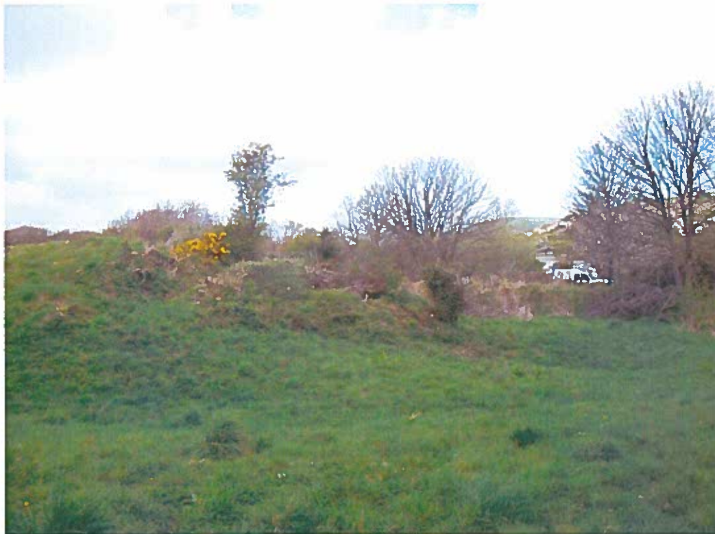
Old Castle, Newport, scrub on east side of ringwork. View NW 15/04/2011