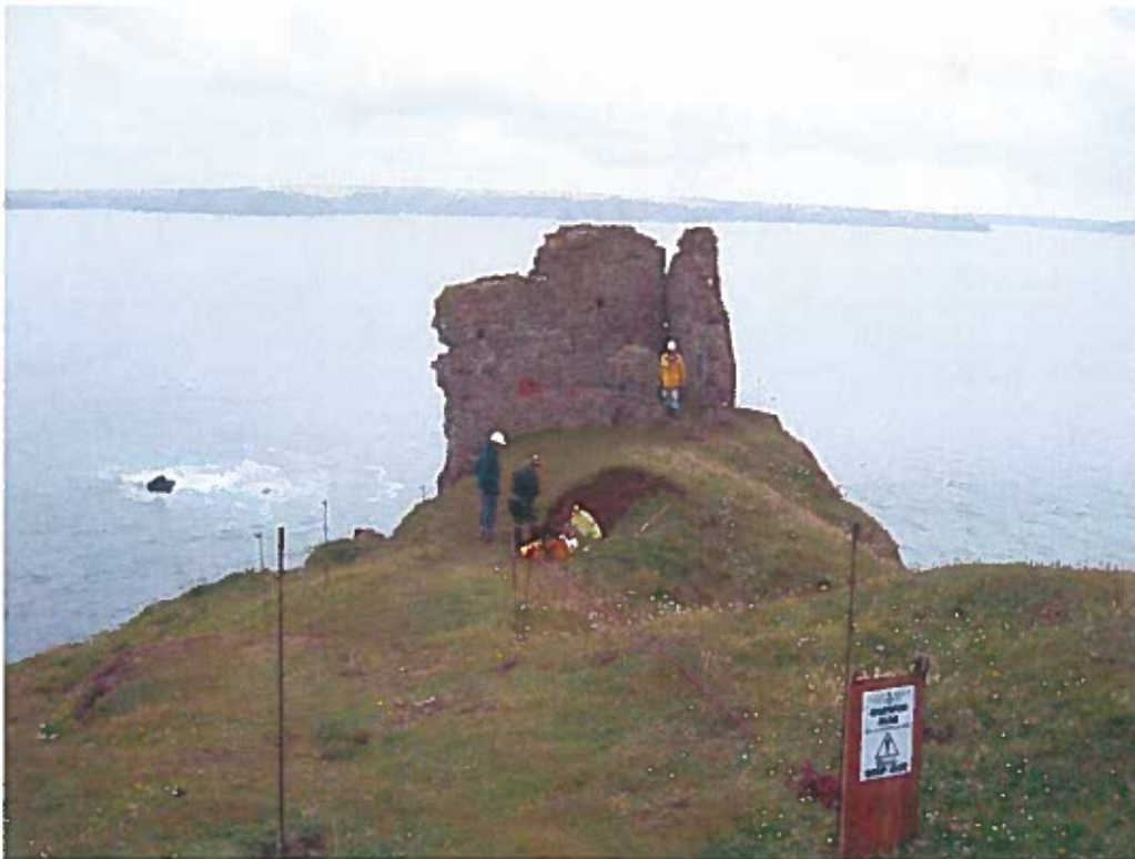
East Blockhouse Angle during excavation. WWII gun pit in front of the building being investigated.