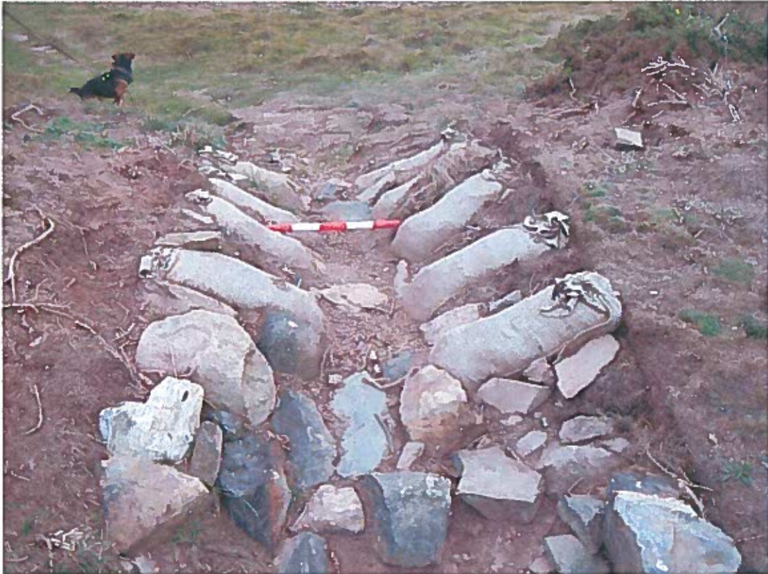
Watery Bay Rath, modern entrance through northwest bank as consolidated by Time Team. View S, Scale 0.5. 11/10/2011