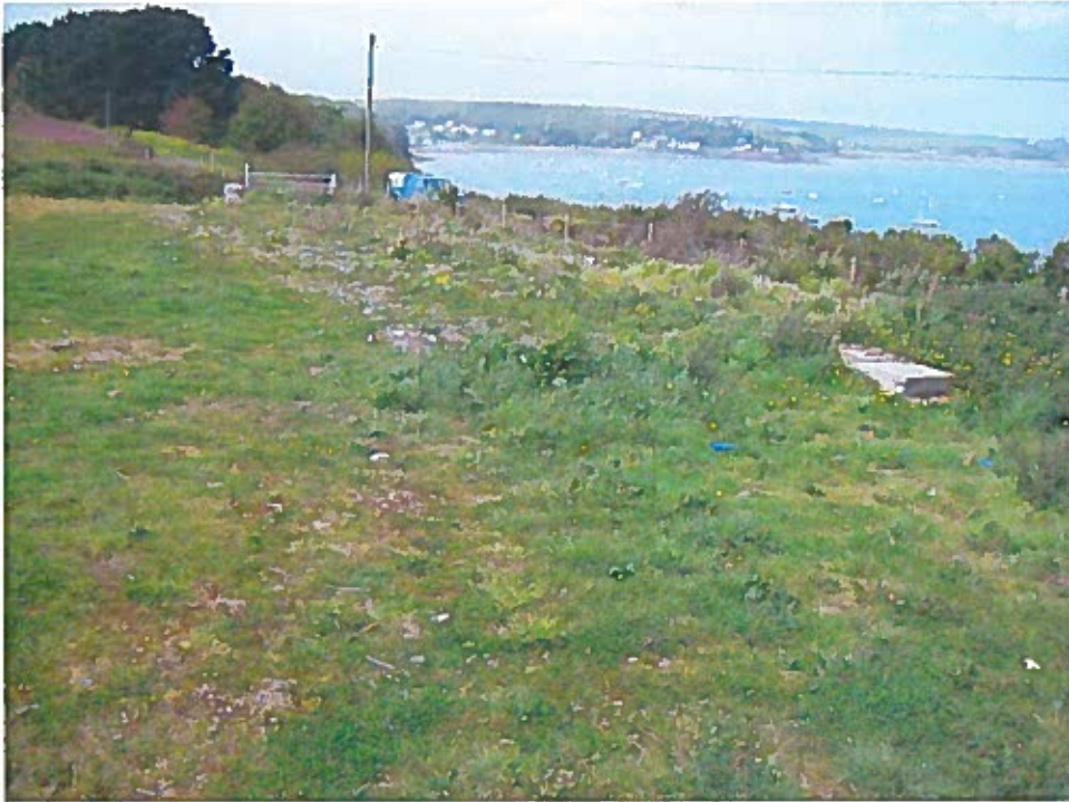
Dale Fort area adjacent to north side of SAM. View WNW 06/05/2011

The higher part of the interior within the newly fenced area has mostly been cleared of blackthorn and the horses now grazing the site appeared to be keeping the bracken down (see photos below).