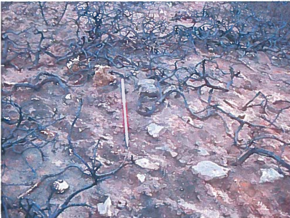
Deer Park: Possible wall in burnt area. View NW. Scale 1m. 05/10/2011