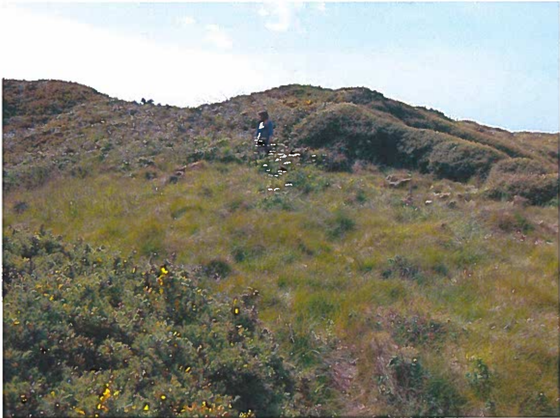
Tower Point Fort entrance before clearance. View W. 19/05/2011