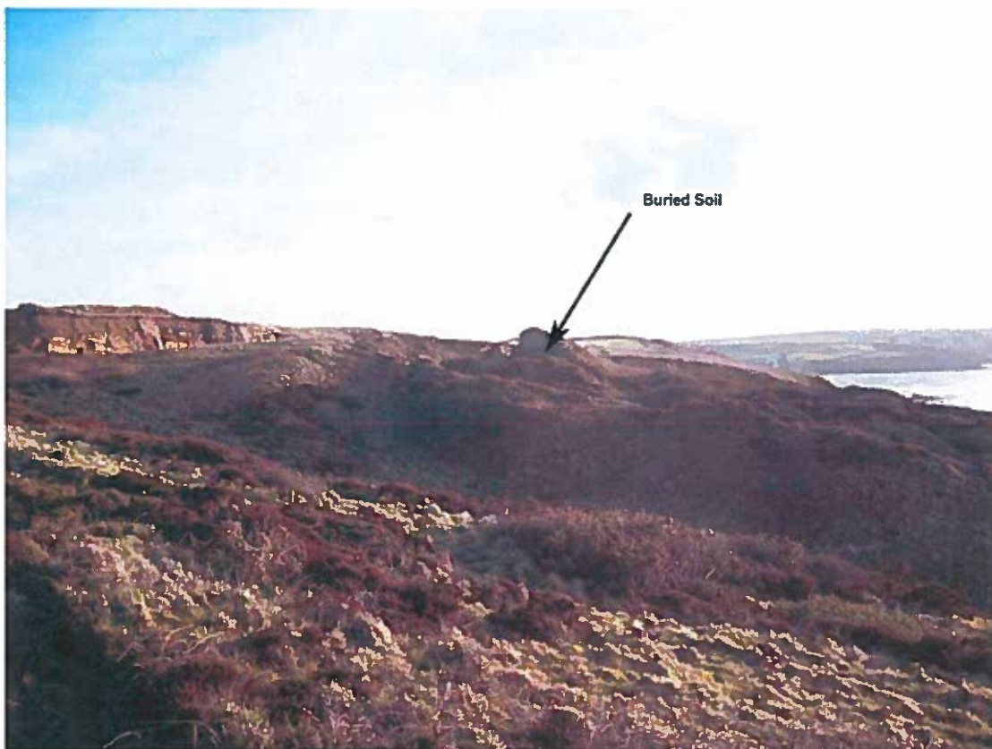
Blackpoint Rath. Location of possible buried soil. View S. 16/01/2012