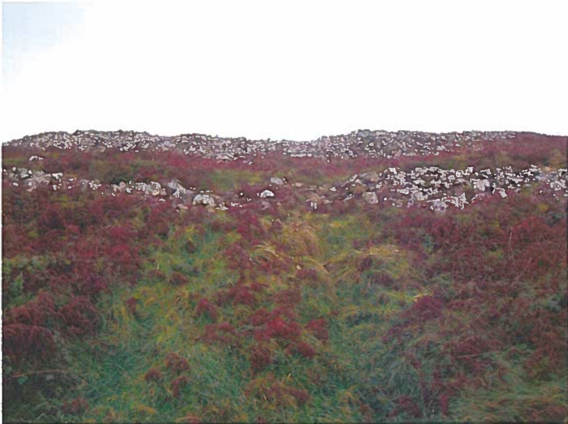
Garn Fawr 4 x 4 damage on north side of outer rampart view S. 11/11/2011

Seven small areas of damage, where some of the shale rock face adjacent to the cross has been pulled out. The damage may have occurred during the week end of 29-30/10/2011, possibly while removing coins placed between the stones. This was reported to the PCNPA by the people living in the neighbouring property, 'Nevern View'. In most places where the stones have been removed there was evidence that the rear of the stones had been bonded with mortar.