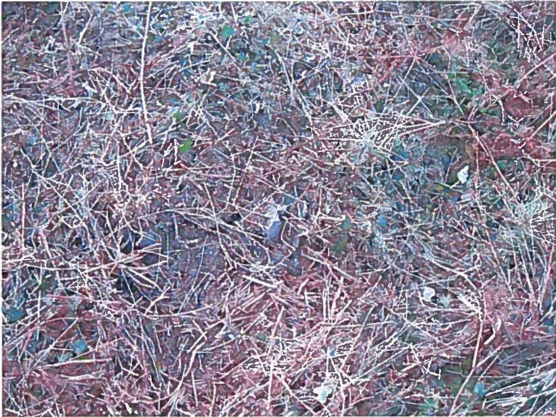
Castell Heinif: edge of hedge bank at north end of inner ditch. Removed as potential trip hazard. View S. 18/01/2012