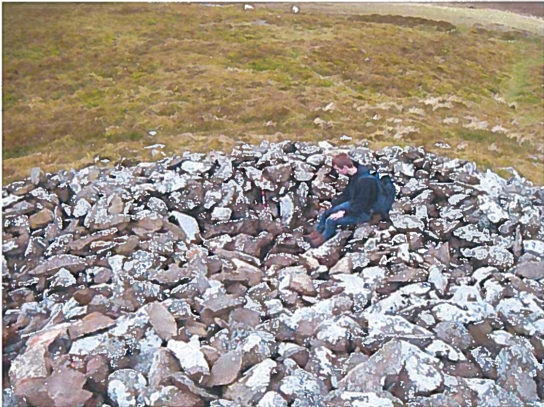
Foel Drigarn: new hollow on west side of west cairn

SAM PE 013 St Non's, St David's (Not undertaken as part of Cadw funded SAM management)