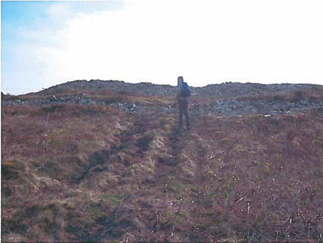
Garn Fawr 4 x 4 damage on north side of outer rampart view S. 09/04/2011