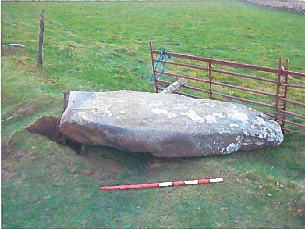
Bedd Morris, broken upper stone. Scale 1m. 10/10/2011