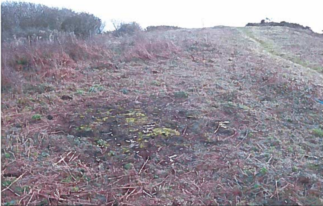
Dale Fort: Clearance on north side of interior View E 20/01/2012