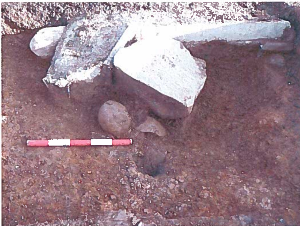
Bedd Morris, base of stone, hammer stone and concrete repair. View E. Scale 0.5m 08/02/2012