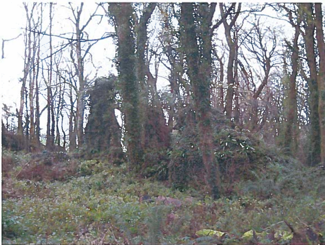
Sisters House, House ruins. View NW. 02/12/2011

Reported in January 2012 by PCNPA ranger as having been damaged by a vehicle or vehicles driving over it. Site visit was arranged combined with other work but ran out of time, and a second visit was abandoned due to conditions being very mist,