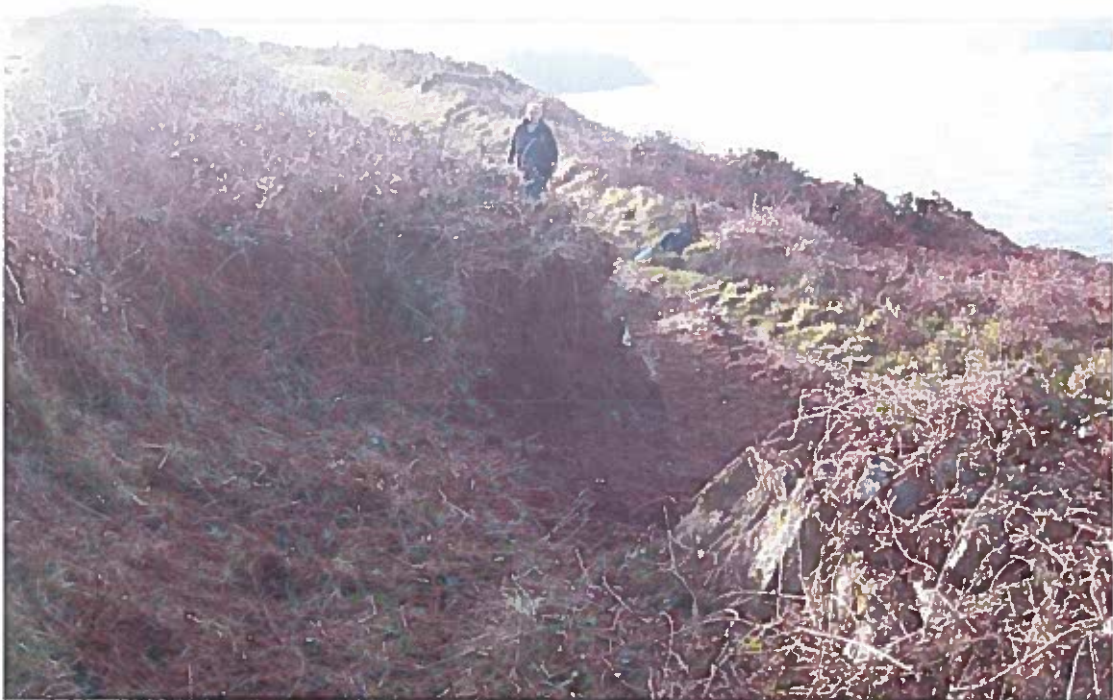
Castell Heinif: cut through hedge banks at south end. View S. 18/01/2012