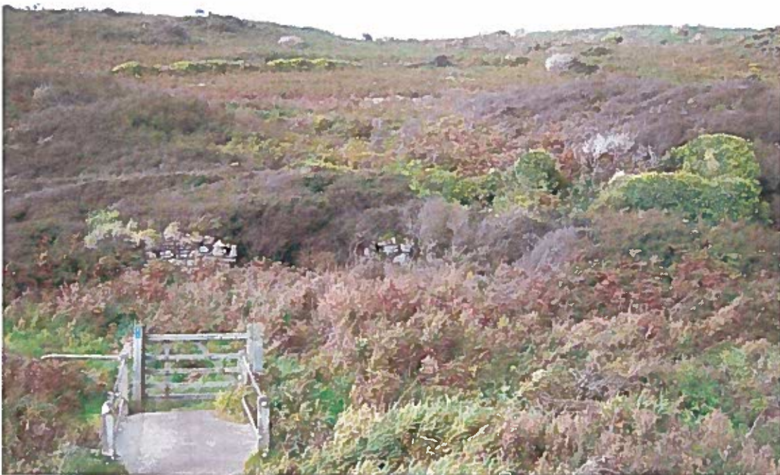
Caerbwdy Mill, overgrown. View W. 19/09/2011