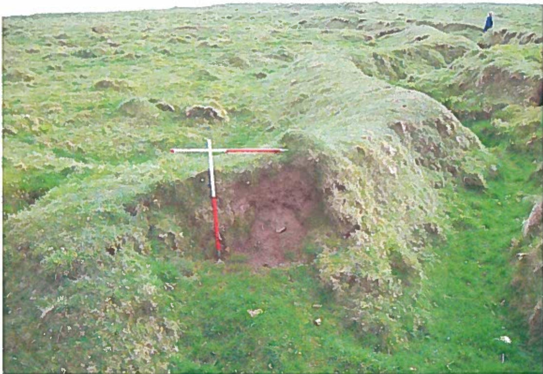
Penally WWI trenches, sheep scrape 14/04/2011