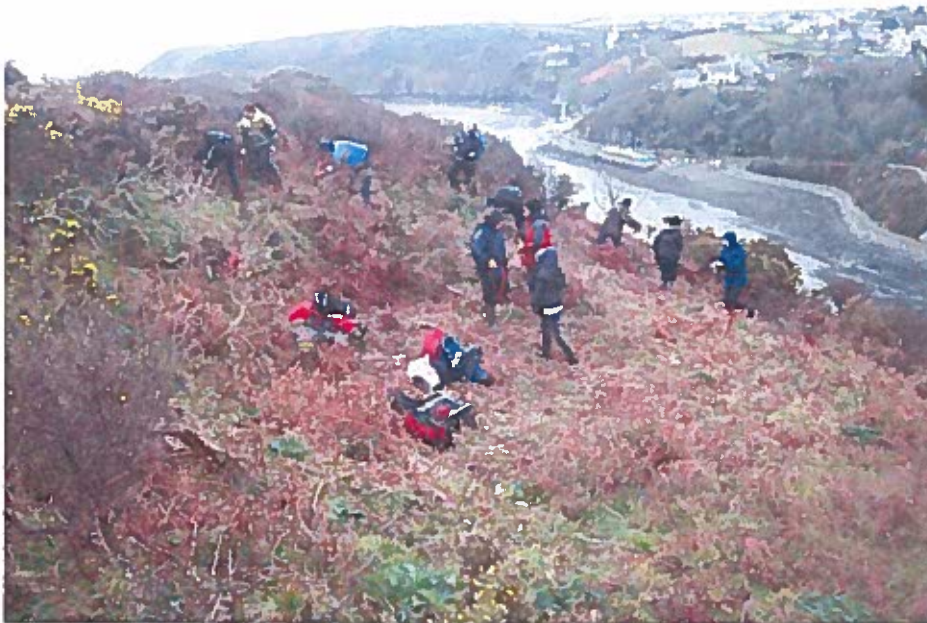
Solva Ridge Fort: vegetation being cleared with National Trust and PCNPA plus Portfield School pupils. One of the hut platforms in foreground. 26/01/2012