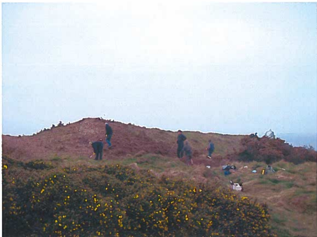
Tower Point Fort after clearing. View NW. 29/02/2012