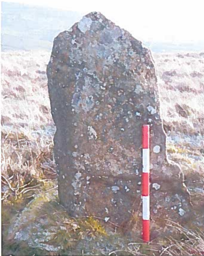
Bedd Arthur: stone that had suffered graffiti, now almost invisible. Scale 0.5. View NE. 11/12/2012