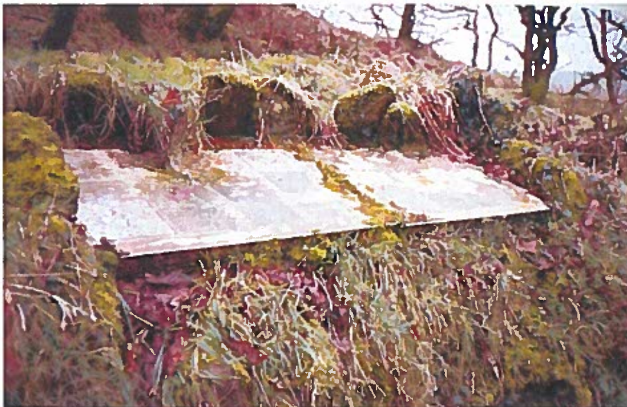
Tre-Gynon panels.