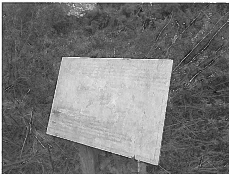
Garn Wern: information panel in need of replacement