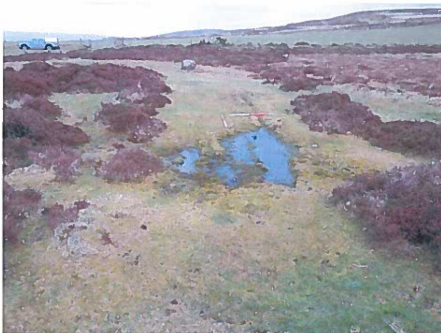
Glyn Gath: old wheel rut damage to centre of barrow. Scales 1m. View N. 7/12/2012