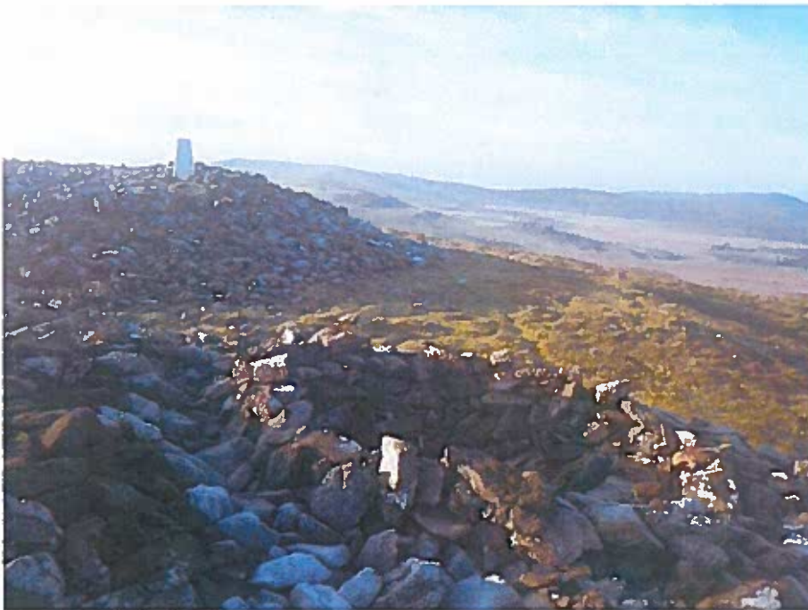
Foel Drigarn: Damage to north cairn. Scale 0.5m View S 11/12/2012 (Freezing temperatures at the time of the visit caused the camera to mist up)

SAM sites in numerical order. Non-SAM sites at end of list