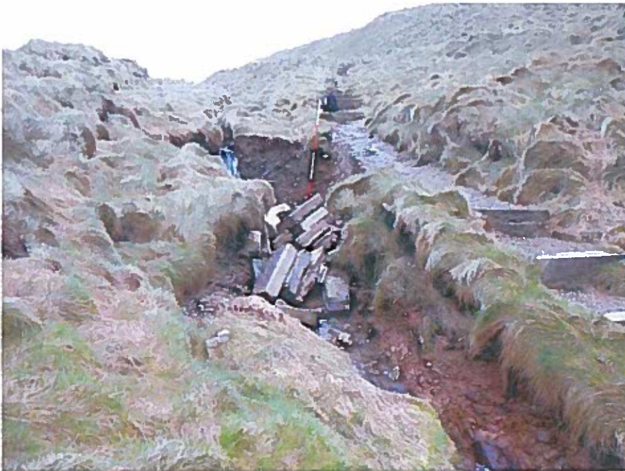
Porth y Rhaw: water damage to retaining wall. Scale 2m. View E. 12/2/2012