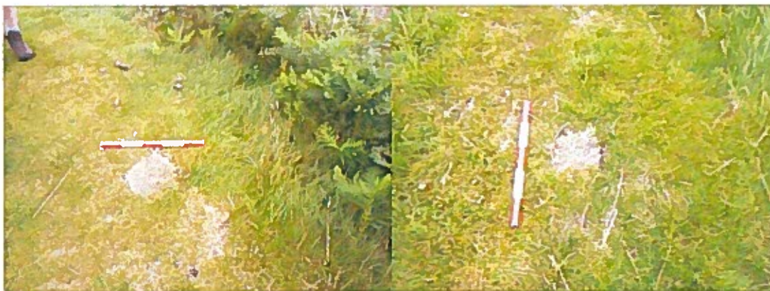
Crugiau Cemmaes: Possible damage by metal detectorist. Scale 0.5m