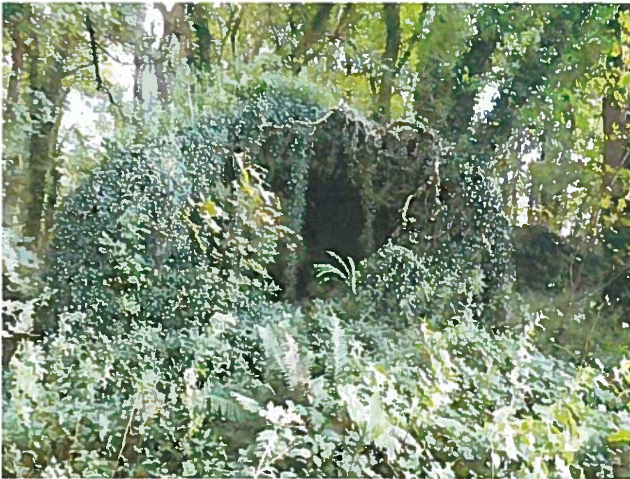
Sisters' House: "Chapel" trees causing damage to vault. View E. 11/9/2012

Tree clearance is also expected to take place in and around the walled garden, to the west of the Sisters' House.