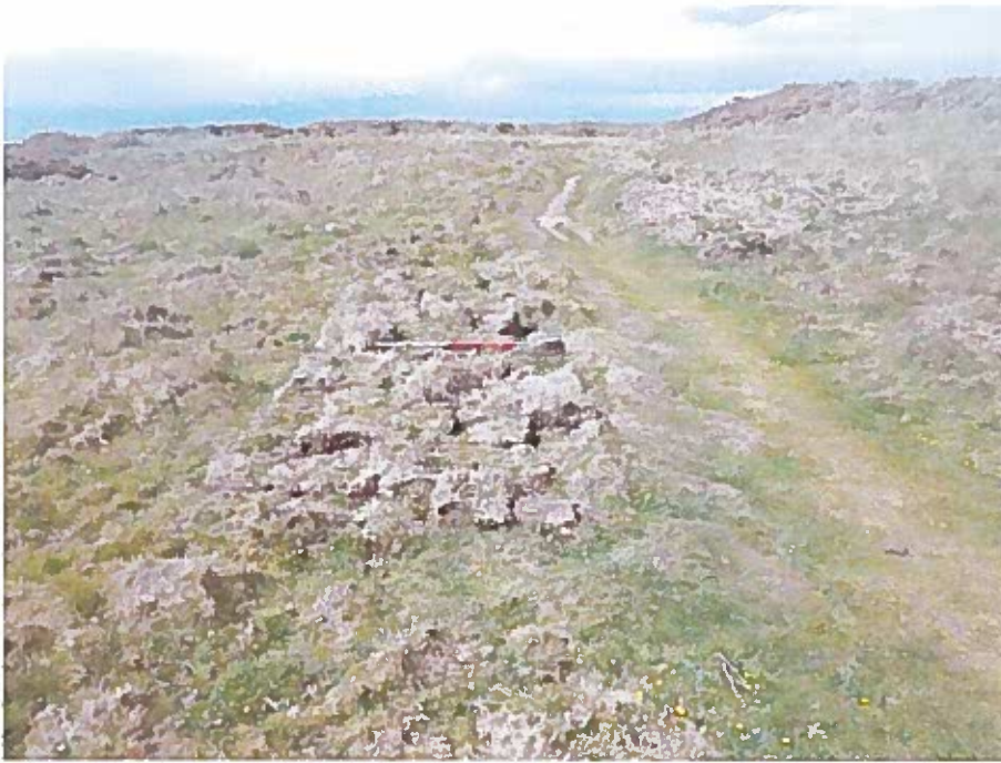
Watery Bay Rath: Backfilled Time Team Trench within fort just to the N of entrance. Scale 1m. View N. 13/4/2012