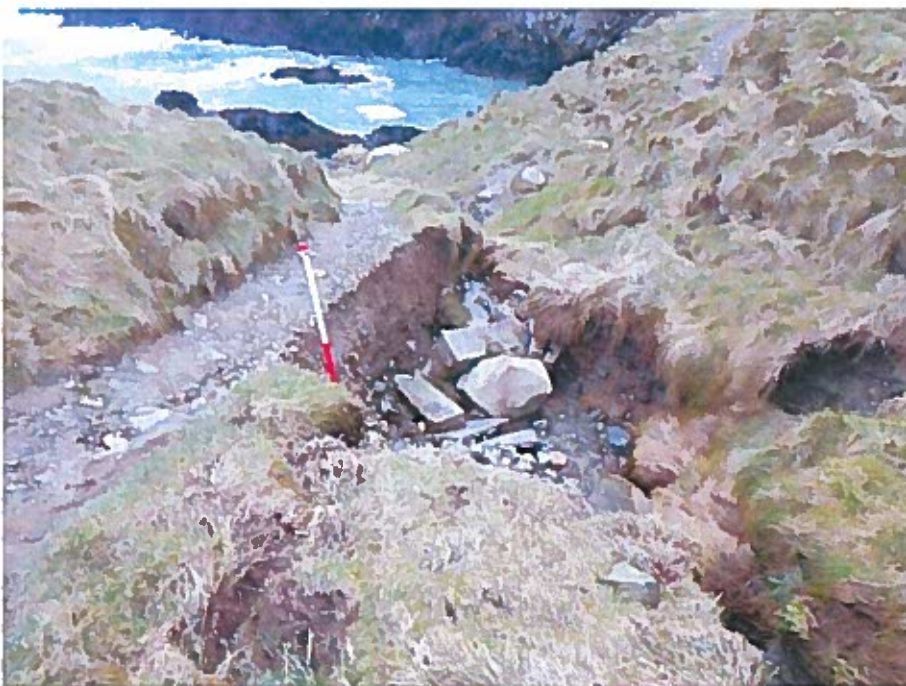
Porth y Rhaw: water damage to retaining wall. Scale 2m (top). View W. 12/2/2012