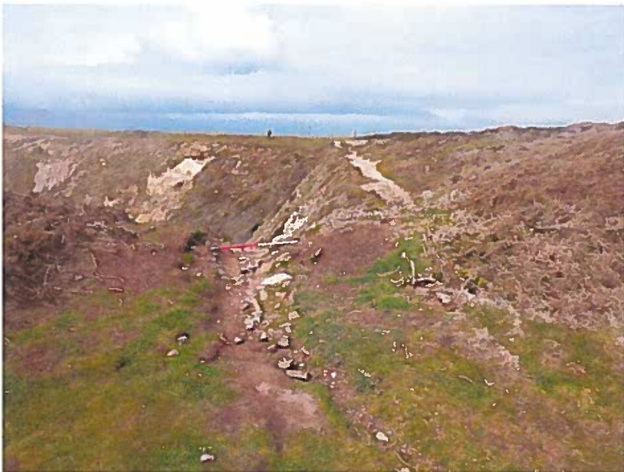
Watery Bay Rath: Time Team trench through the bank as seen in the spring. Scale 1m. View N. 13/4/2012