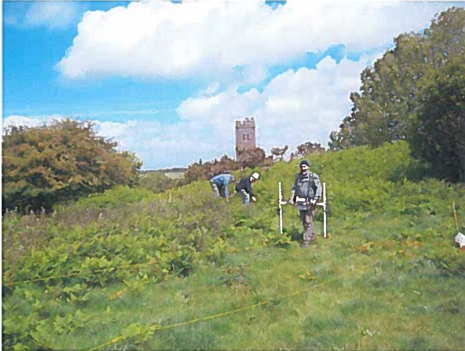
Walwyn's Castle: Undertaking geophysical survey. View N. 25/5/11