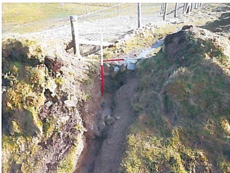
Porth y Rhaw: water damage to through hedgebank creating a step. Scales 1m. View NE. 12/2/2012