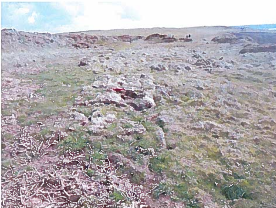
Watery Bay Rath: Backfilled Time Team Trench towards the north of the interior. Scale 1m. View S. 13/4/2012