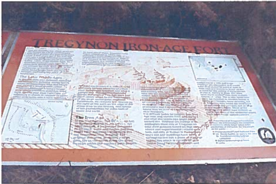
Tre-Gynon English panel.