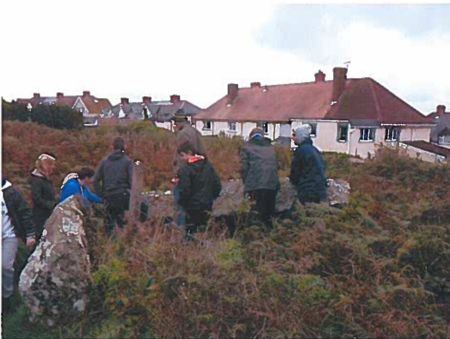
Garn Wern: Pupils from Portfield School about to start clearance work on the site