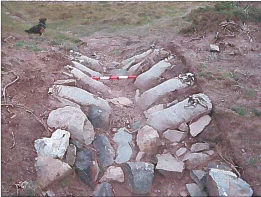
Watery Bay Rath: modern entrance through northwest bank as consolidated by Time Team. View S, Scale 0.5m. 11/10/2011

The backfilled Time Team trenches through the north bank, which is used as part of the Coast Path, were still looking very raw (see photos below).