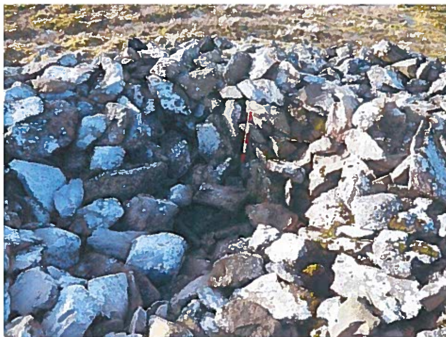
Foel Drigarn: damage to SW cairn. Scale 0.5m. View SW. 11/12/2012

The disturbance previously noted to the centre of a hut platform just to the north east of the central cairn (NGR by basic GPS SN 15773/33624) (see photo in last report), possibly the result of metal detecting or geocache activity, was repaired. However a possible modern camp fire with stone surrounds was observed in an adjacent hut platform (see photo below) (NGR by basic GPS SN 15774/33636).