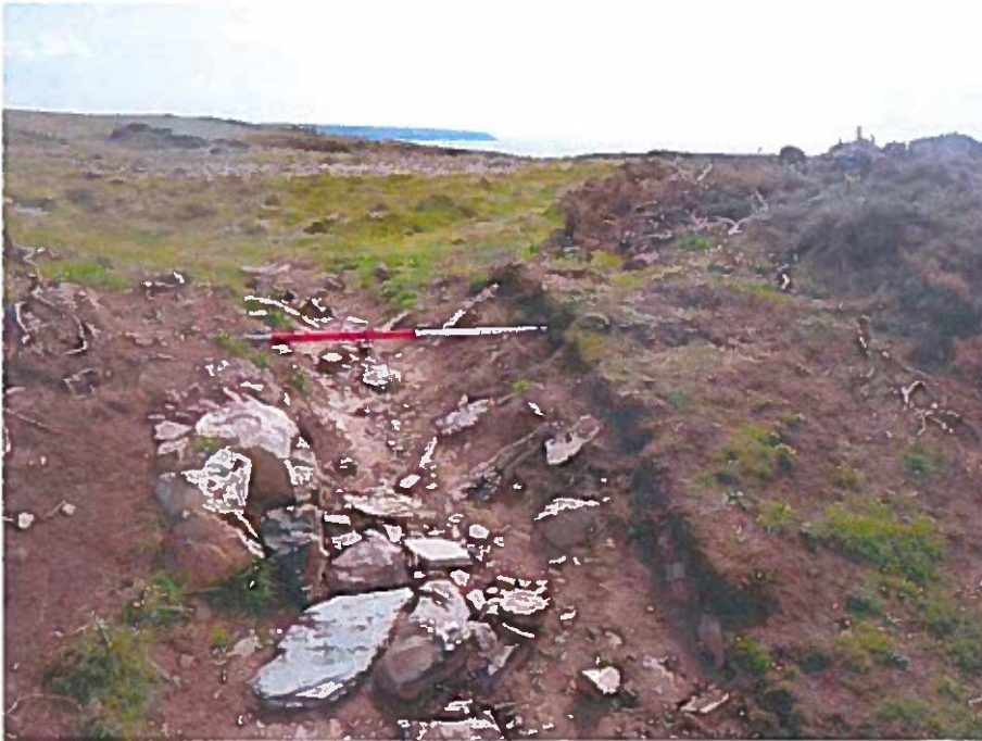
Watery Bay Rath: Time Team trench through the bank as seen in the spring. Scale 1m. View S. 13/4/2012