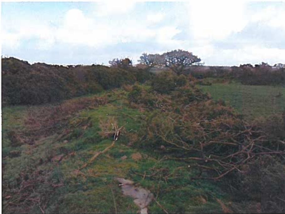
Castell Mawr: clearance underway just north of west entrance. View N. 7/12/2012

Following the work done by Mike Parker-Pearson's team in September 2012, the local PCNPA ranger and volunteers spent a couple of days clearing vegetation on the site. The site was visited on 7/12/2012 when the volunteers were due to be on site but was postponed due to poor weather. More clearance work has subsequently been done and no more is envisaged prior to the archaeological work in September 2013.