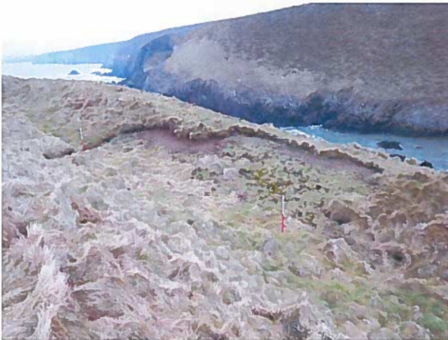
Porth y Rhaw: area of grass fire grow-back. Scales 1m. View W. 12/2/2013

The revetment wall between the stream and edge of the Coast Path was immediately rebuilt and the "step" through the hedge bank was made good as emergency repairs, after discussion with Louise Mees (a Scheduled Ancient Monument Damage Assessment Report will be sent in regarding this matter). It is intended to undertake full repairs at a later date, possibly with some footpath improvements, probably during or just after the summer. Scheduled Ancient Monument Consent will be obtained before undertaking this further work.