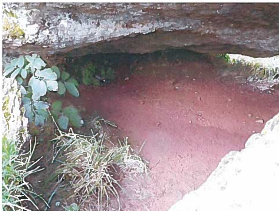
Kings Quite Burial Chamber: under capstone. View SE 6/11/2012