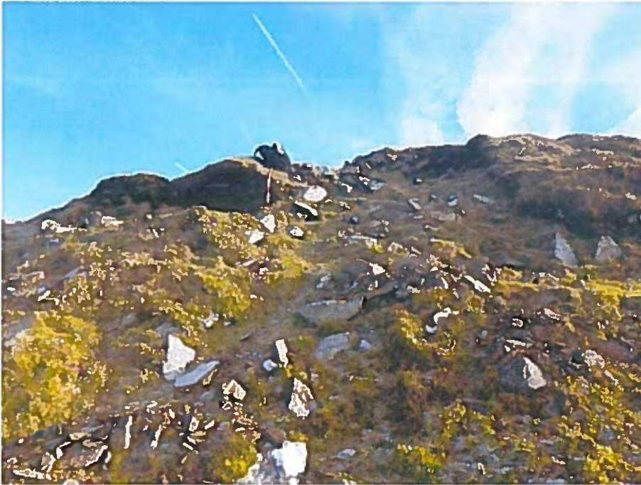
Foel Drigarn: Sheep scrapes. Scale 0.5m. View E. 11/12/2012