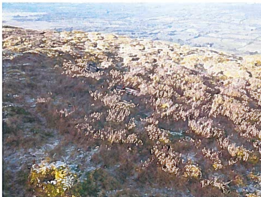
Foel Drigarn: Possible campfire. Scale 0.5m. View SW. 11/12/2012

The disturbance previously noted to the centre of a hut platform just to the north east of the central cairn (NGR by basic GPS SN 15773/33624) (see photo in last report), possibly the result of metal detecting or geocache activity, was repaired. However a possible modern camp fire with stone surrounds was observed in an adjacent hut platform (see photo below) (NGR by basic GPS SN 15774/33636).