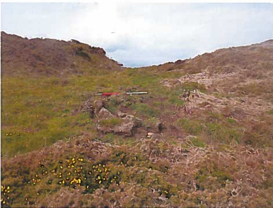
Watery Bay Rath: Backfilled Time Team Trench to the SE of entrance. Scale 1m. View N. 13/4/2012