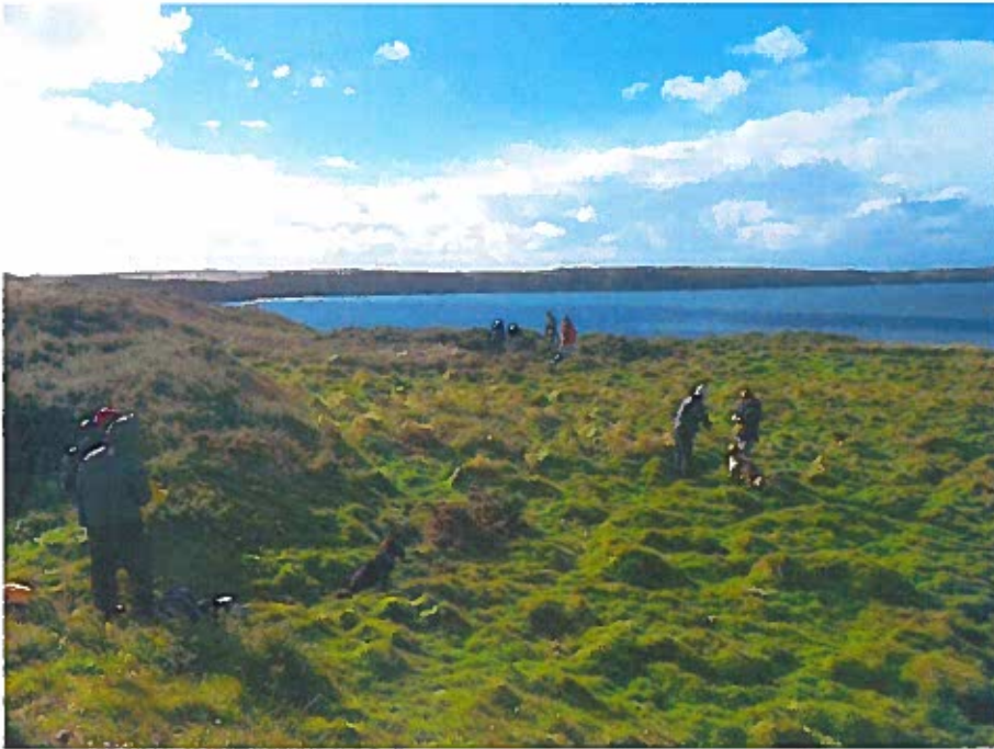
Tower Point Rath: volunteers clearing vegetation on south side and interior of the entrance. View SW. 1/11/2012

A full report has been submitted to Cadw on the re-routing of the footpath.