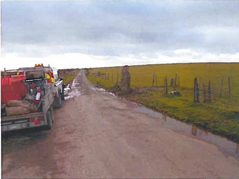
Bedd Morris: Stone re-erected and temporary barriers just removed. View S. 7/12/2012