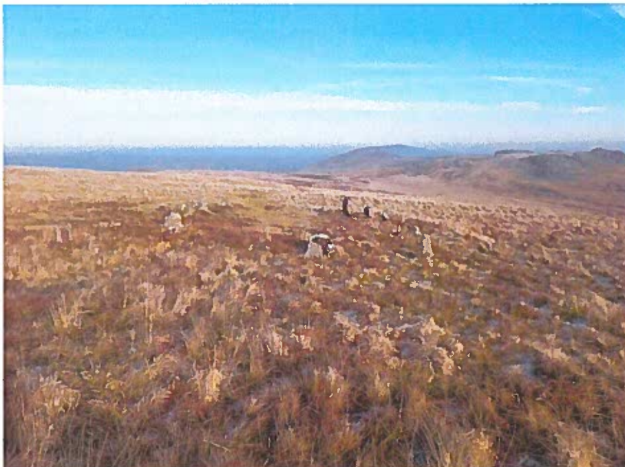
Bedd Arthur: General view. View NW. 11/12/2012