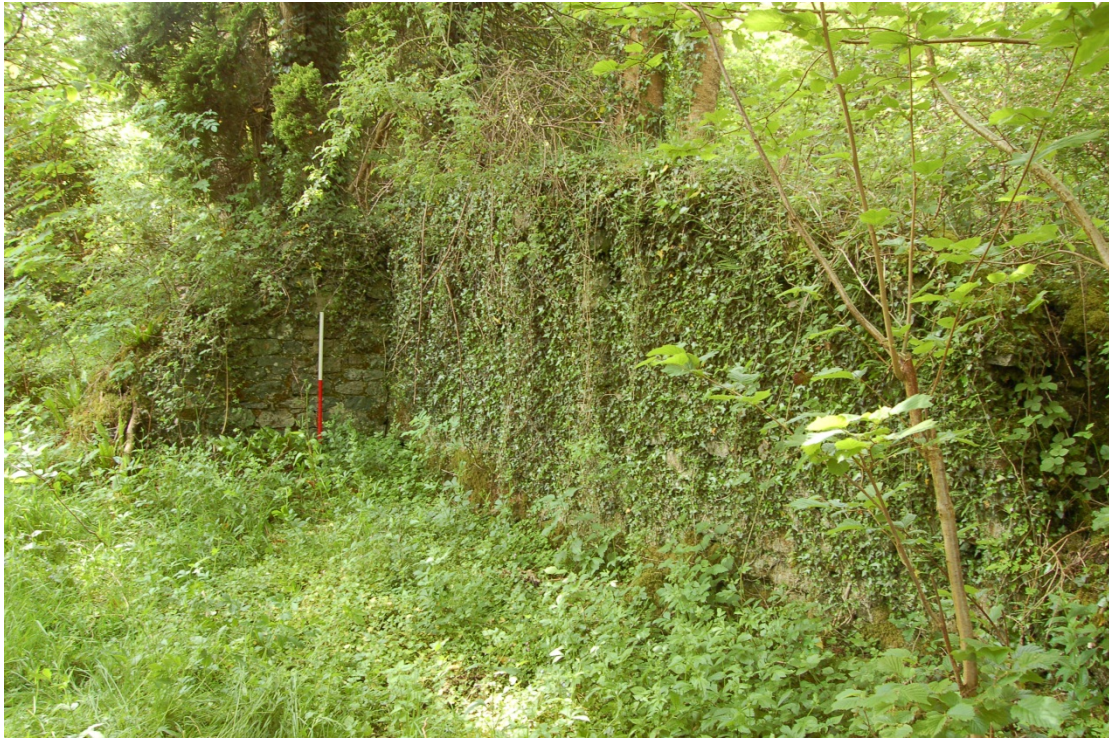
Looking southwest, south interior corner of the mill under thick ivy cover and with saplings and more mature trees growing close to the structure (2012, DAT)