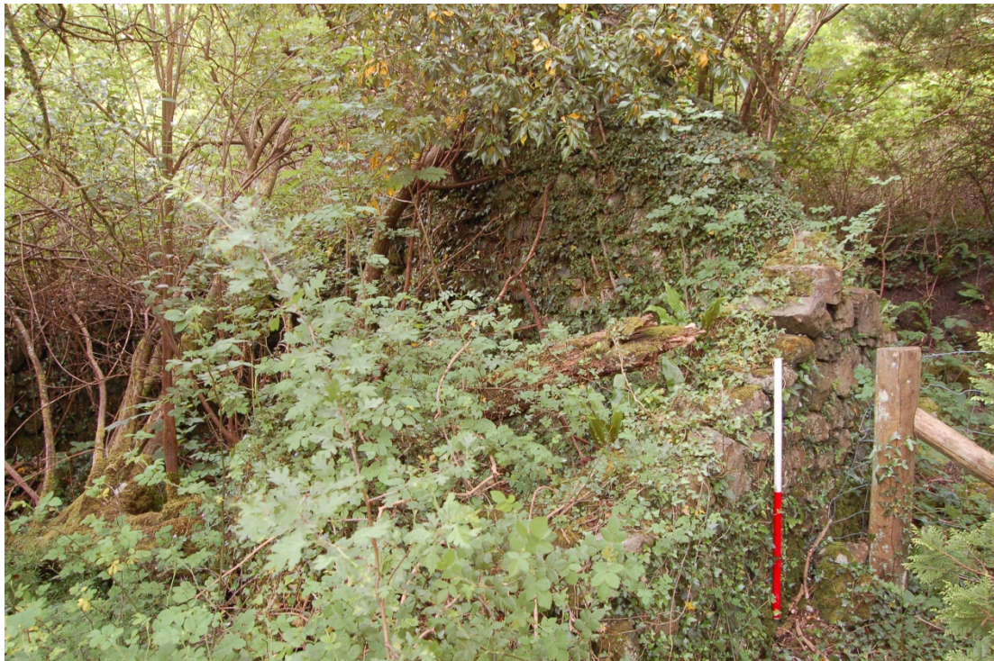
Looking southwest, west gable end of ruinous cottage under thick vegetation, showing tree growing within the building footprint (2012, DAT)