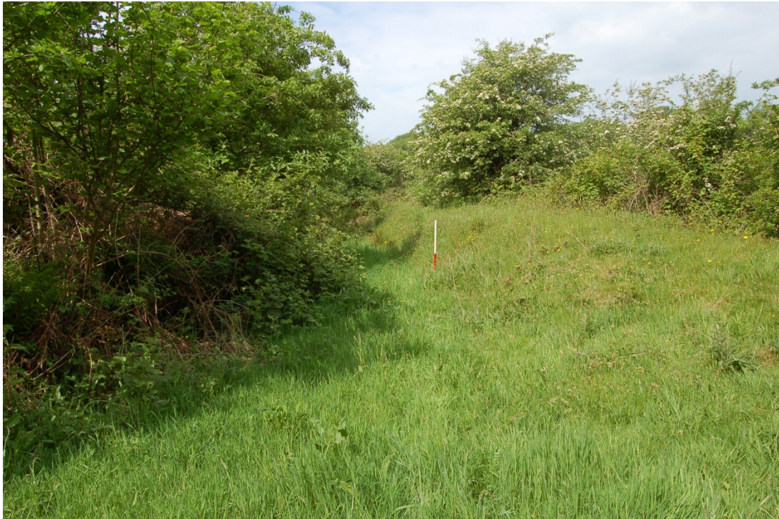
Looking west, from within the mill pond earthwork towards the mill-race (2012,)

13.03.13 - HTML file produced for Glastir management report, file number 387. Dyfed Archaeological Trust, Heritage Management, The Shire Hall, 8 Carmarthen Street, Llandeilo, Carmarthenshire SA19 6AF. tel (01558) 823131, fax (01558) 823133, email info@dyfedarchaeology.org.uk, website www.dyfedarchaeology.org.uk