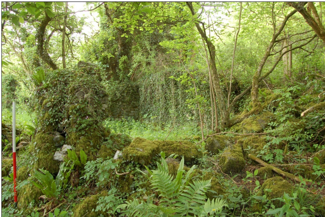
Looking southeast along length of ruinous mill building