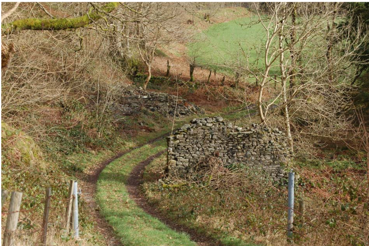
Surviving wall of mill cottage (in foreground) with ruinous mill behind, to left of track (DAT,2013)